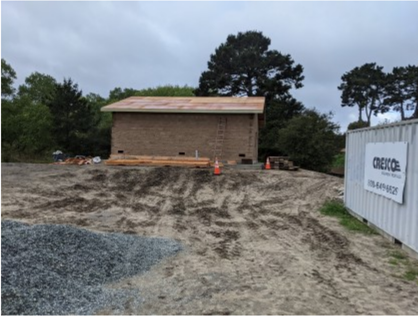
03/25/2021 - Site conditions.