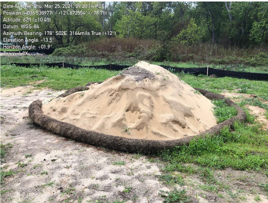
Photo 4. BMPs in place.