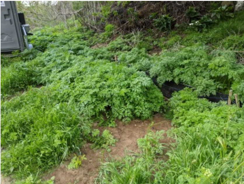
03/25/2021 - Invasive species overgrowing exclusionary fencing in need of removal.