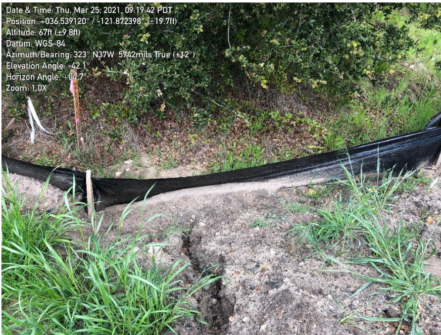
Photo 5. Sediment backed up along silt fence near pad.