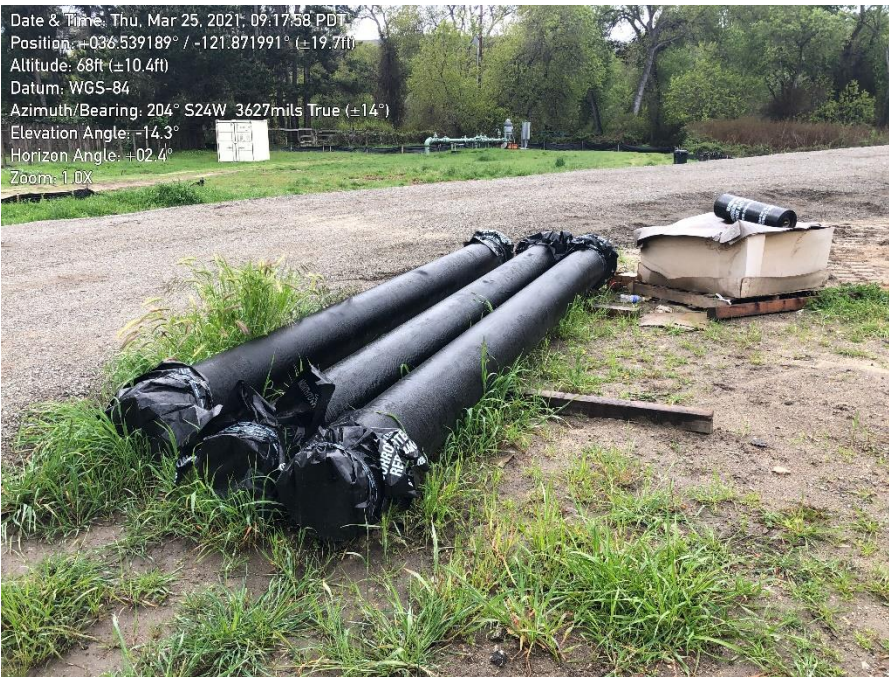
Photo 3. Pipes capped.