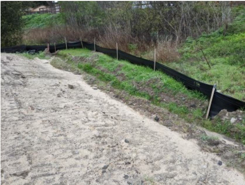
03/25/2021 - Intact exclusionary fencing surrounding work area.