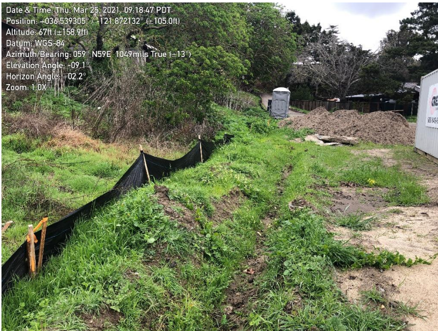
Photo 6. Hemlock growing up around silt fence along north border of site.