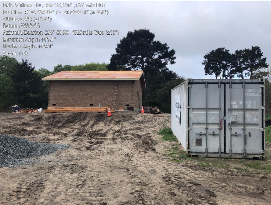
Photo 1. Pump station and overall site conditions.