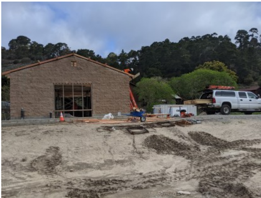
03/22/2021 - Site conditions.