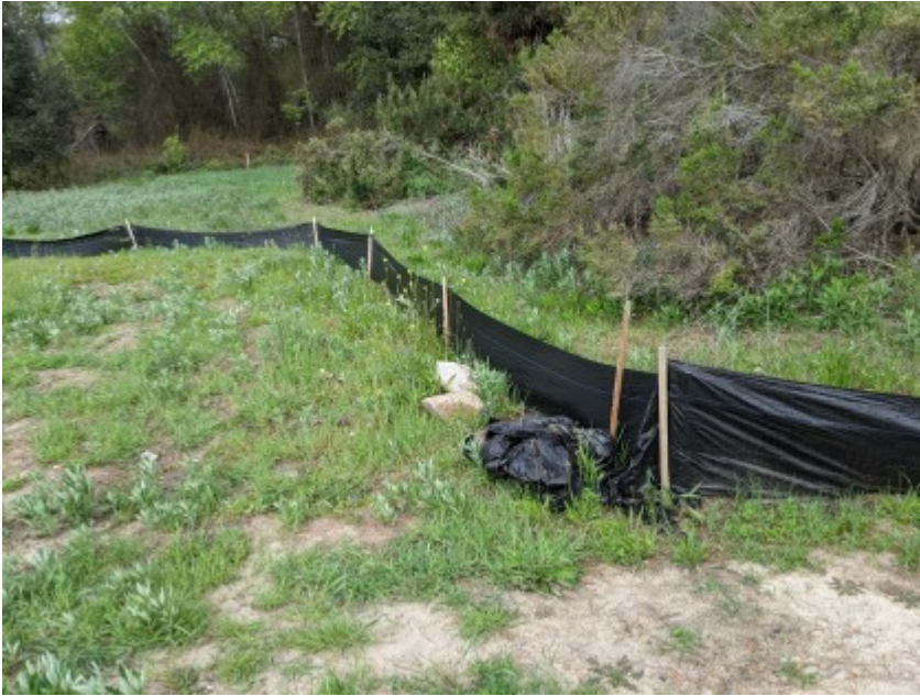
03/22/2021 - Intact exclusionary fencing surrounding work area.