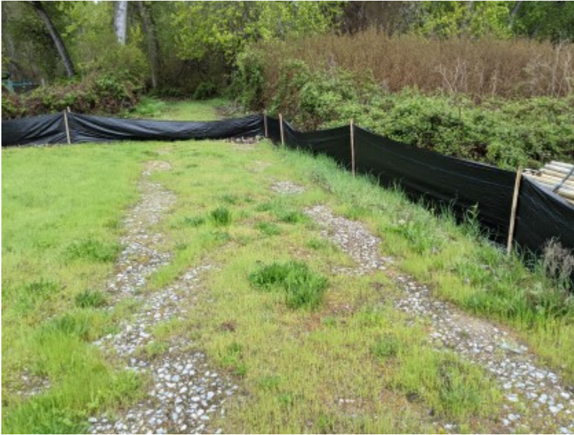
03/25/2021 - Intact exclusionary fencing surrounding work area.