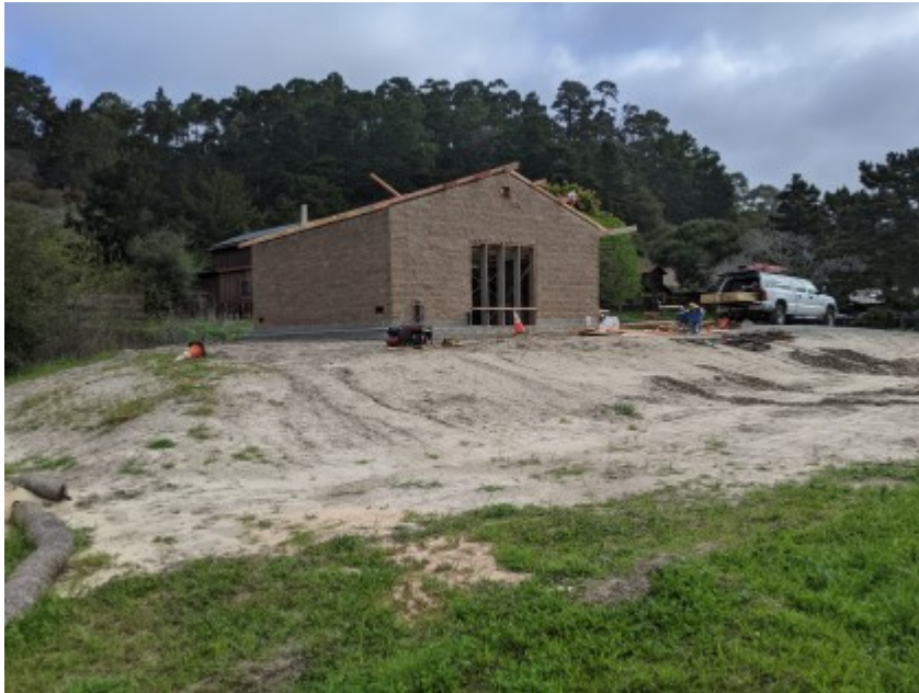
03/22/2021 - Site conditions.