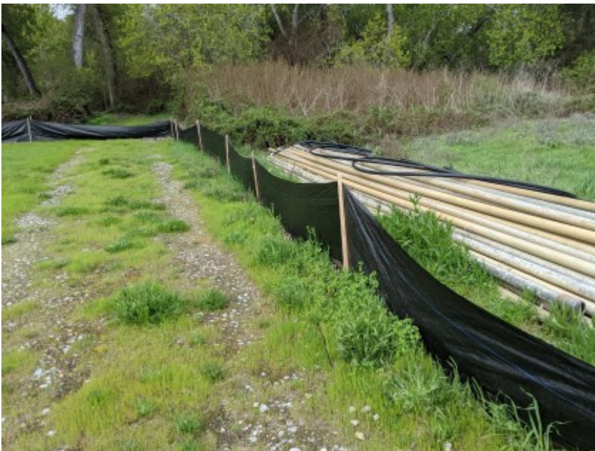
03/22/2021 - Intact exclusionary fencing surrounding work area.