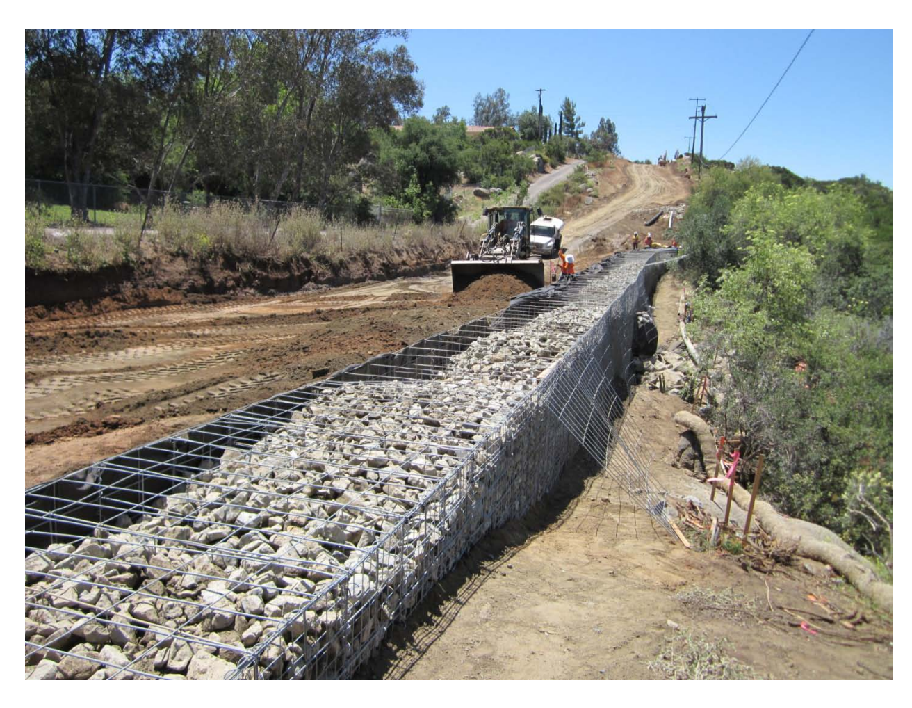
Loritz Property retaining wall. View to the south.