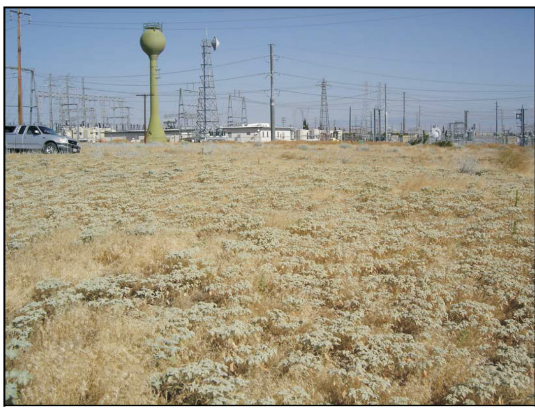
A) Annual grassland habitat in Antelope Substation expansion area.