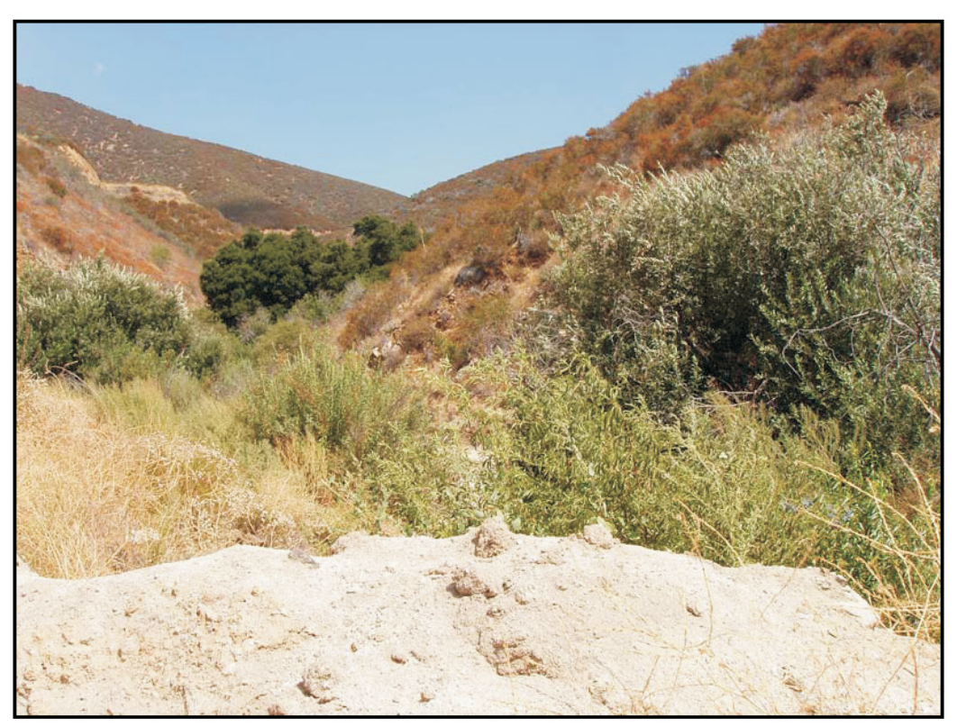
A) Oak riparian (background) within tributary to Bonita Reservoir (~MP 8.5).