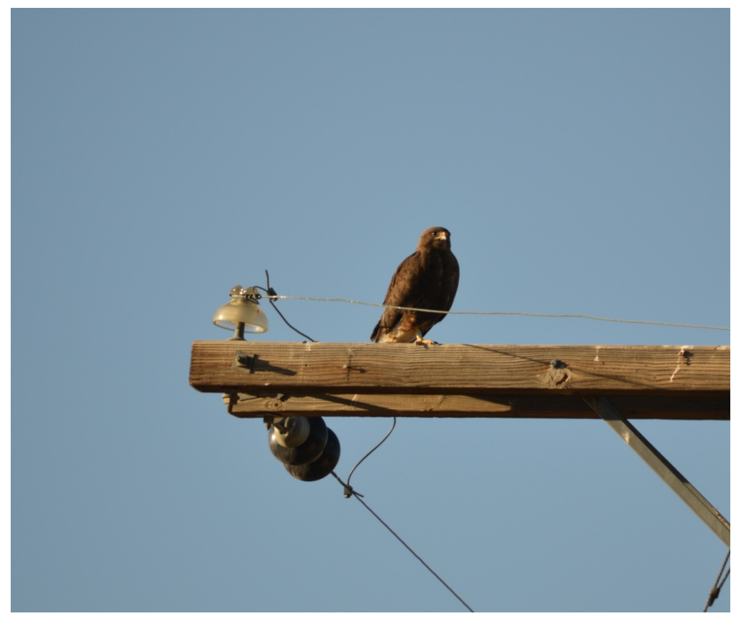
Figure 4: Swainson's hawk near Segment 10.