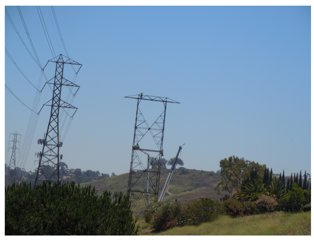
Figure 6: Crews disassemble a tower, Segment 8, Phase 4.