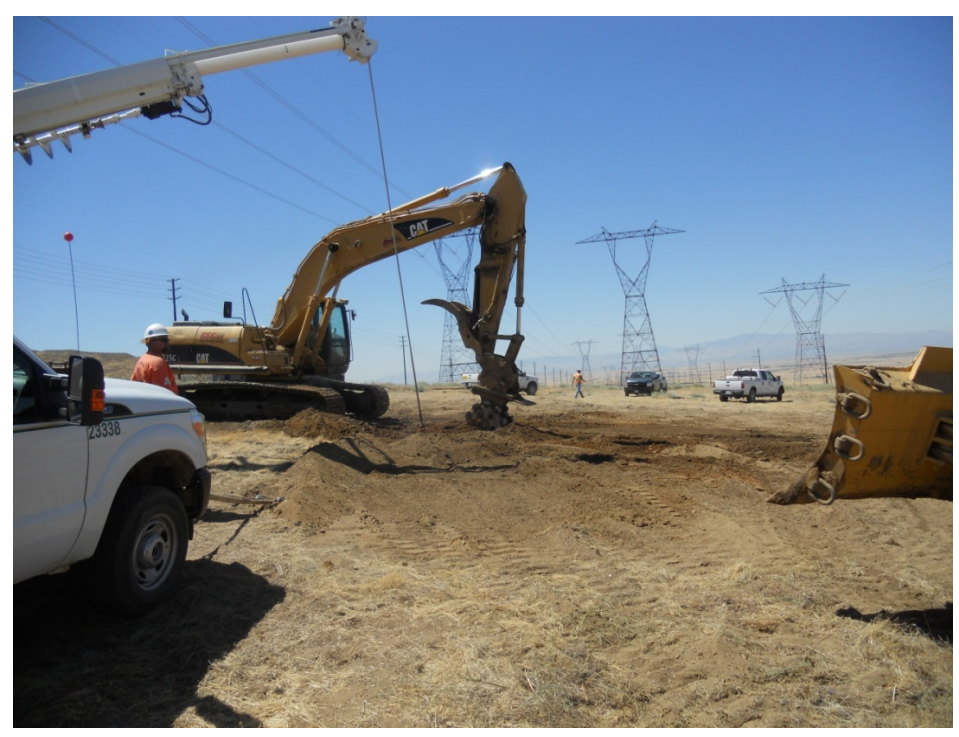
Figure 1: H&H Grading installed snubs in the wire set-up site between Towers 15 and 16, for upcoming wire stringing activity, Segment 4.