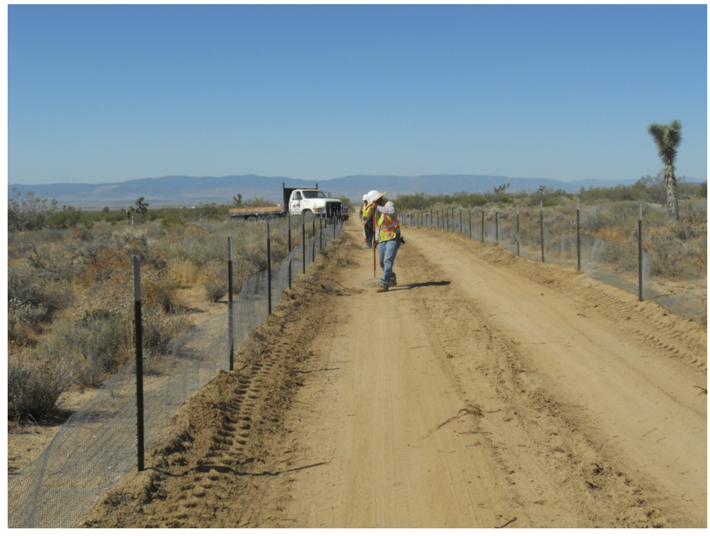
Figure 2: Moore Fence crew raking cut vegetation from General Petroleum Road, Segment 10.