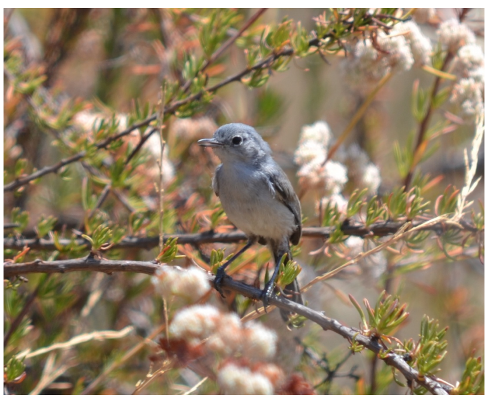
Figure 8: Federally threatened Coastal California gnatcatchers have been observed in Segment 7 and 8.