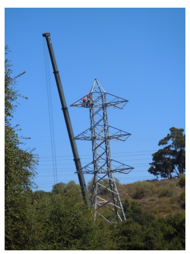
Figure 7: Crews build a tower within the PHLNHA, Segment 8 Phase 4.