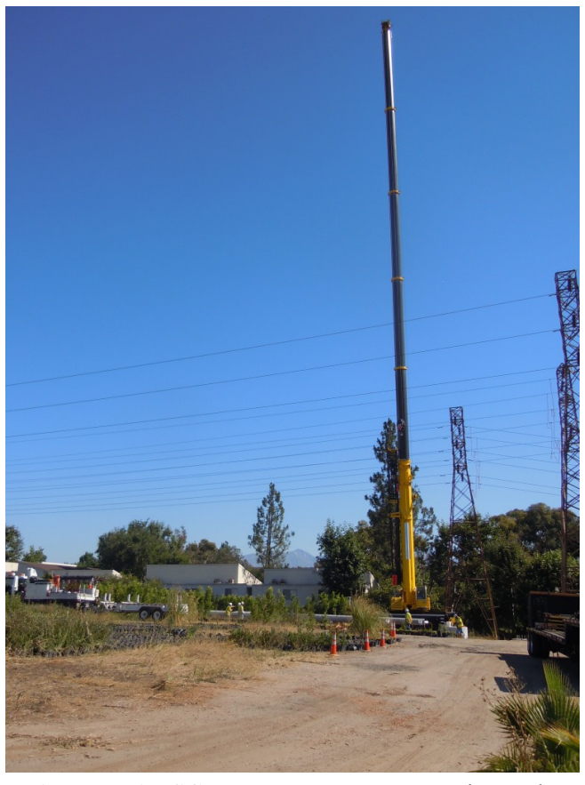
Figure 5: An SCE crew prepares to set a riser pole, Segment 7 66 kV.