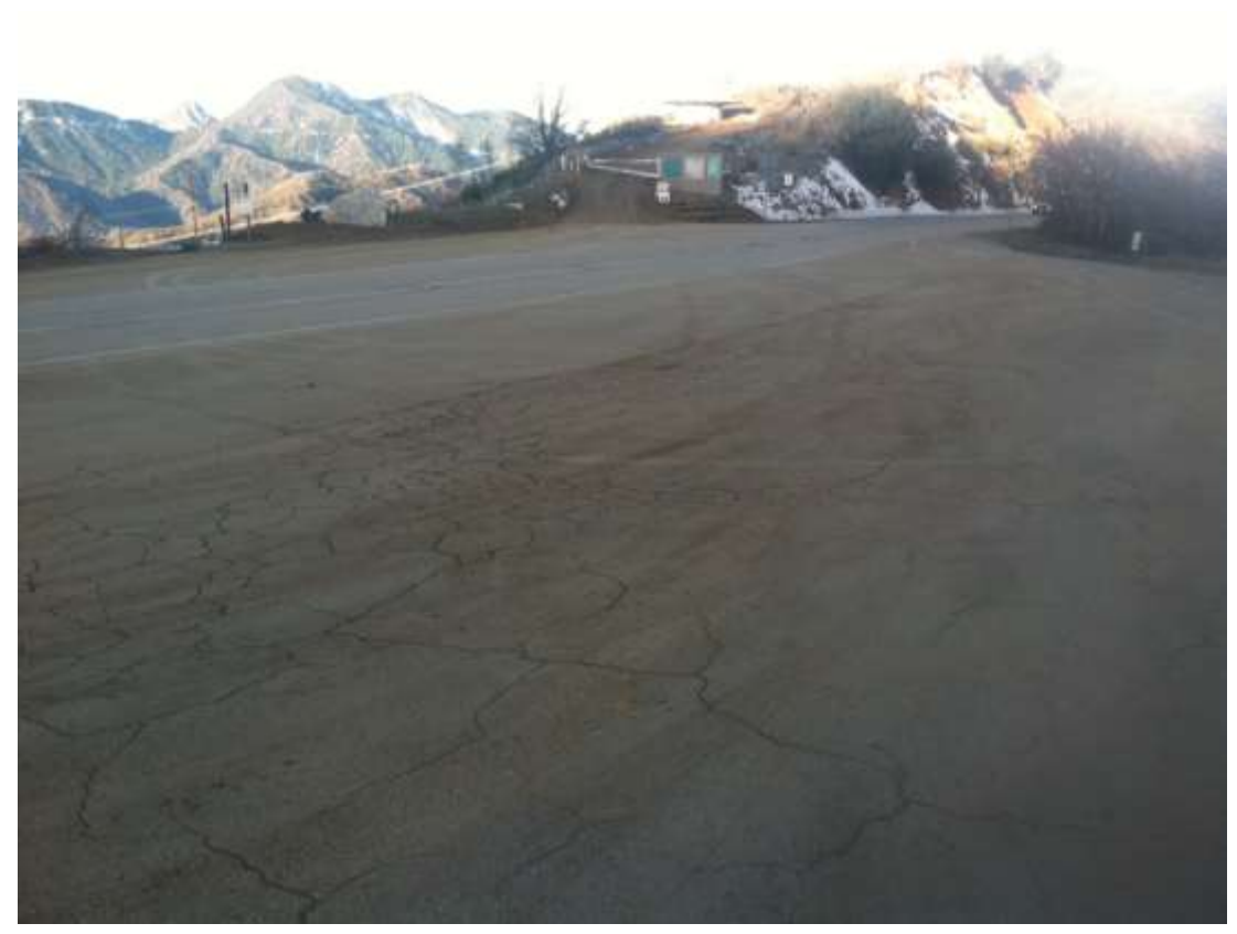
Figure 3: Visible trackout from Loop Road L prior to start of work.