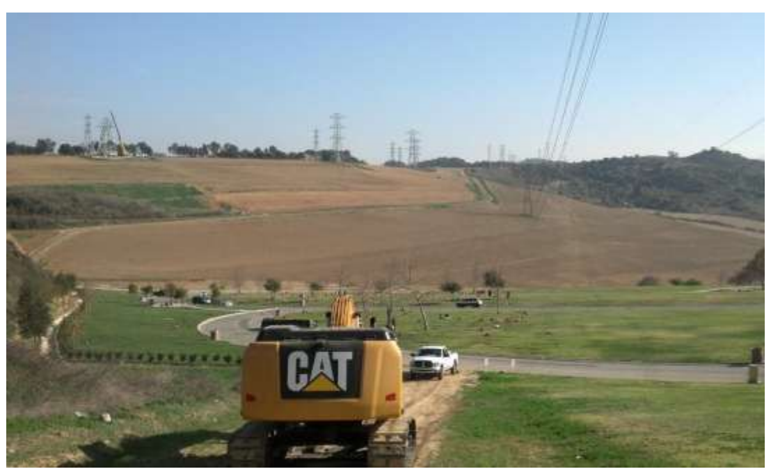
Figure 4: View south from Rose Hills shoofly with tower erection occurring at M45-T1 in the background, Segment 8, Phase 4.