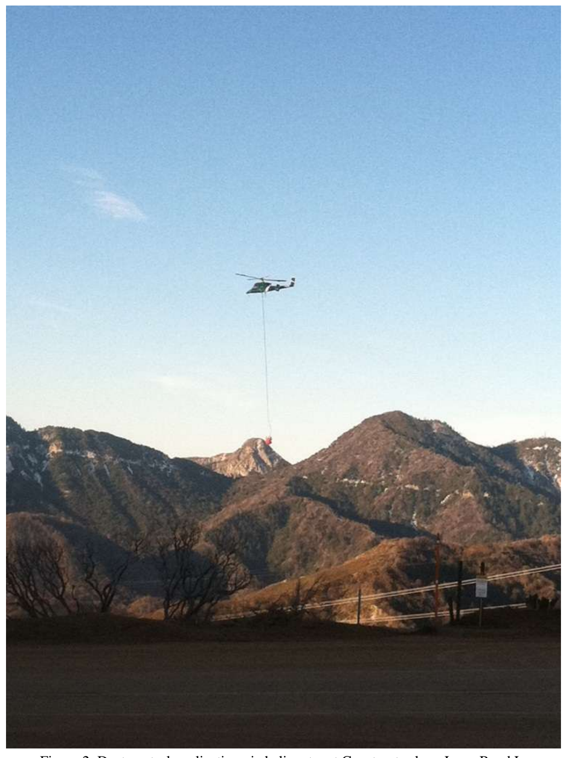
Figure 2: Dust control application via helicopter at Constructs along Loop Road L.