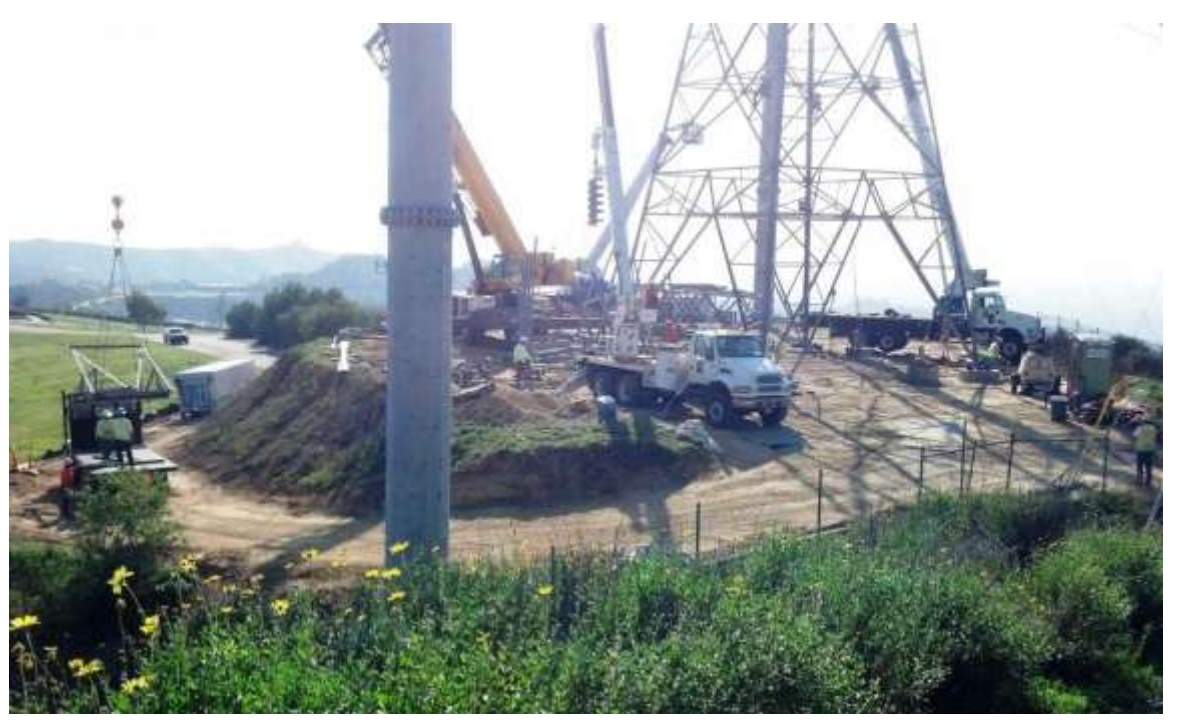
Figure 5: Tower work at the Rose Hills shoofly and M44-T2, Segment 8, Phase 4.