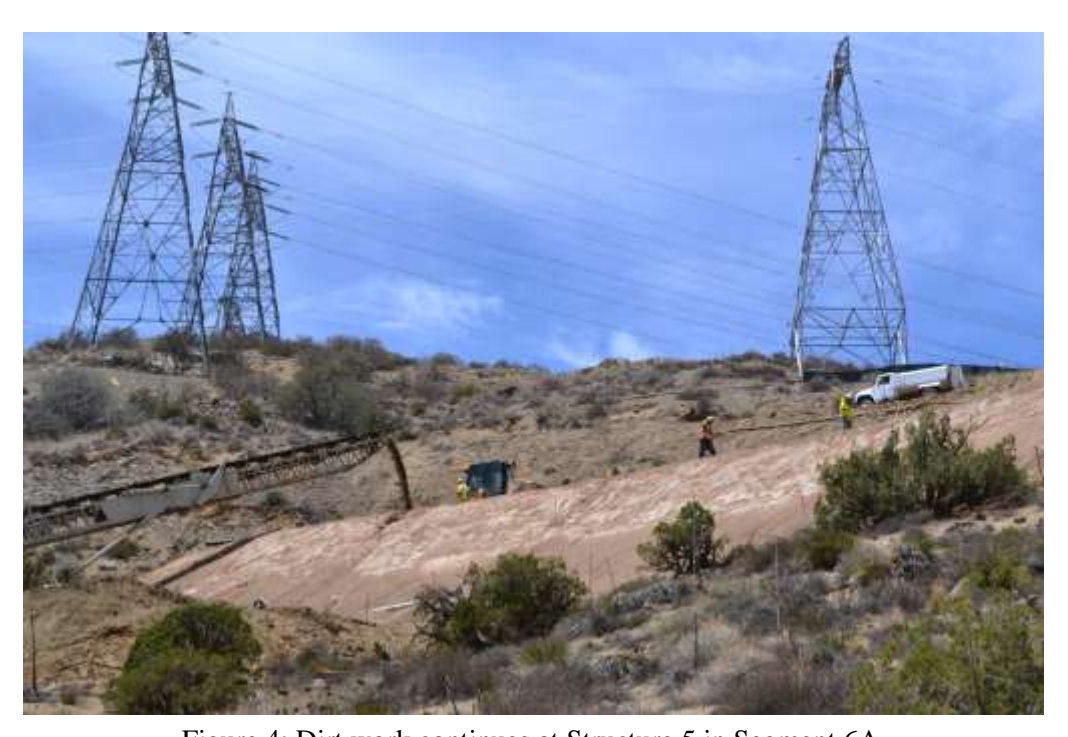
Figure 4: Dirt work continues at Structure 5 in Segment 6A.