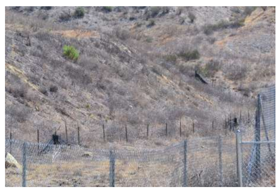
Figure 1: Silt fencing installed surrounding a dirt stockpile area in Segment 1 in non-functioning condition.