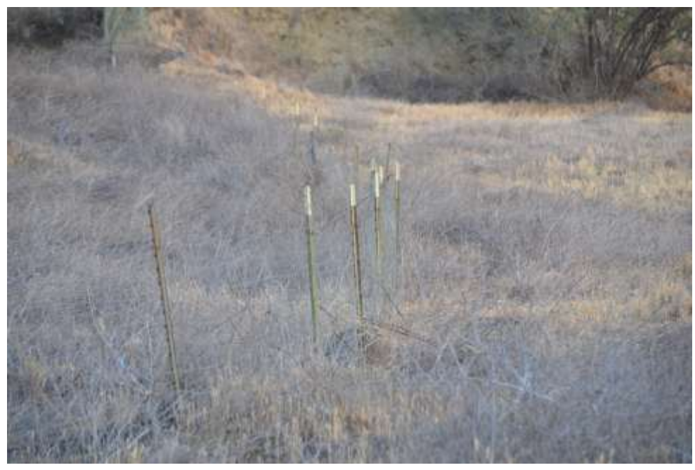
Figure 3: Remnants of silt fencing in the Haskell Canyon area from Segment 1.