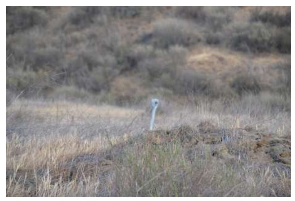
Figure 2: Anchor visible at the Haskell Canyon Segment 1 crossing location.