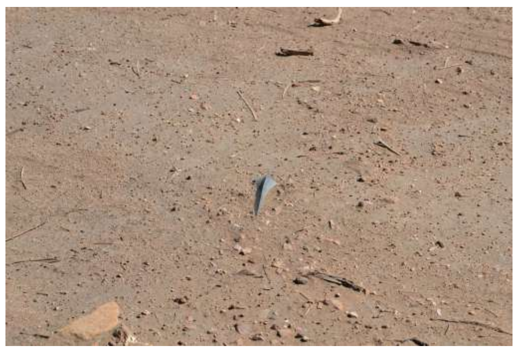
Figure 7: Pieces of steel from tower wreck-out at Aliso HAY were partially buried in many locations at the yard.