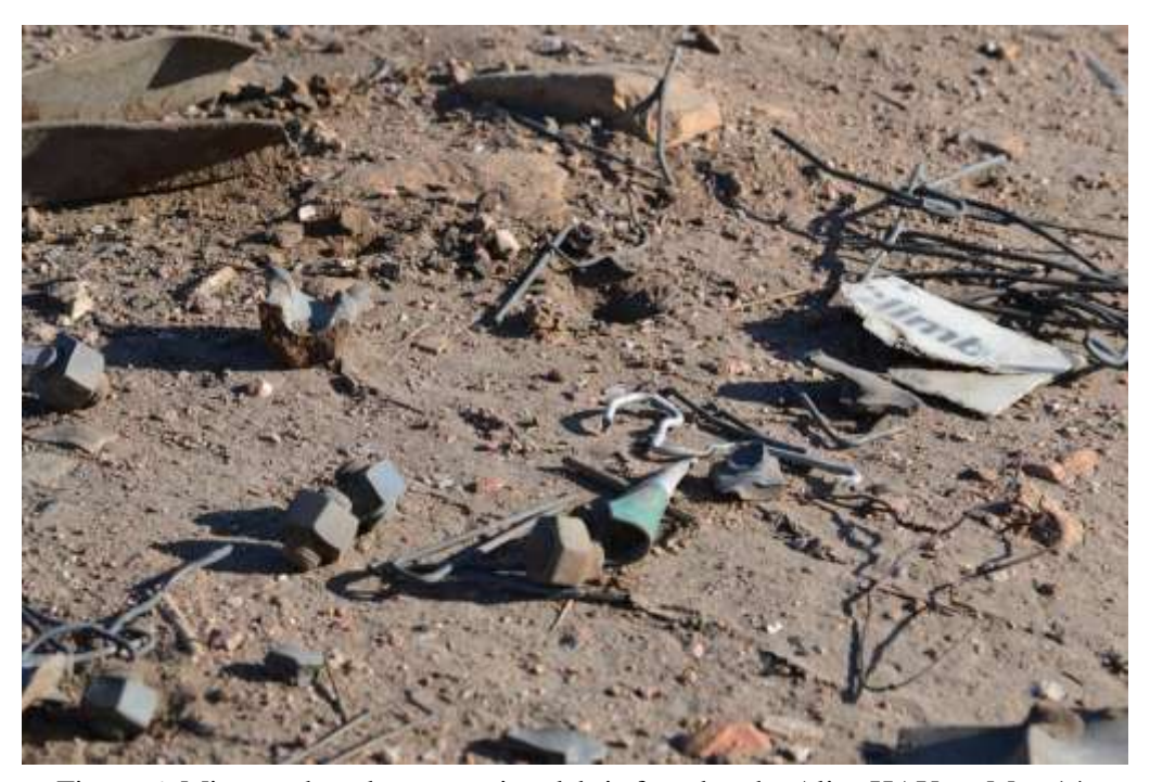
Figure 6: Microtrash and construction debris found at the Aliso HAY on May 14.