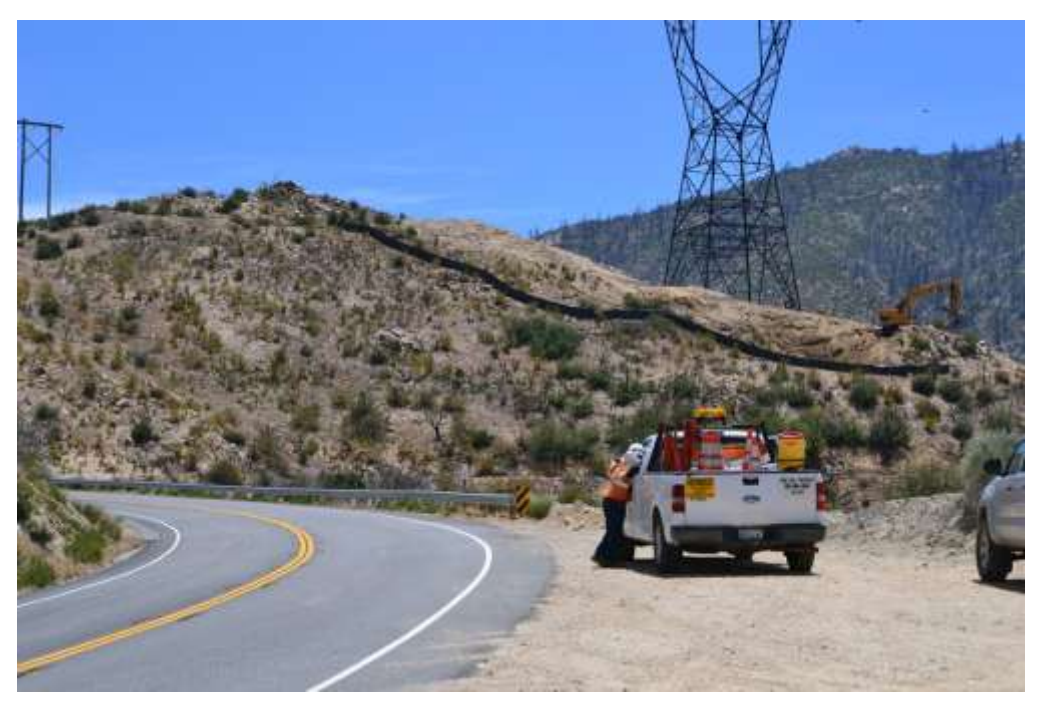
Figure 5: Grading at Construct 23 with construction traffic flaggers along Angeles Crest Highway, Segment 6A.