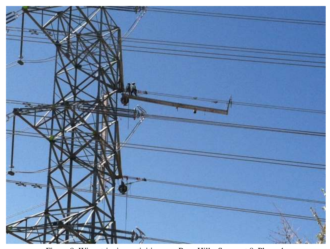
Figure 8: Wire stringing activities near Rose Hills, Segment 8, Phase 4.