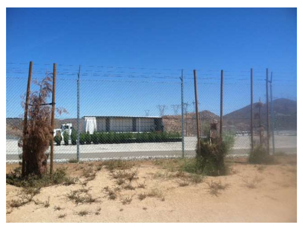
Figure 1: Dead trees were replaced along the outside of the Vincent Substation.