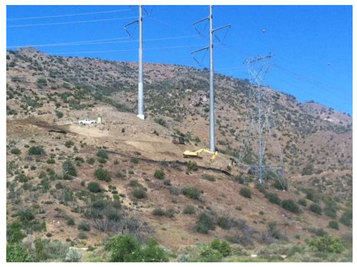
Figure 3: Final stabilization activities, Construct 10, Segment 6.