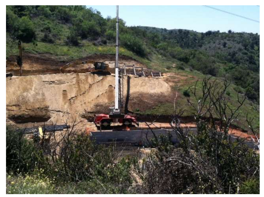
Figure 5: Soldier pile wall construction at Tower 57-T1, Segment 8, Phase 1.