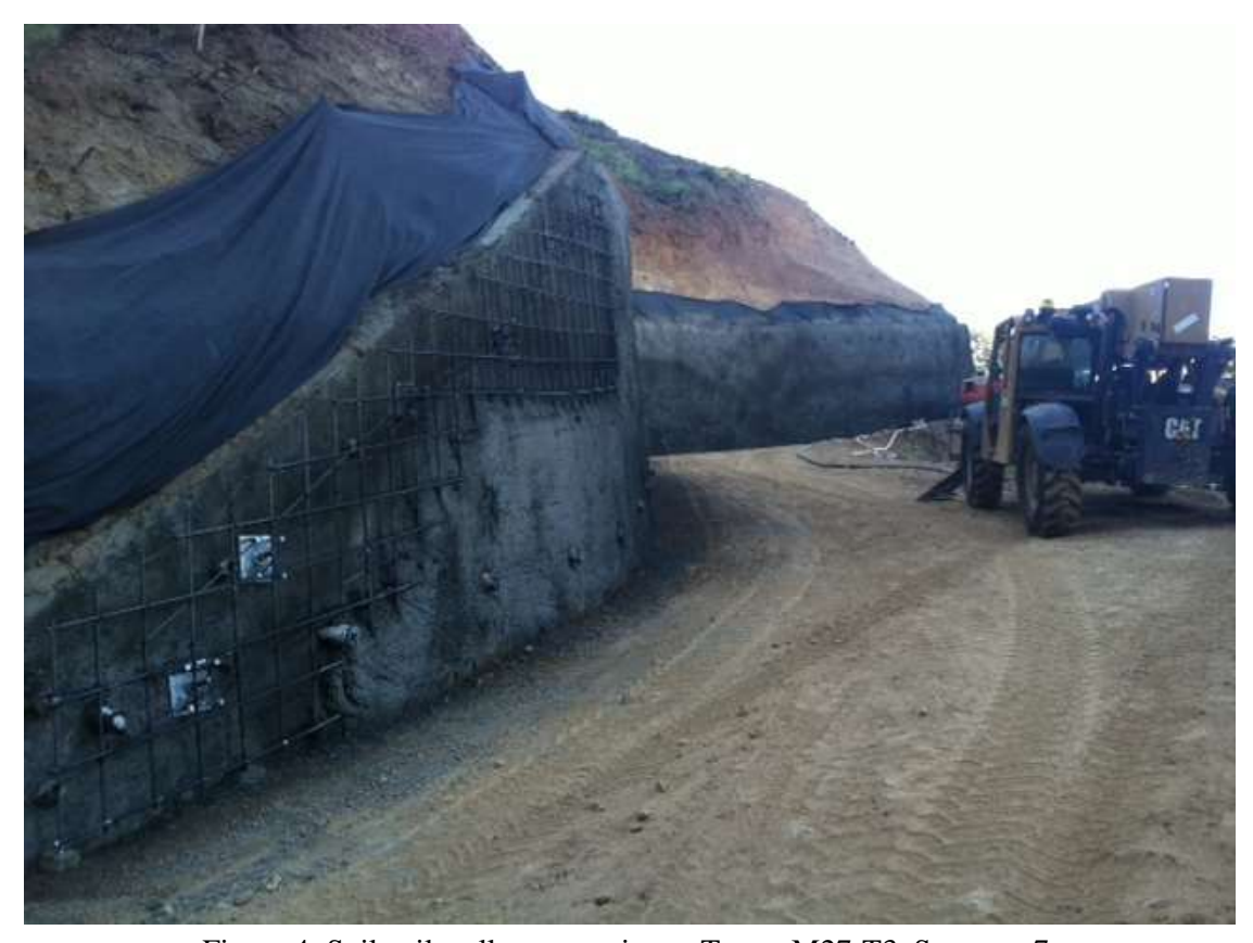
Figure 4: Soil nail wall construction at Tower M27-T3, Segment 7.