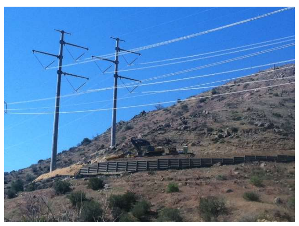
Figure 2: Final stabilization activities, Construct 8, Segment 6.