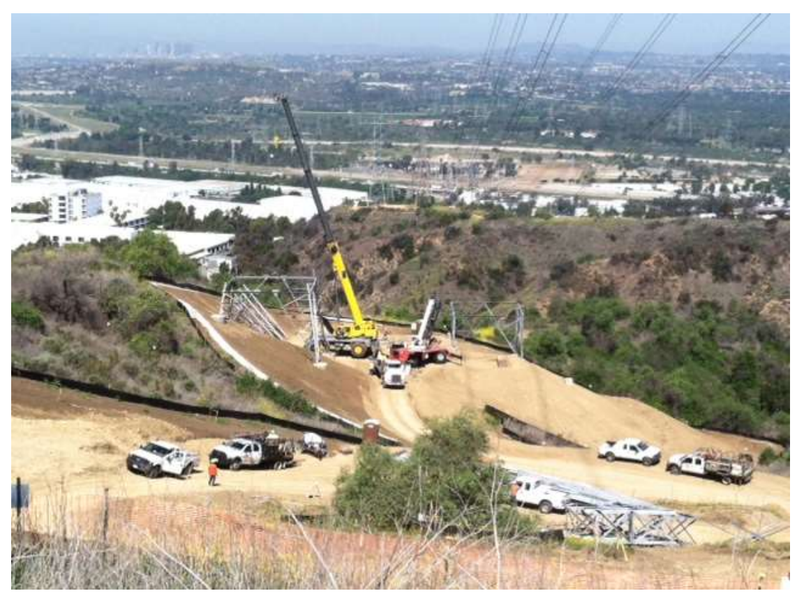
Figure 7: Tower assembly at Tower M43-T3, Segment 8, Phase 4.