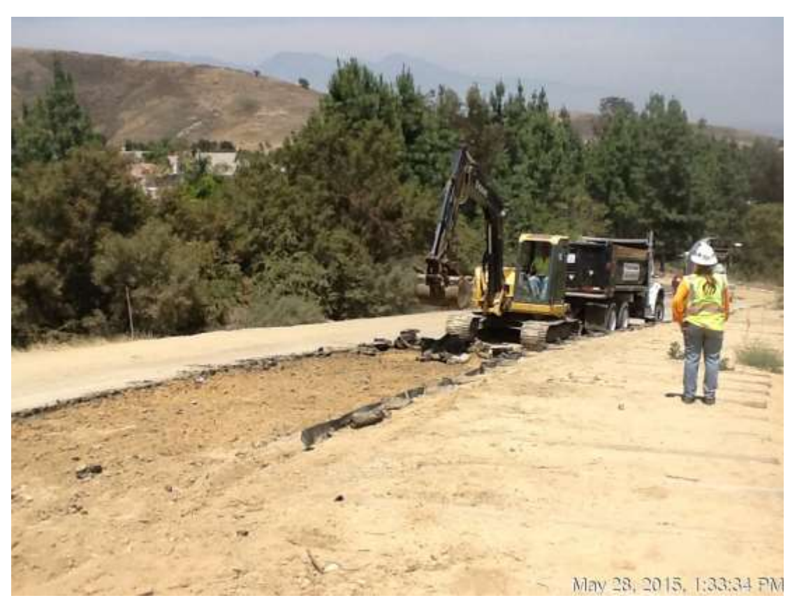
Figure 6: Asphalt removal for Class II Base preparation for driveway to WTS, 500 kV underground.