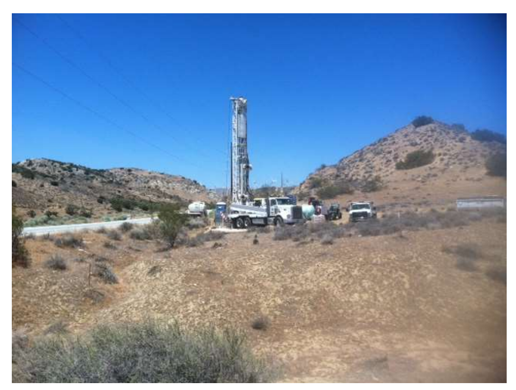
Figure 1: Ground Rod #16 excavation for cathodic protection activities, Segment 3B.