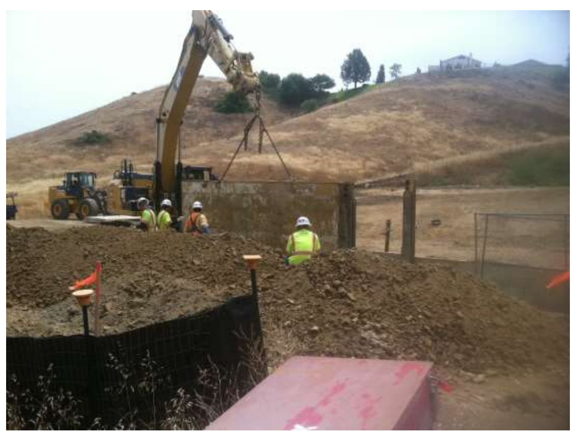
Figure 3: Excavation activities at VC#4, 500 kV Underground.