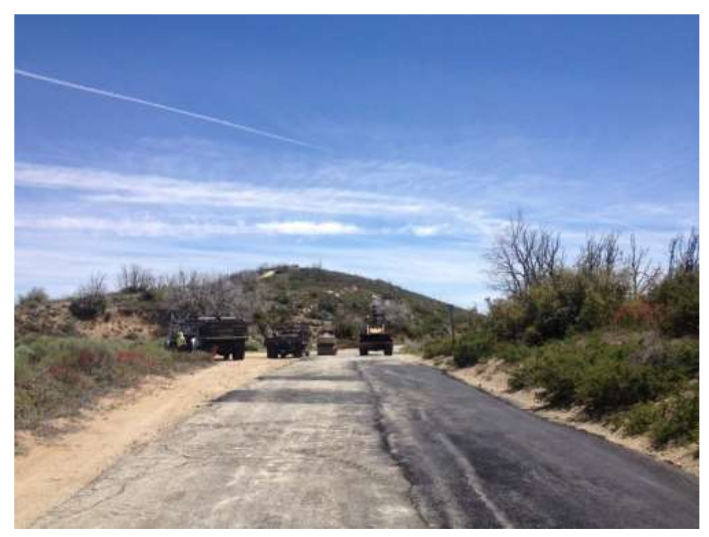
Figure 2: Paving activities along Mt. Gleason Road, Segment 11C.