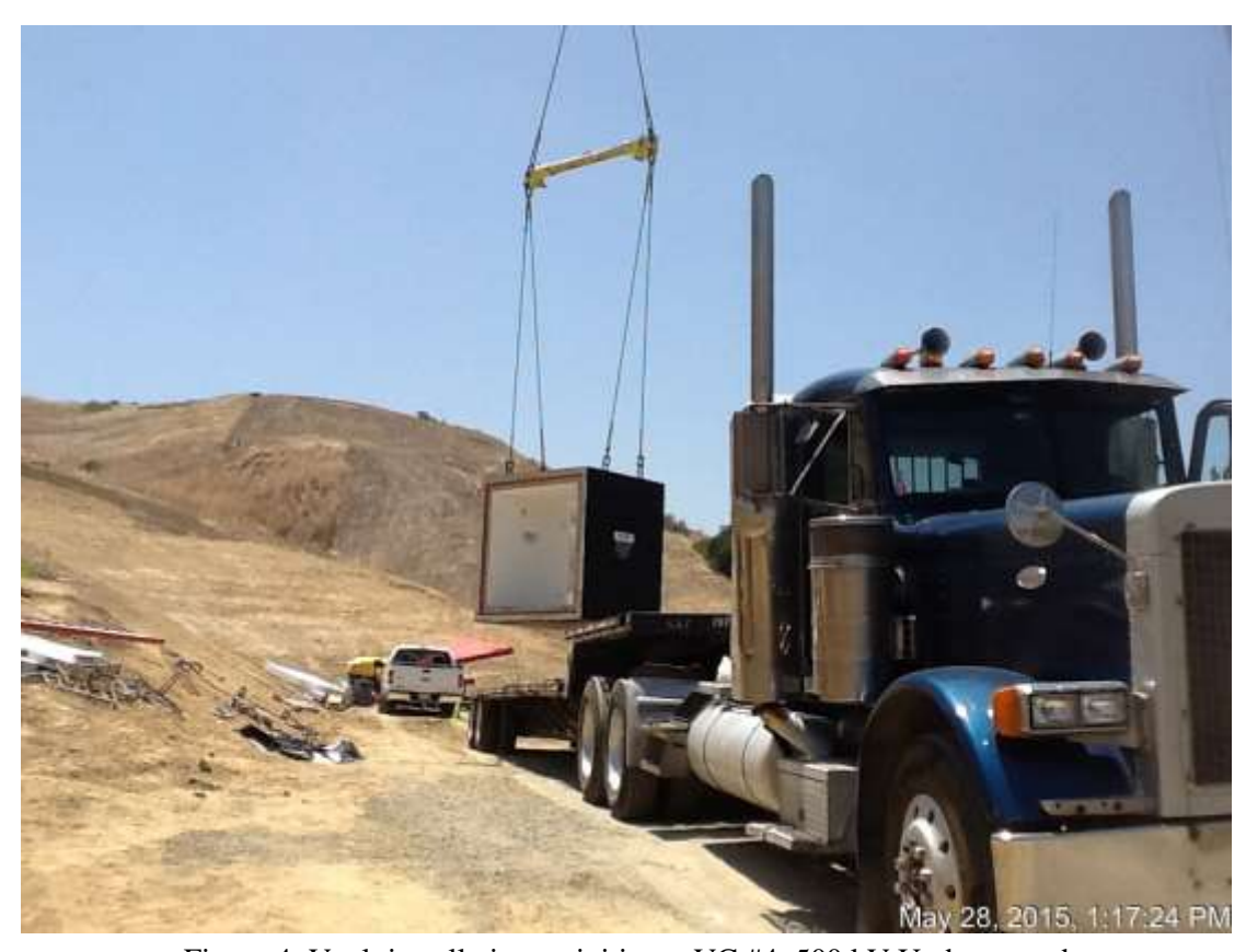
Figure 4: Vault installation activities at VC #4, 500 kV Underground.