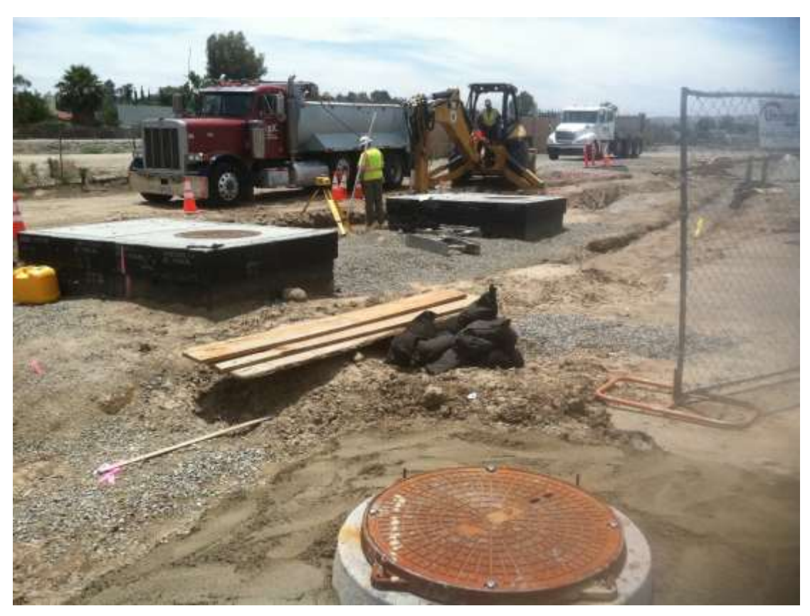
Figure 5: In/Out trench activities at VC #14, 500 kV Underground.