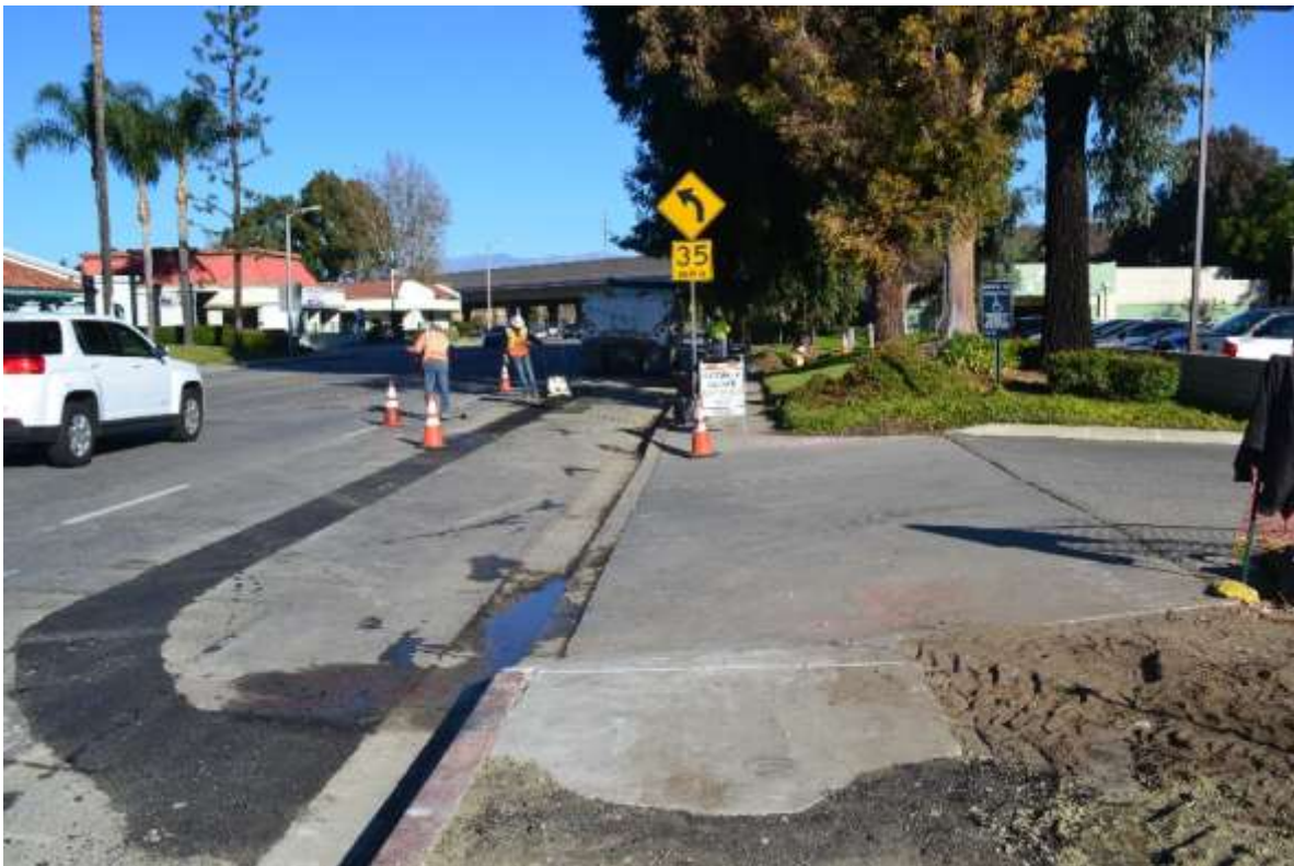
Figure 6: Telecom crews working along Pipeline Avenue between the ETS tie-in and an existing manhole, 500 kV Underground.