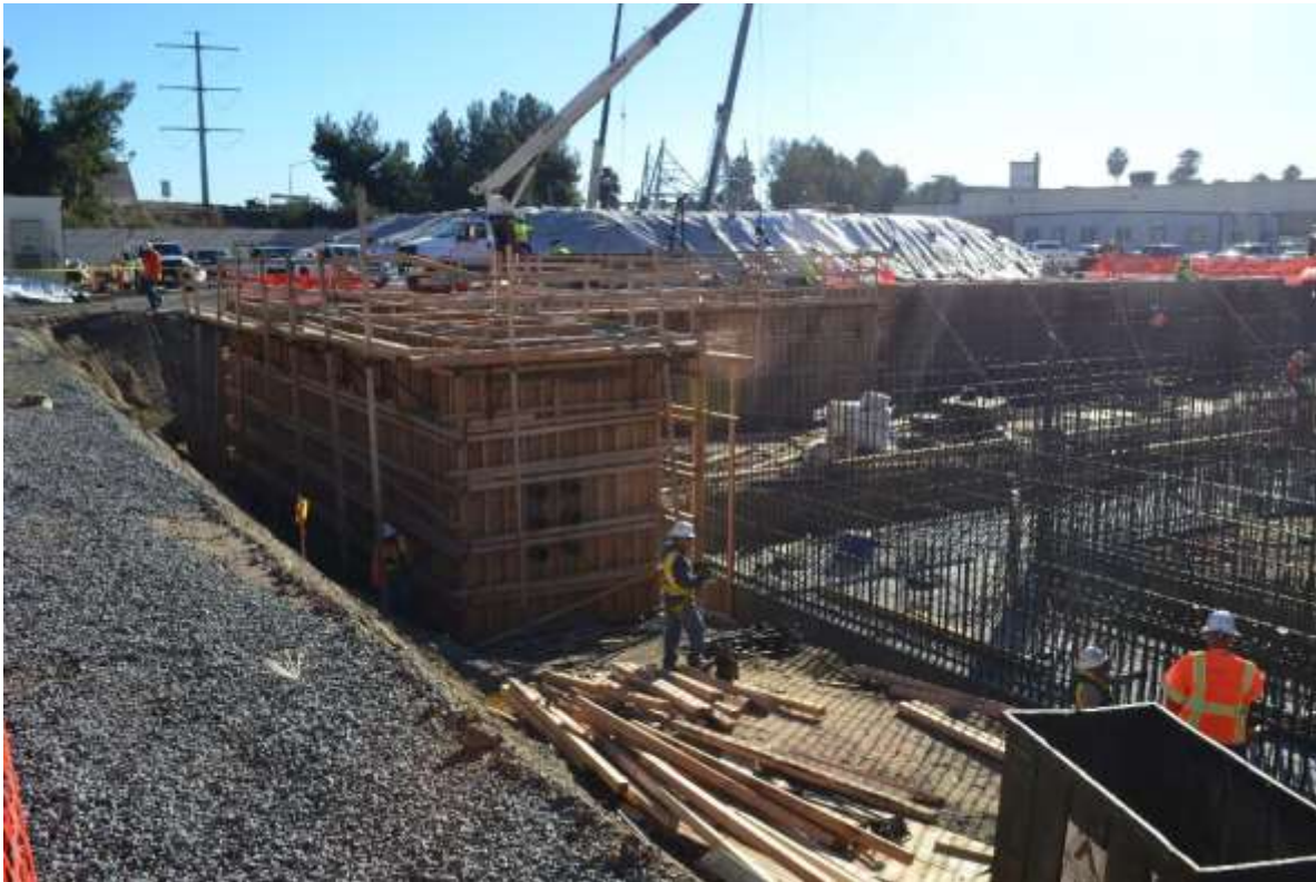
Figure 5: Rebar installation, form work, and concrete placement at the ETS, 500 kV Underground.