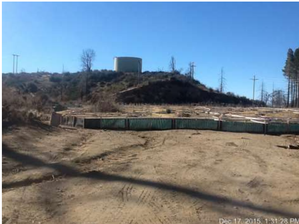
Figure 2: Container plants and hydroseeded restoration area at Rabbit's Peak HAY, Segment 6.