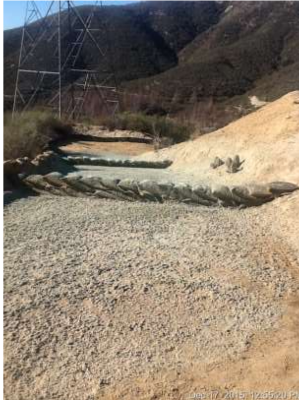
Figure 1: Recent restoration grading and hydroseeding at Tower 59, Segment 6B.