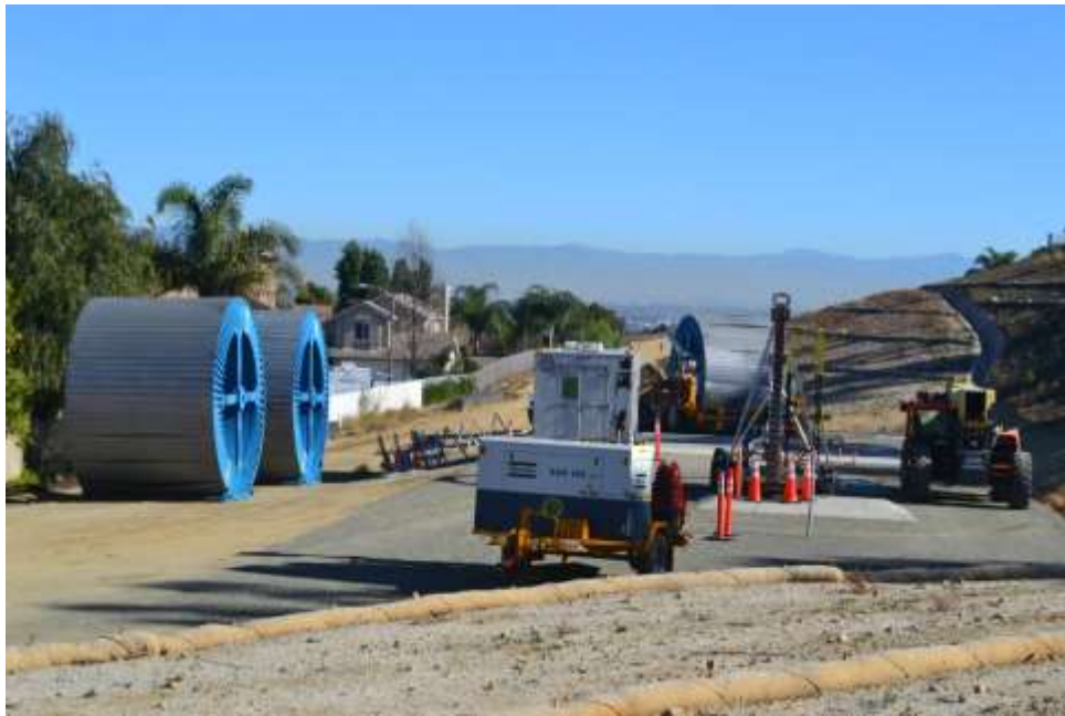
Figure 3: Cable pulling equipment for installation operations at VC #5, 500 kV Underground.