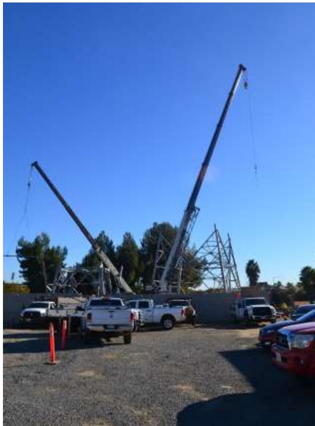
Figure 4: Assembly and erection of Tower M64-T1X just outside of the ETS, 500 kV Underground. Conductor installation is planned for January 2016.