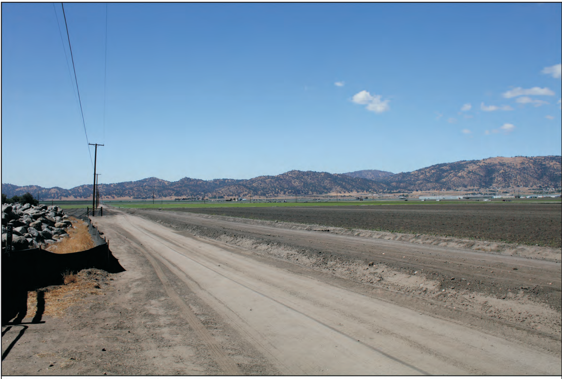
View from: Southeast of Site - Existing Condition