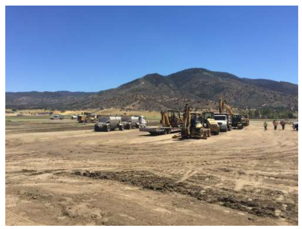
Figure 1 – Construction crews continued with soil import, grading, and compaction activities at the Banducci Substation, August 14, 2017.