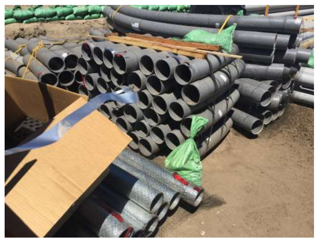
Figure 2 – Stockpiled conduit stored on the substation site was covered in compliance with Mitigation Measure B-5, August 14, 2017.