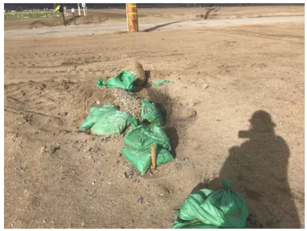
Figure 3 – Bird netting used to cover ends of conduit was left unsecured and became caught in perimeter sandbag berm causing a microtrash and wildlife entrapment concern documented by the CPUC EM on February 14.