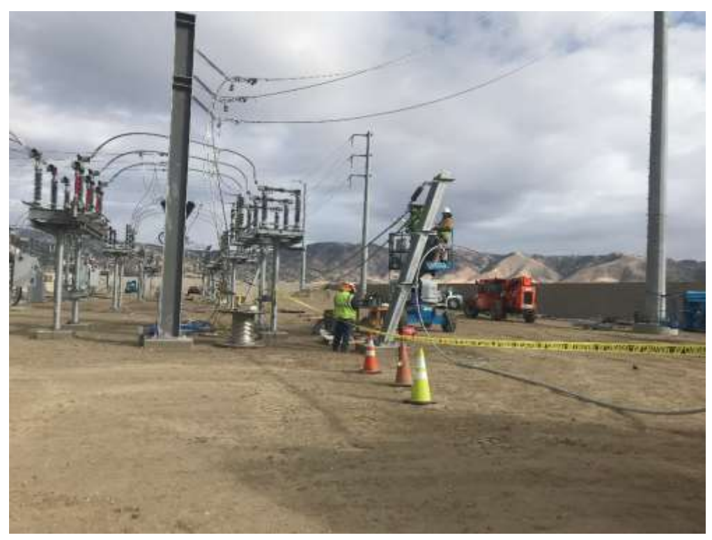
Figure 1 – Henkels and McCoy crew installing jumpers on the 66 kV rack.