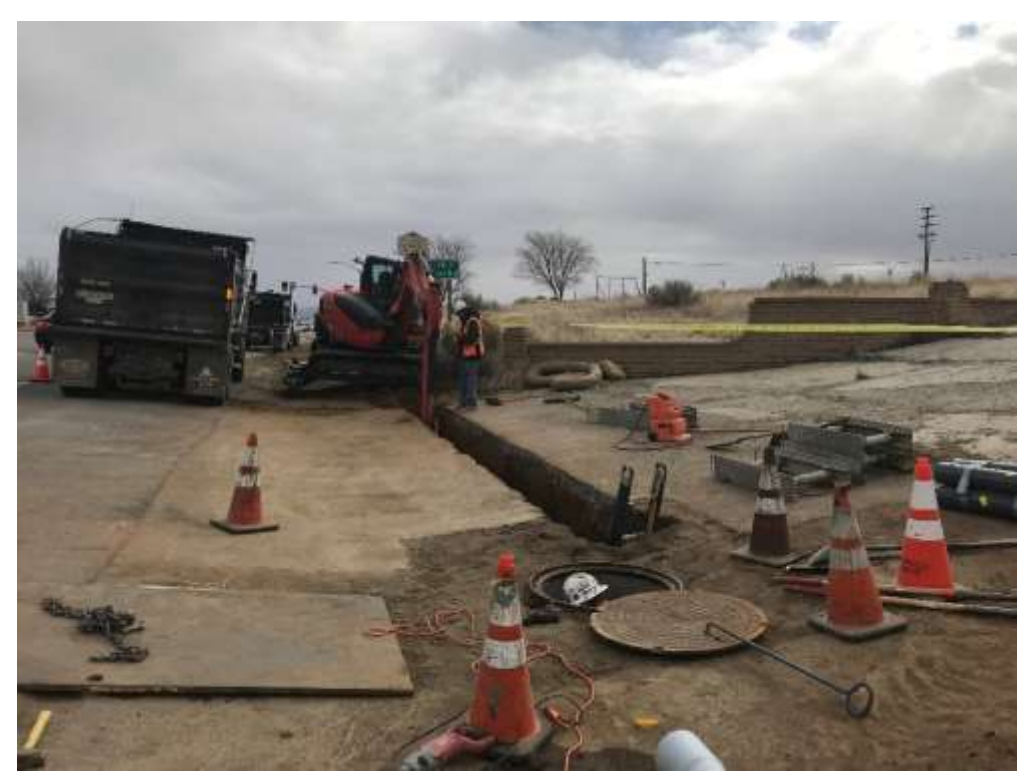
Figure 2 – Telecom underground crews trenching to tie in with overhead sections installed along Highway 202 and Woodford Tehachapi Road.