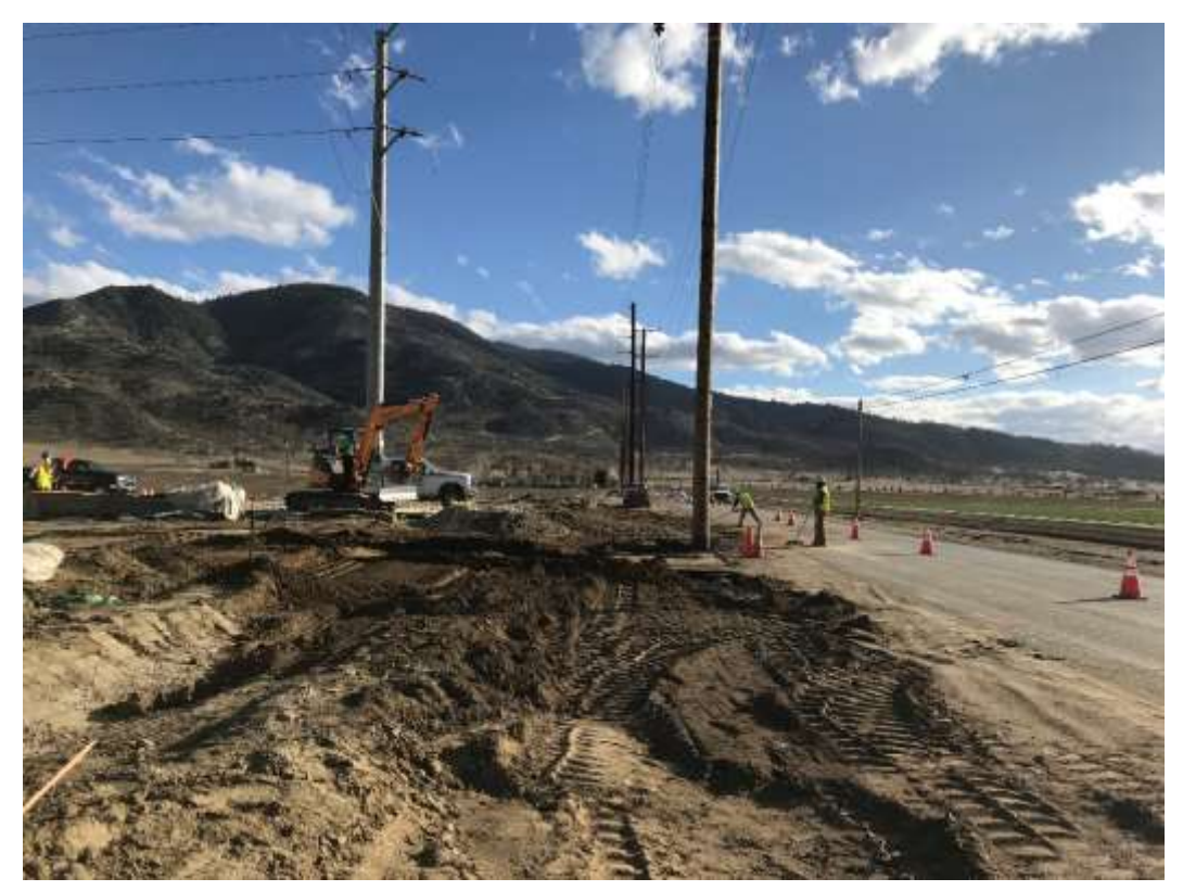
Figure 4 – Crews using brooms to clean off mud from the Substation entrance.