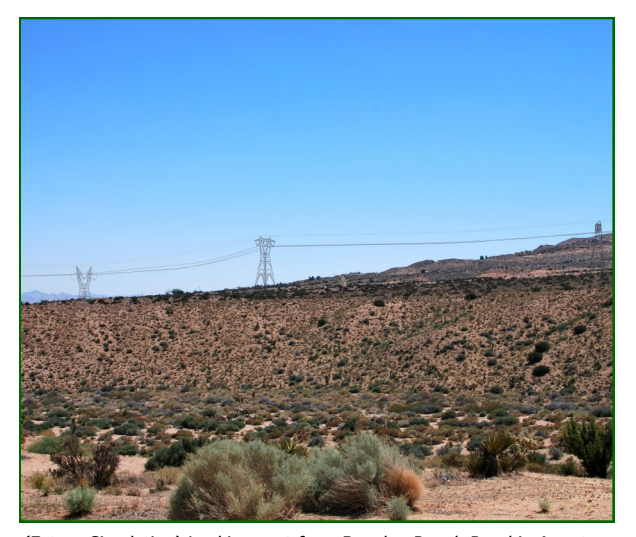
(Future Simulation) Looking east from Bowden Ranch Road in Arrastre Canyon, Lucerne Valley. (Alternative, Segment 6)

Segments 11, 9, 8: Combined, these segments provide an alternate to Segment 1. This alternative route heads west from south of Interstate 40 (Segment 12) through the Marine Corps Logistics Base (MCLB) Barstow and then southwest parallel to SR-247 and then parallel to Stoddard Wells Road until Stoddard Valley Road. About 20.5 miles of doublecircuit 220-kV T/L would be constructed.