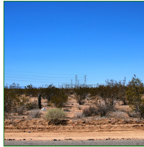
(Future Simulation) Desert View Substation facing west