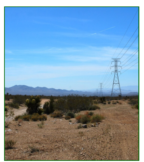
(Future Simulation) Looking southeast from the Lucerne Valley Cutoff, North Lucerne Valley. (Proposed Segment 2)

The Coolwater-Lugo Transmission Project proposed by Southern California Edison (SCE) includes new transmission infrastructure along approximately 63 miles of new and existing rights-of-way (ROW) from the existing Coolwater Generation Station Switchyard (Coolwater Switchyard) in Daggett, California, to the existing Lugo Substation in Hesperia, California. The proposed transmission lines (T/Ls) would transverse approximately 15 miles of lands managed by the U.S. Department of Interior Bureau of Land Management (BLM), with the remainder on private or other public lands within San Bernardino County. Approximately 44 miles of the proposed T/L route would parallel or be within existing overhead utility ROWs. To