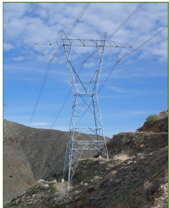
High voltage (500-kV) AC transmission lines