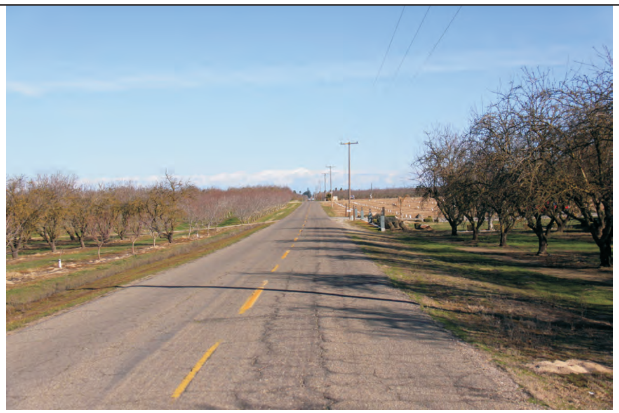
Photograph 15. View from Mercedes Avenue just east of Santa Fe Drive.