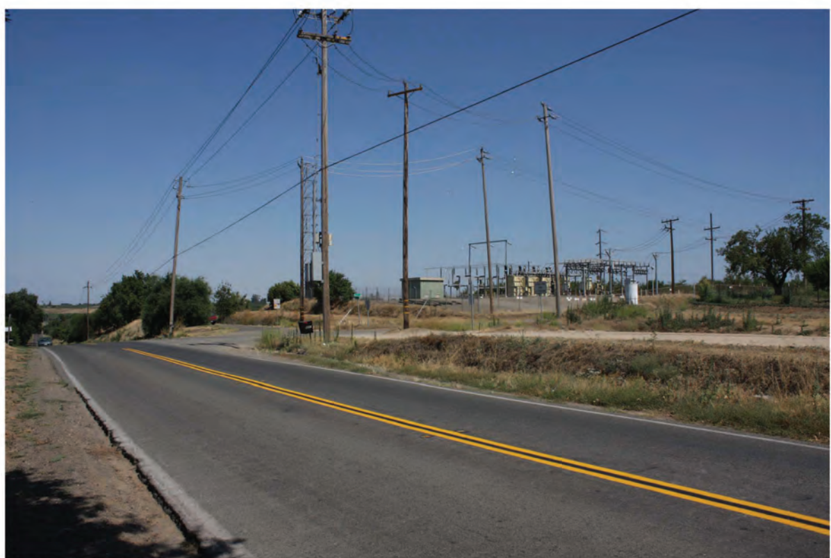
Photograph 2. View from Meadow Drive near West Lane looking southeast.