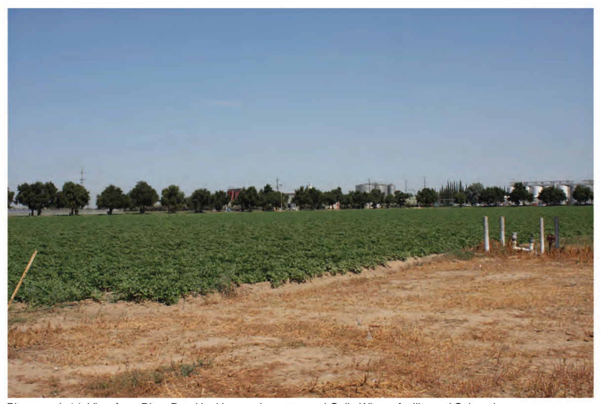
Photograph 14. View from River Road looking northwest toward Gallo Winery facility and Substation.