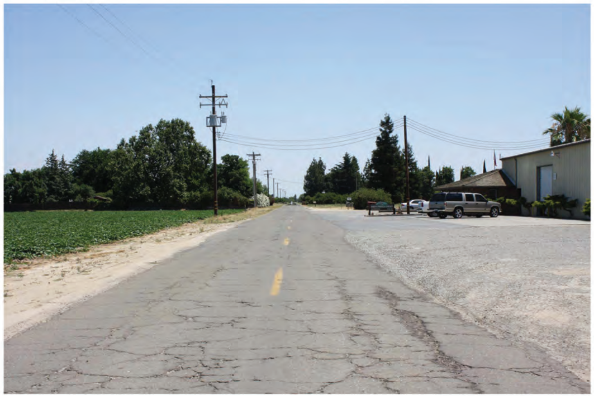
Photograph 10. View from Magnolia Avenue near Lincoln Boulevard looking east.