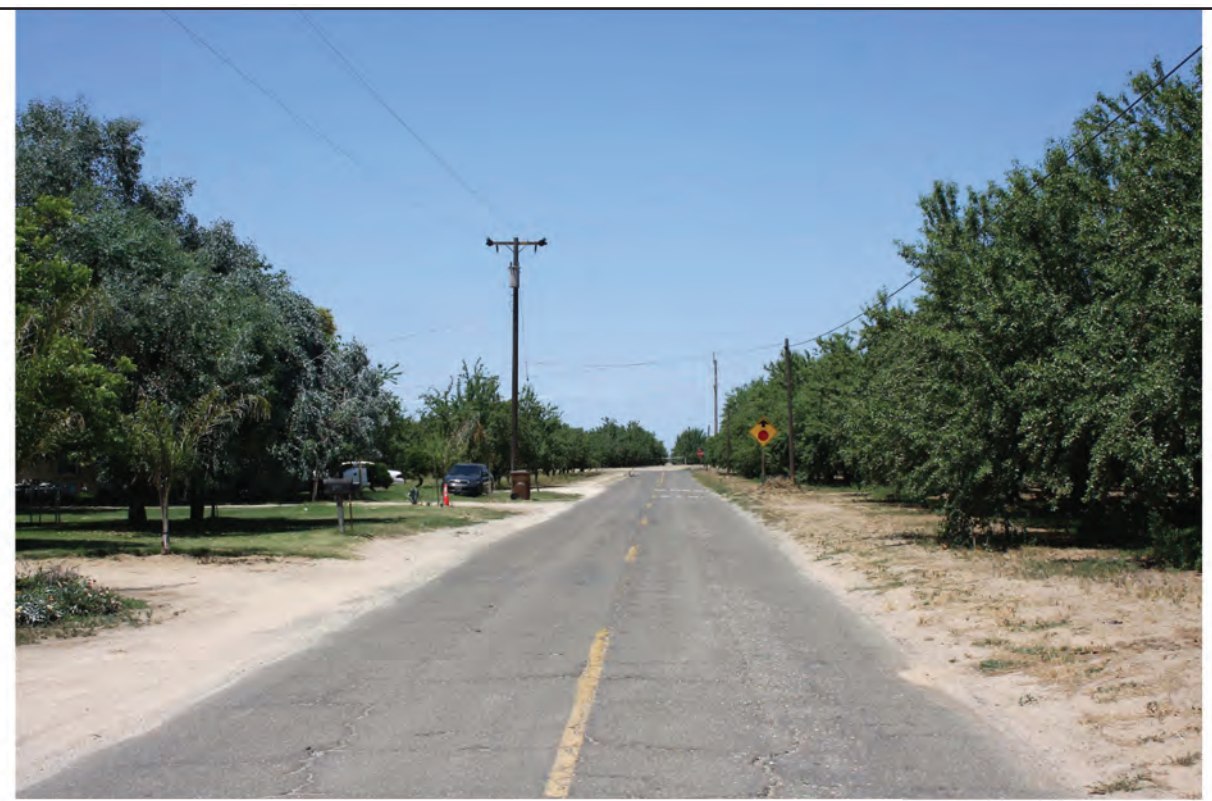
Photograph 7. View from Arena Way near Walnut Avenue looking north.