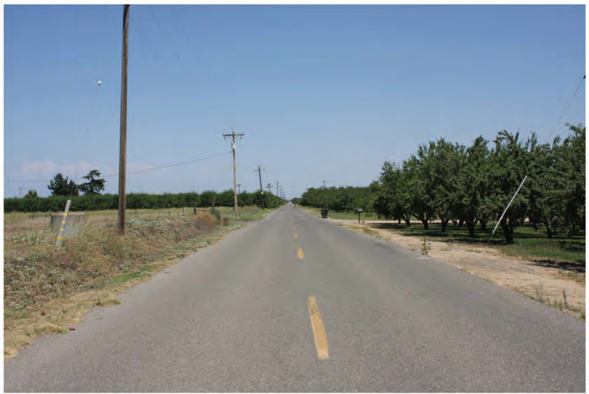
Photograph 6. View from Mercedes Avenue near Arena Way looking east.