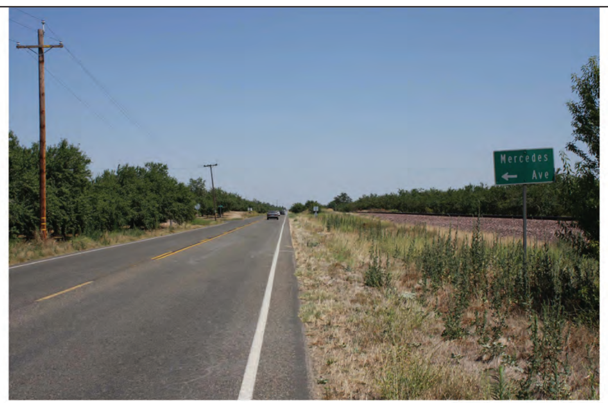
Photograph 5. View from Santa Fe Drive near Mercedes Avenue looking southeast.