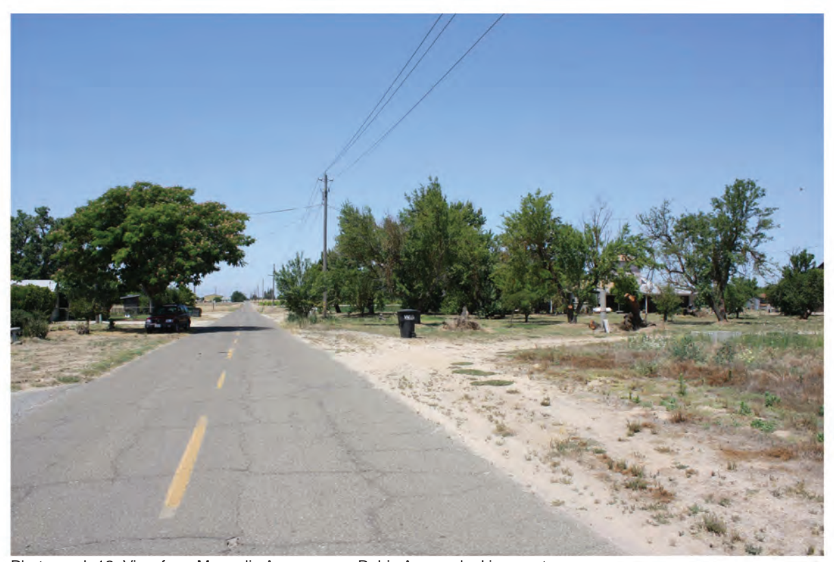
Photograph 12. View from Magnolia Avenue near Robin Avenue looking west.