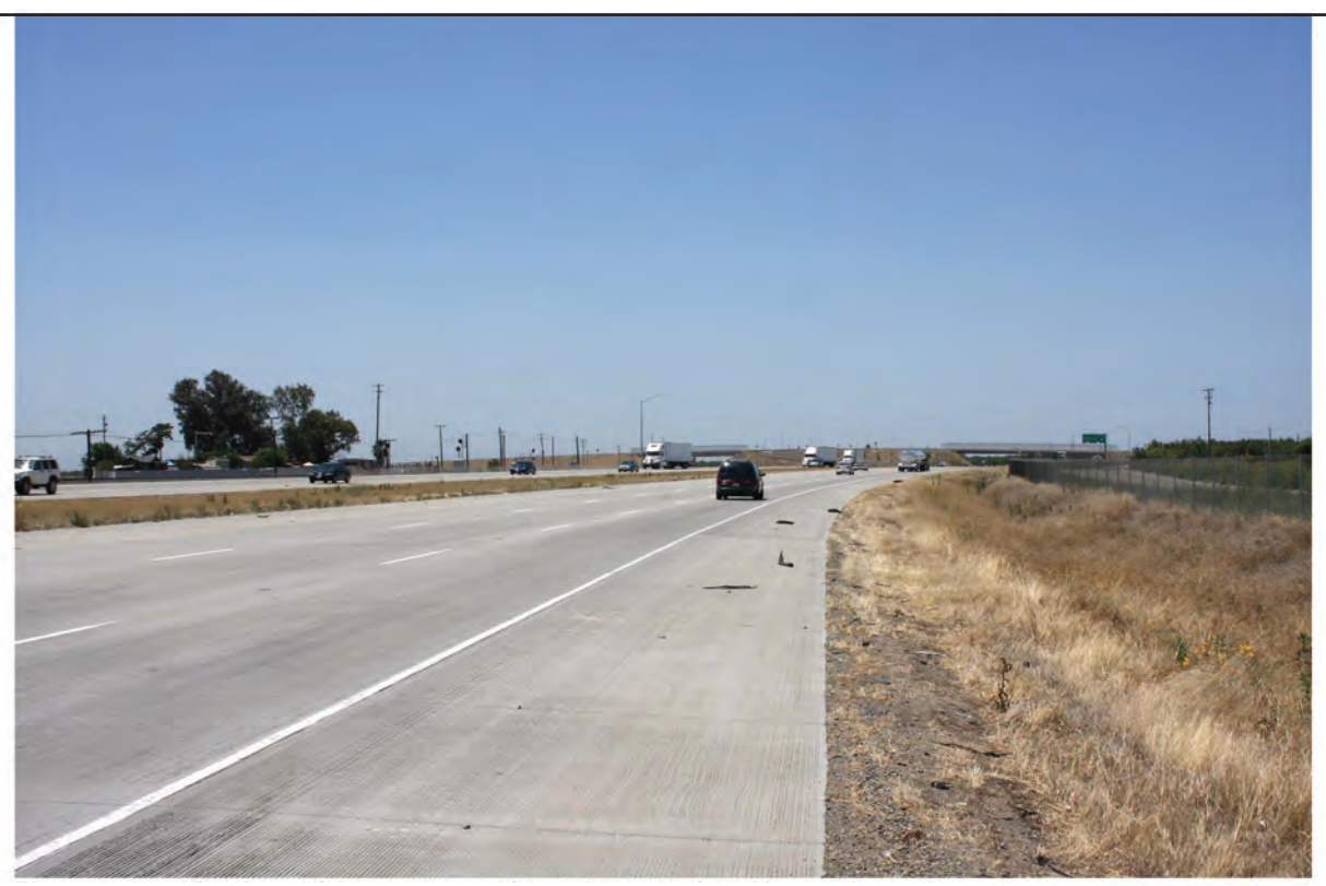
Photograph 9. View from Highway 99 near Liberty Avenue exit looking northwest.