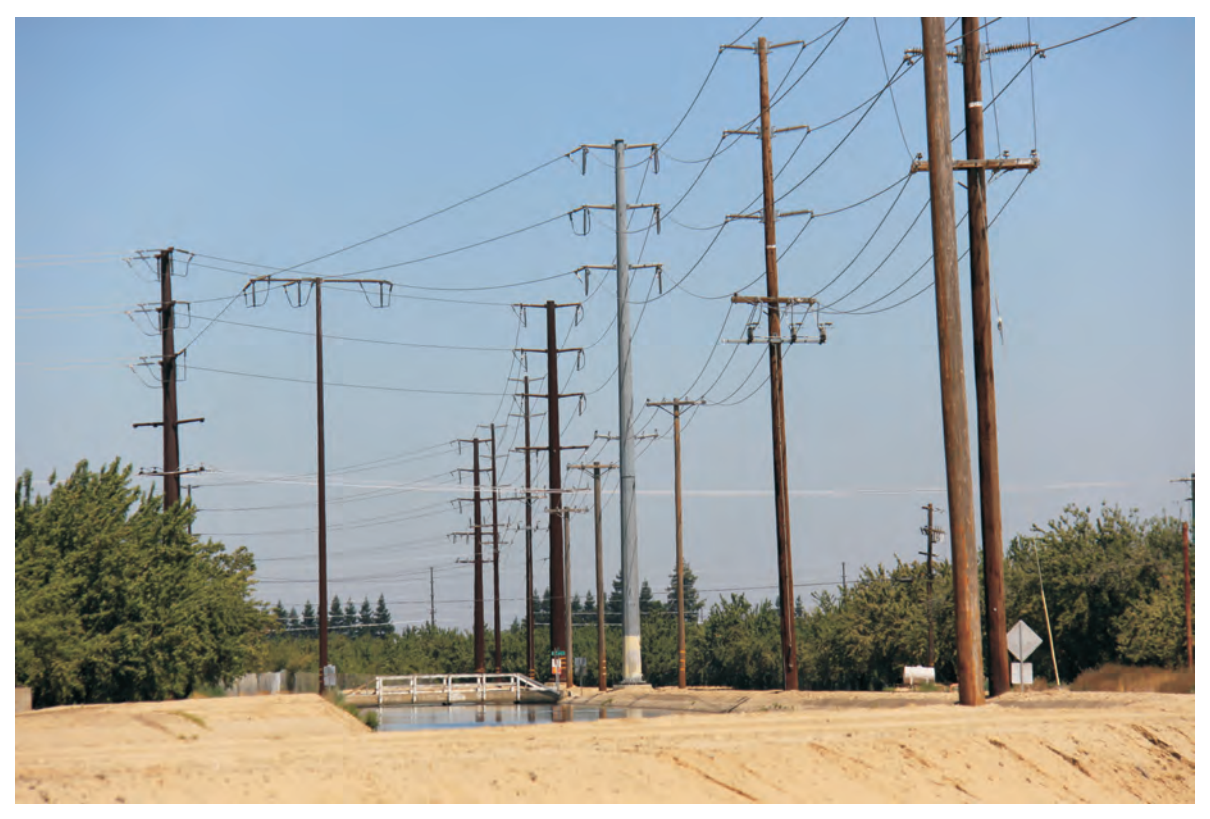
Photograph 16. Group of TSPs, LDS poles, and wood poles along Canal Avenue.