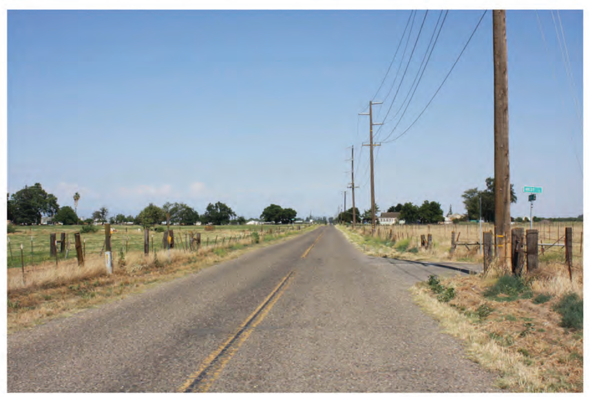
Photograph 4. View from Palm Avenue near West Lane looking east.