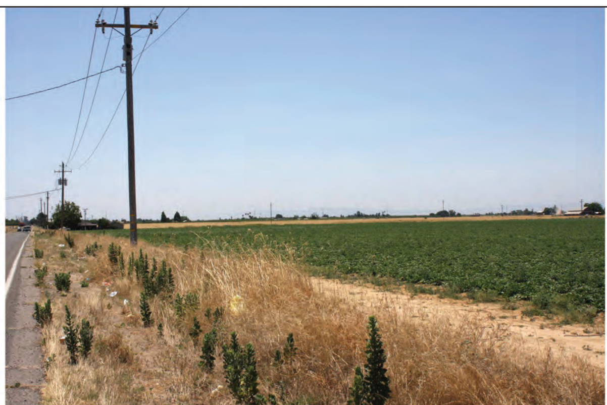
Photograph 11. View from Lincoln Boulevard at Newcastle Drive looking south.