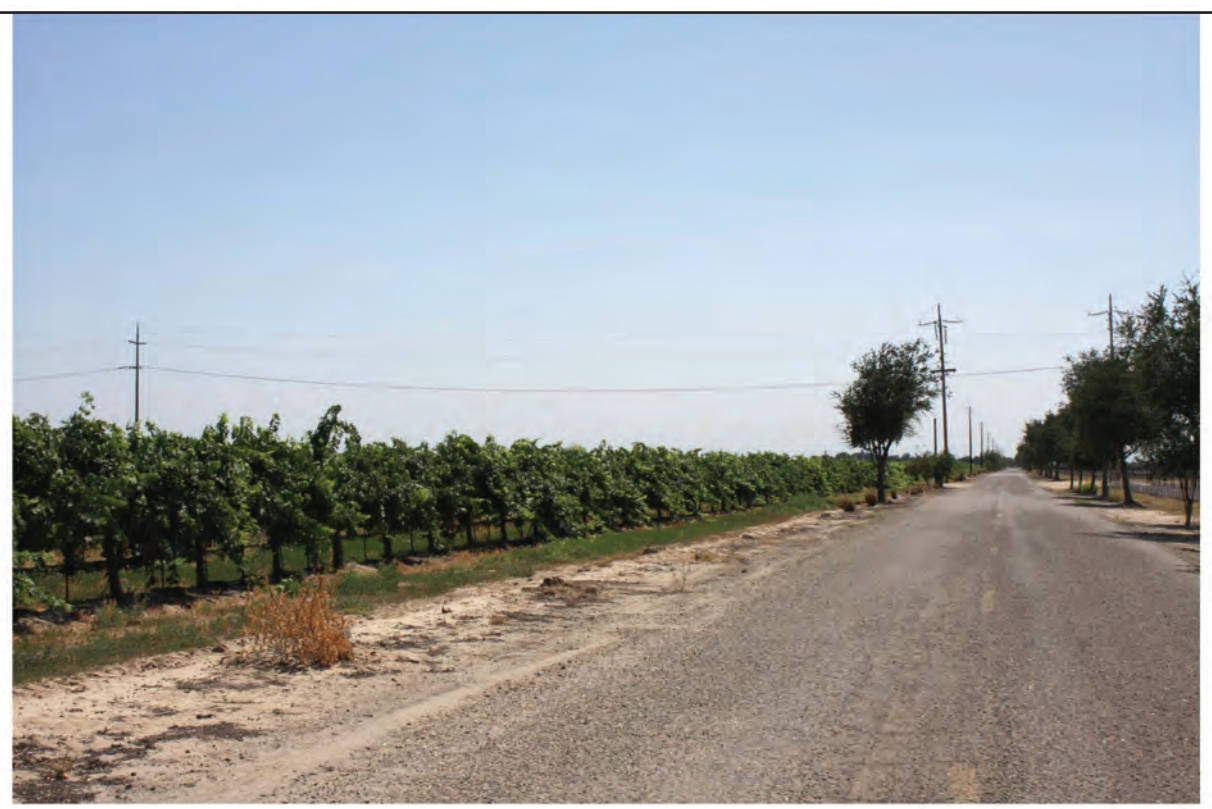
Photograph 13. View from Magnolia Avenue near Griffith Avenue looking east.