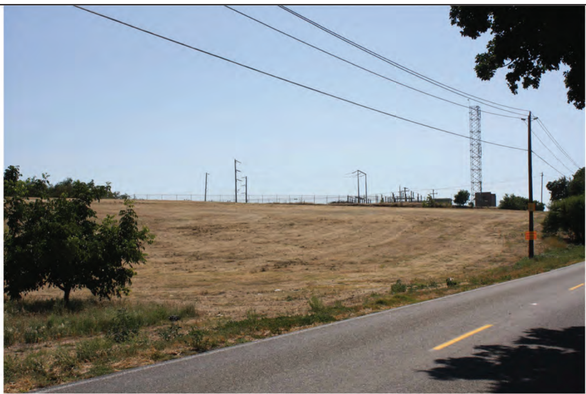
Photograph 1. View from Meadow Drive near West Lane looking southwest.