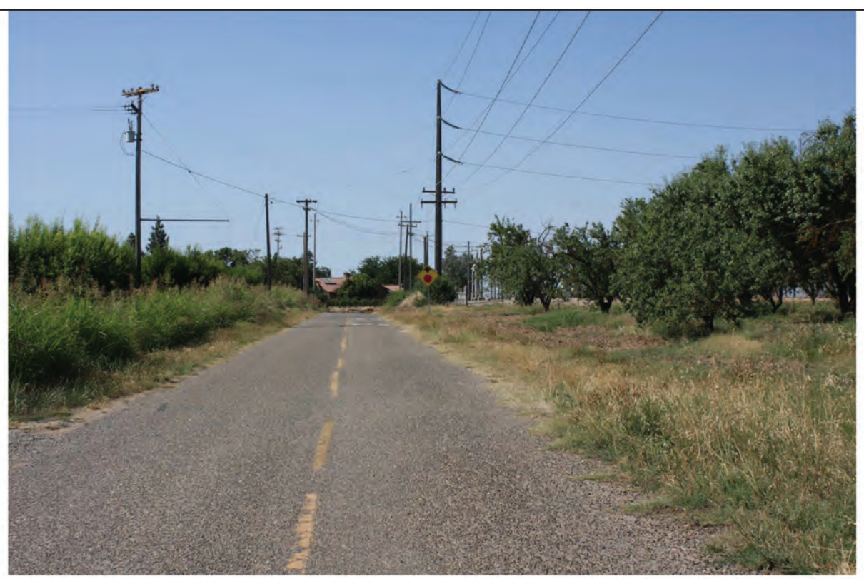
Photograph 3. View from West Lane looking north toward Cressey Substation.