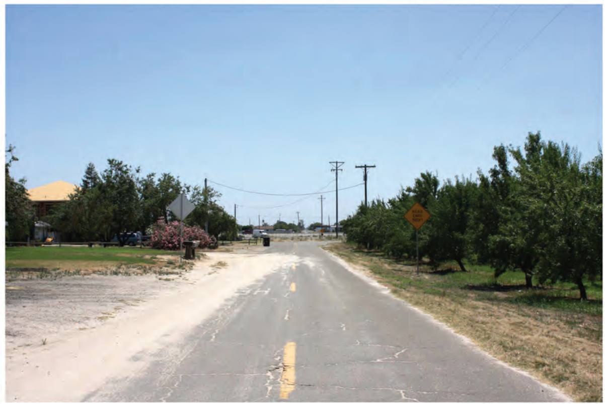
Photograph 8. View from Arena Way near Liberty Avenue looking south.