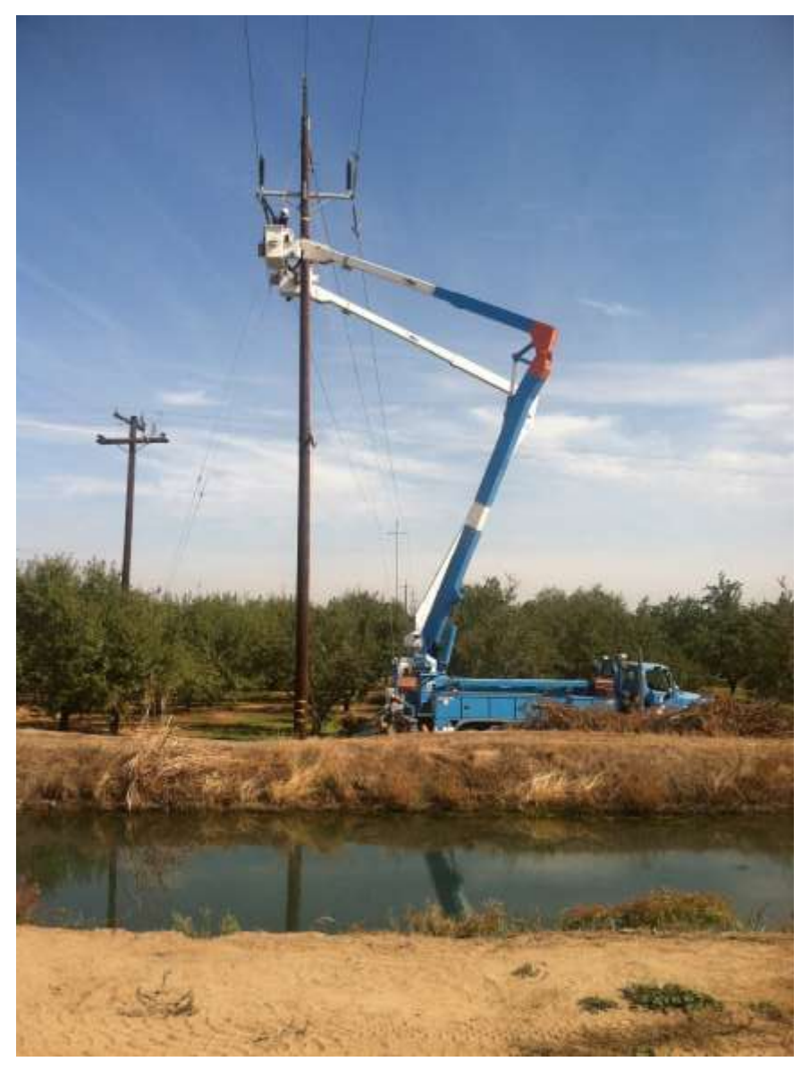
Figure 1 – Crews strung wire along Mercedes Avenue during the subject period. View west 10/8/15.