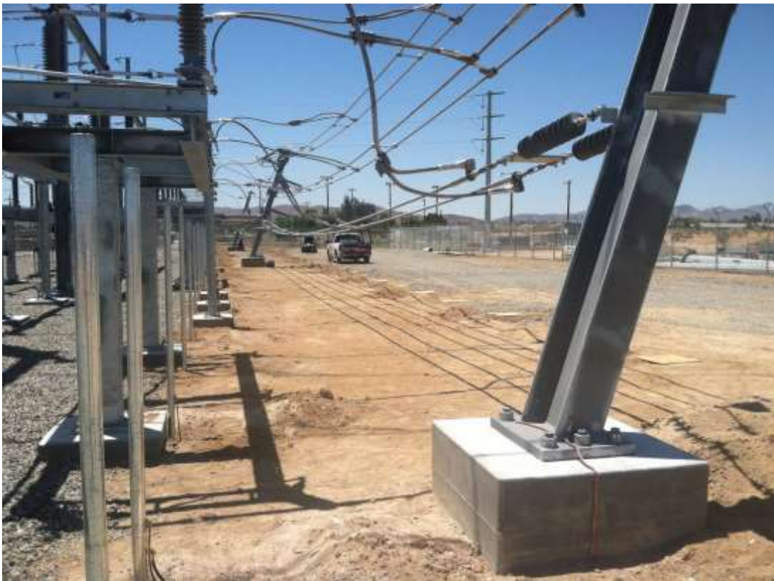
Figure 3 – Installation of interior fencing occurred during the subject period. View south, 6/2/15.