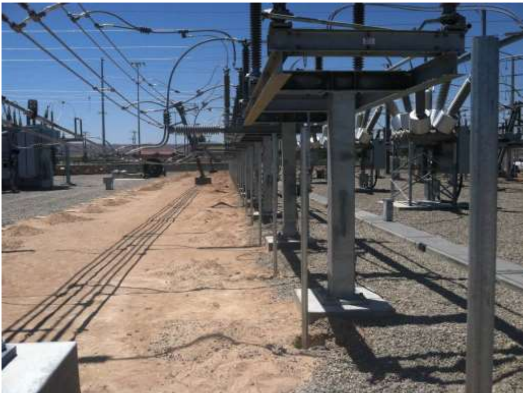
Figure 2 – Installation of interior fencing occurred during the subject period. View south, 6/2/15.