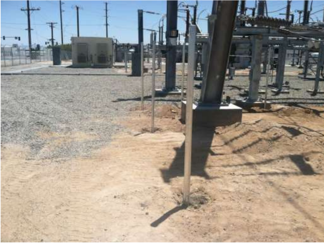
Figure 1 – Installation of interior fencing occurred during the subject period. View east, 6/2/15.