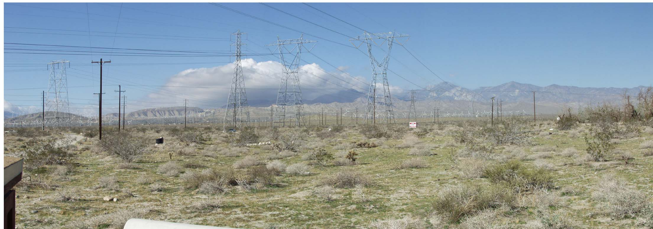
Simulation - Transmission line corridor with proposed Devers-Palo Verde No. 2 500kV lattice steel structure transmission line.

This image is most accurately viewed at a distance of approximately 11 inches from the page to match the actual field of view.