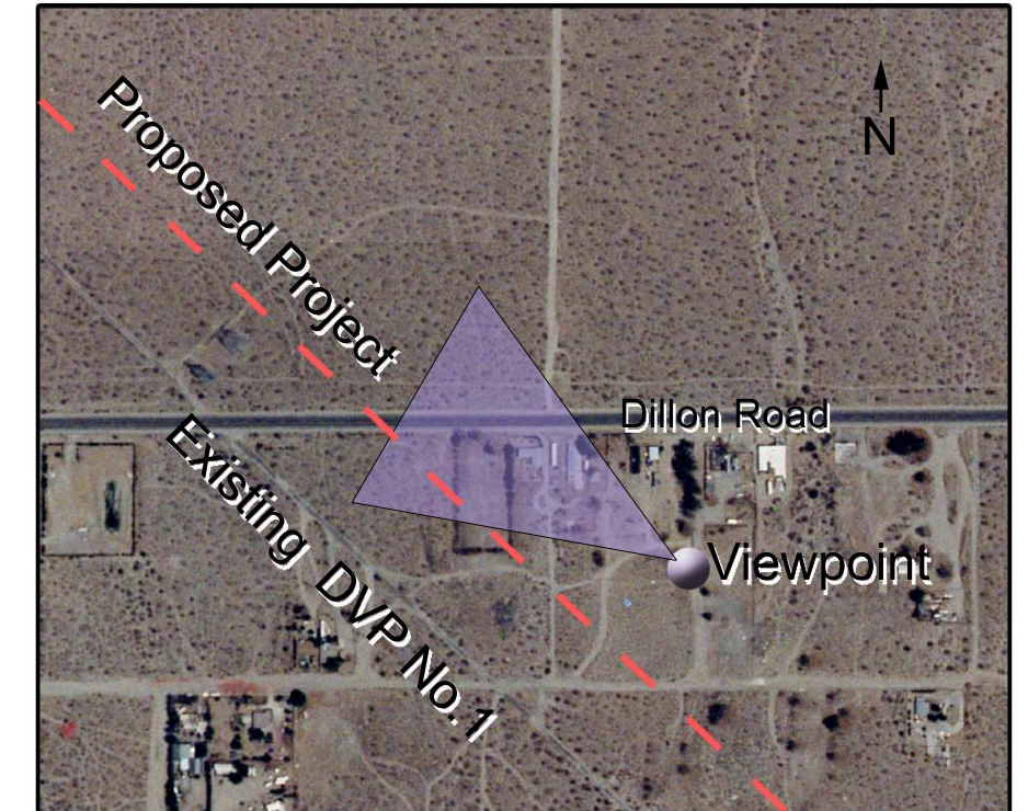
Viewpoint located north of Palm Springs at residence south of Dillon Road looking west-northwest towards proposed project, approximately 1/4 mile from the tower in the center of view.

Photograph taken 12/11/03 at 11:10 a.m. using a 50mm focal length.