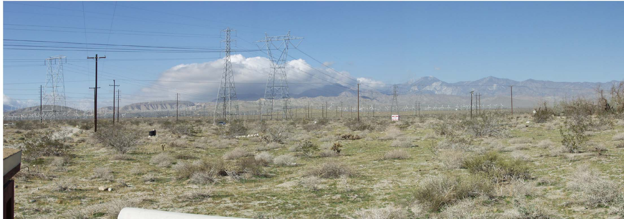
Existing Condition - Transmission line corridor in the foreground and San Bernardino Mountains and wind farm in the background.

Photograph taken 12/11/03 at 11:10 a.m. using a 50mm focal length.