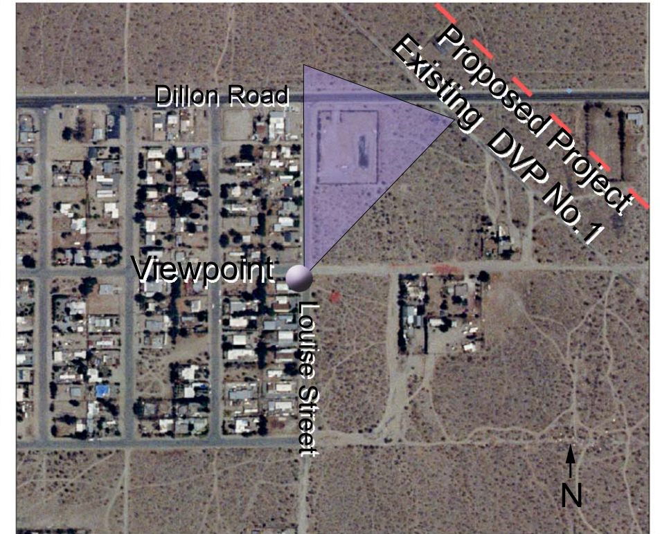
Viewpoint located north of Palm Springs at residence south of Dillon Road looking north-northeast towards proposed project, approximately 1/4 mile from the tower in center of view.