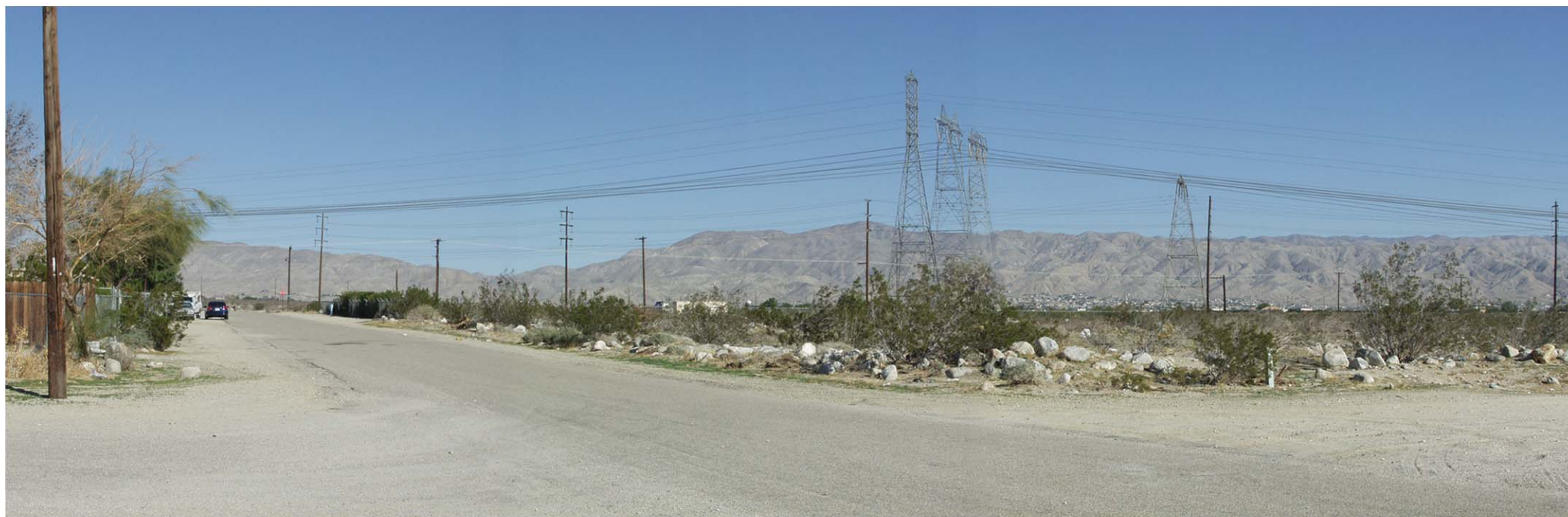
Simulation - Transmission line corridor with proposed Devers-Palo Verde No. 2 500kV lattice steel structure transmission line. This image is most accurately viewed at a distance of approximately 11 inches from the page to match the actual field of view.