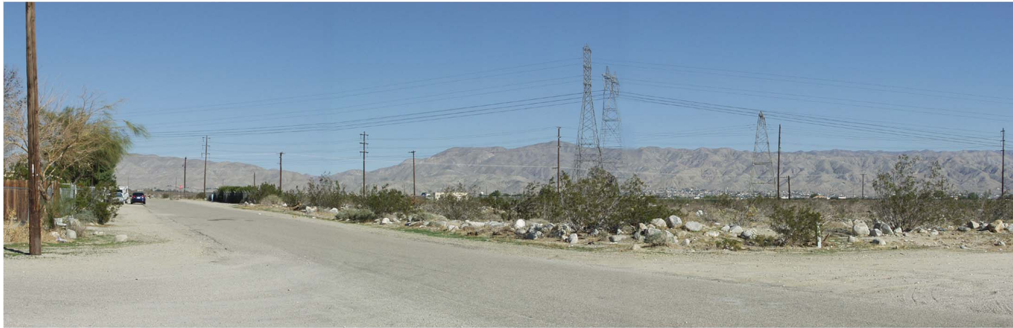
Existing Condition - Transmission line corridor in the foreground and Little San Bernardino Mountains and Desert Hot Springs in the background. Photograph taken 12/11/03 at 11:27 a.m. using a 50mm focal length.