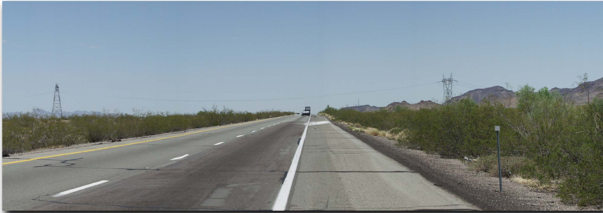
Existing Conditions - Transmission line corridor crossing Interstate 10 west of Tonopah, Arizona. Photograph taken 7/26/04 at 12:26 p.m. using a 50mm focal length.