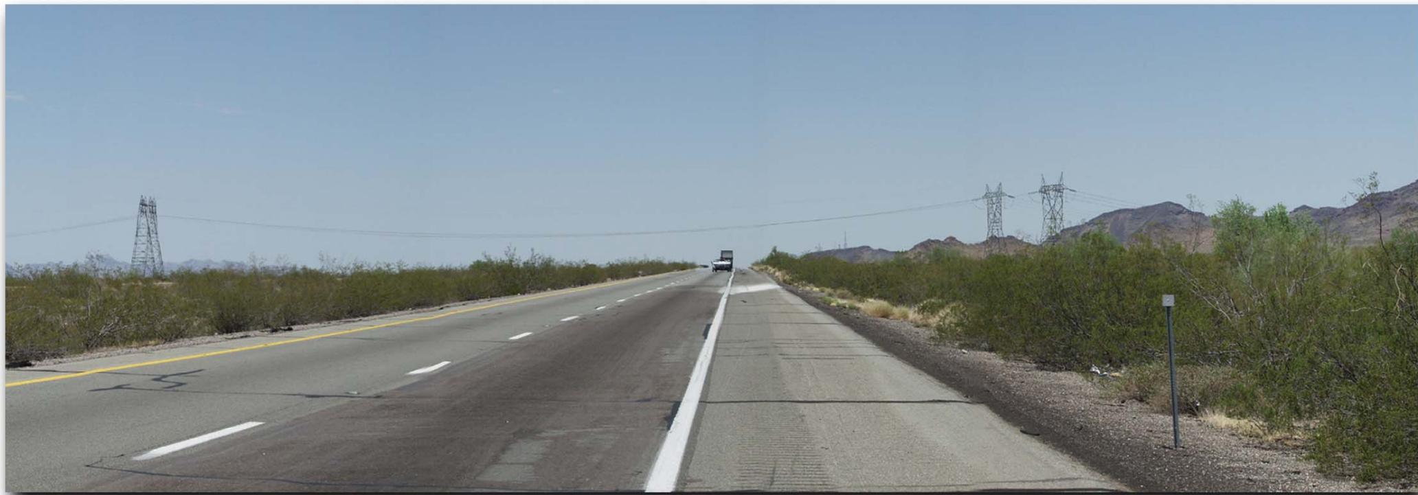
Simulation - Transmission line corridor crossing Interstate 10 west of Tonopah, Arizona with proposed Devers-Palo Verde No. 2 500kV lattice steel structure transmission line.

This image is most accurately viewed at a distance of approximately 11 inches from the page to match the actual field of view.