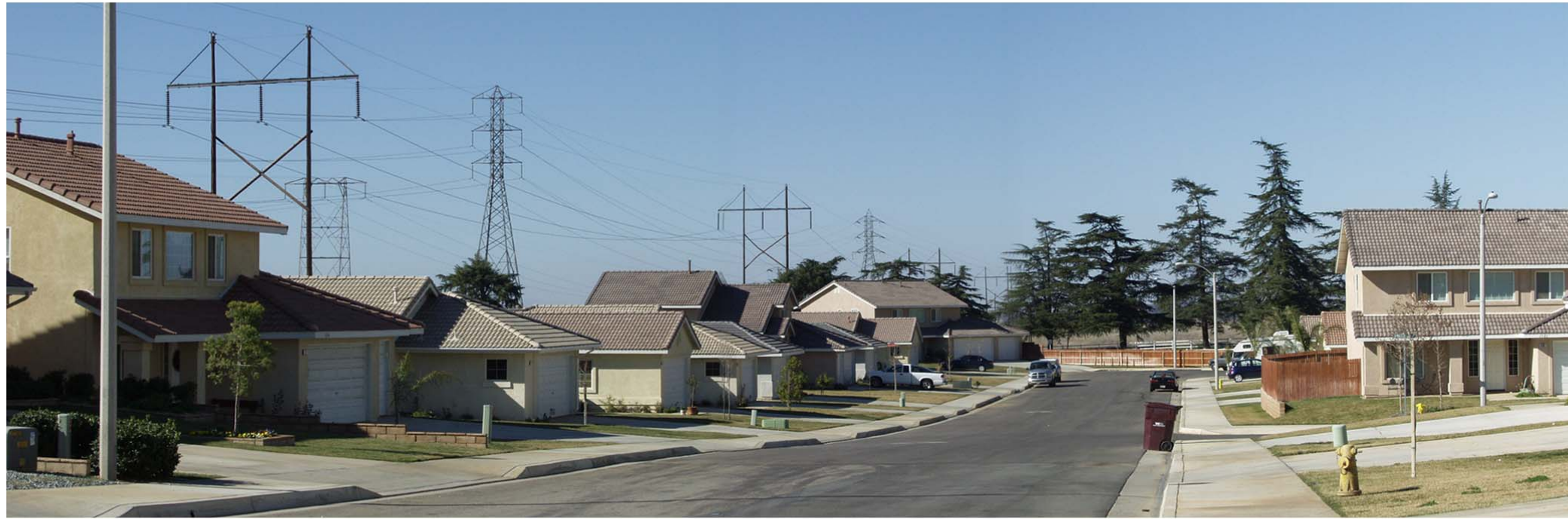
Existing Condition - Transmission line corridor adjacent to residential image type. Photograph taken 1/22/04 at 11:37am using a 50mm focal length.