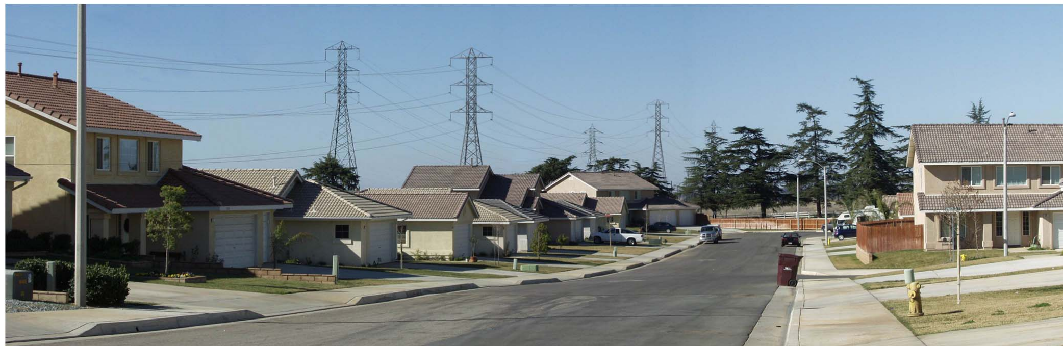
Simulation - Transmission line corridor with two 230kV single-circuit lattice towers removed and proposed 230kV double-circuit lattice steel structure transmission line.

This image is most accurately viewed at a distance of approximately 11 inches from the page to match the actual field of view.