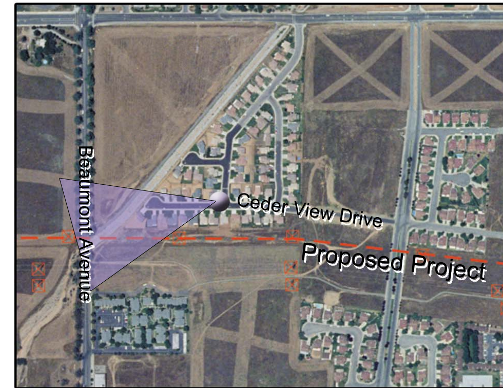
Viewpoint located in the city of Beaumont east of Beaumont Avenue and north of transmission line, looking west-southwest towards proposed project. Viewpoint approximately 1/8 mile from the tower in the center of view.