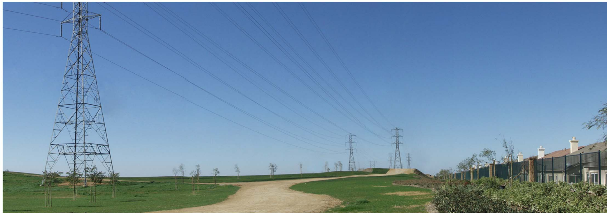
Simulation - Transmission line corridor with two 230kV single-circuit towers (lattice and H-frame) removed and proposed 230kV double-circuit lattice steel structure transmission line.

This image is most accurately viewed at a distance of approximately 11 inches from the page to match the actual field of view.