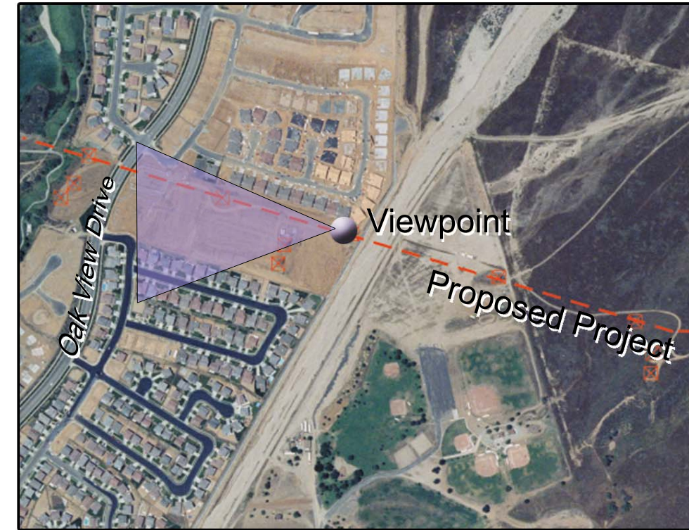
Viewpoint located in the city of Beaumont east of Oak View Drive, looking west-southwest towards proposed project. Viewpoint approximately 1/16 mile from the tower in the center of view.