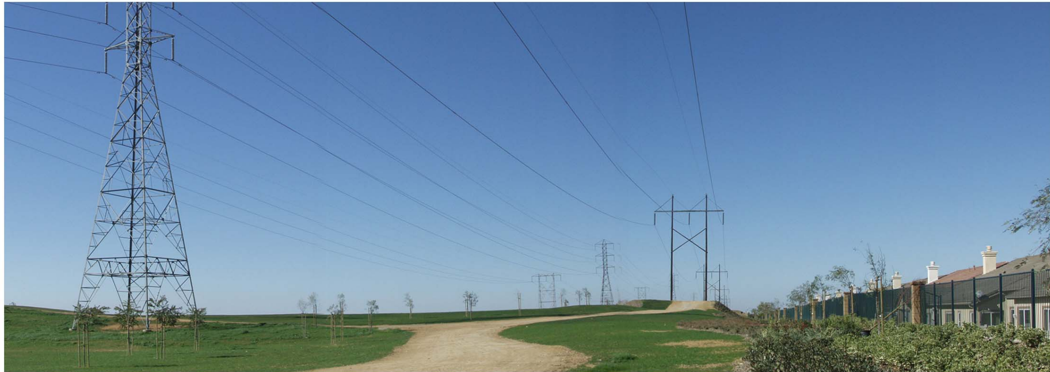
Existing Condition - Transmission line corridor within open space/park image type adjacent to residential image type. Photograph taken 1/22/04 at 12:23 pm using a 50mm focal length.