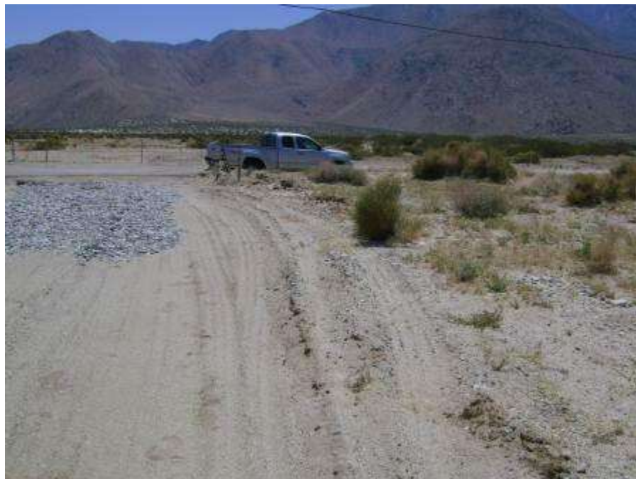
Figure 6. Area of off access road travel at the entrance to Tower 1027.