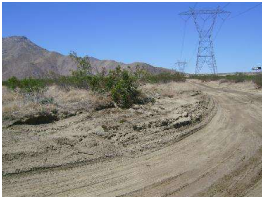
Figure 8. Area where equipment went off of the access road and impacted the road berm and native vegetation at the access road entrance to Tower 1025.