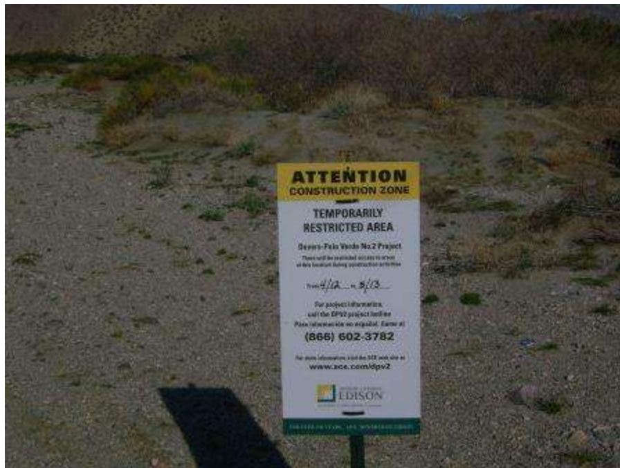
Figure 5. “Restricted Area” signs placed at right-of-way entrances that led to helicopter landing zone H1X-DV.