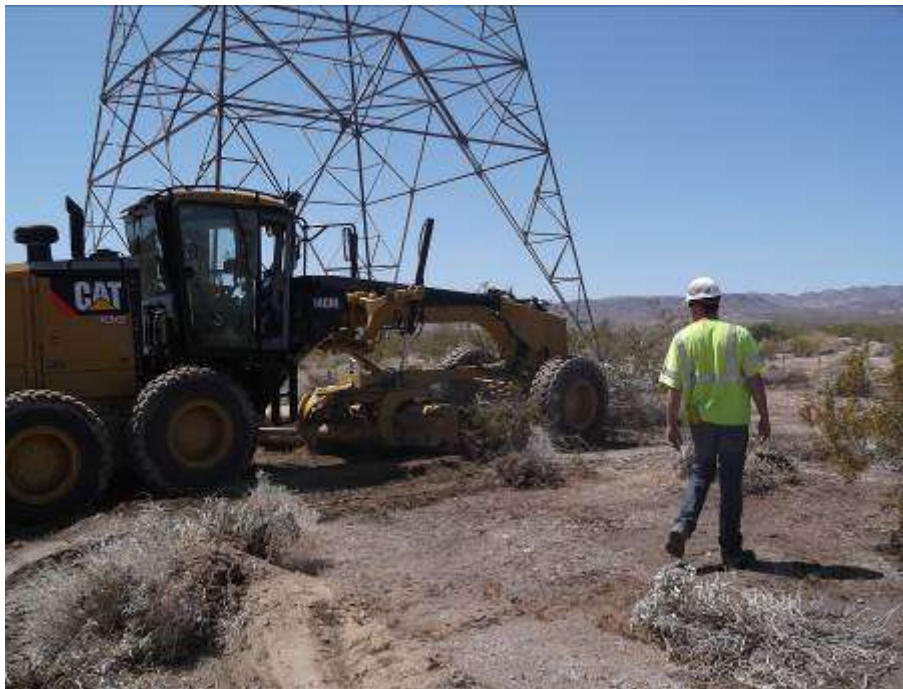
Figure 2. Vegetation clearing activities at Tower 2409.