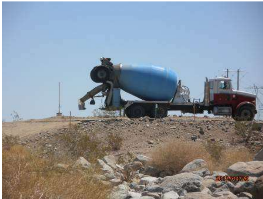
Figure 7. Concrete truck trough was cleaned outside of approved work limits near Tower 2530.