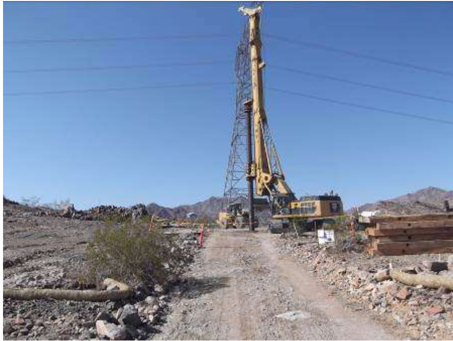
Figure 1. Foundation drilling at Tower 2531.