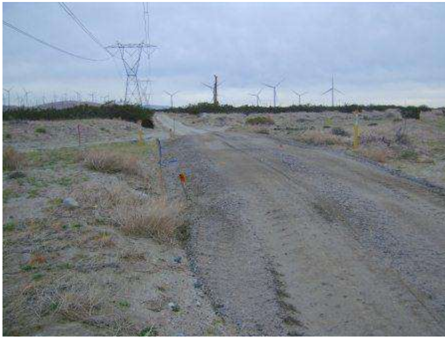
Figure 3. Base material within the limits of the access road used to properly cover a pipeline crossing between Towers 1023 and 1022.