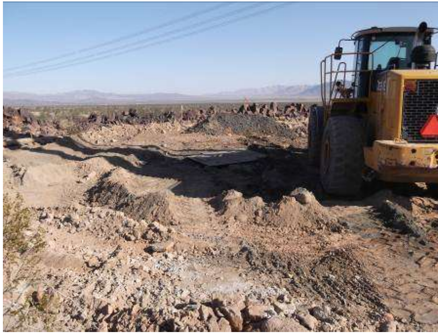
Figure 9. Improperly covered foundation hole at Tower 2531.