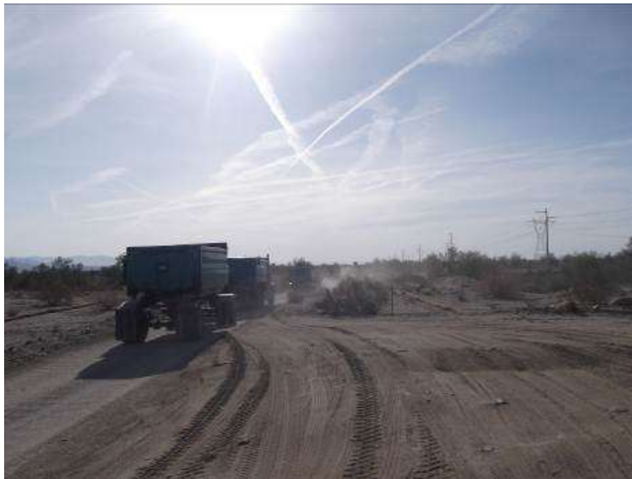
Figure 10. Excessive dust observed on multiple occasions along the access road near Red Bluff Substation. Project Memorandum #5 was issued as a result.