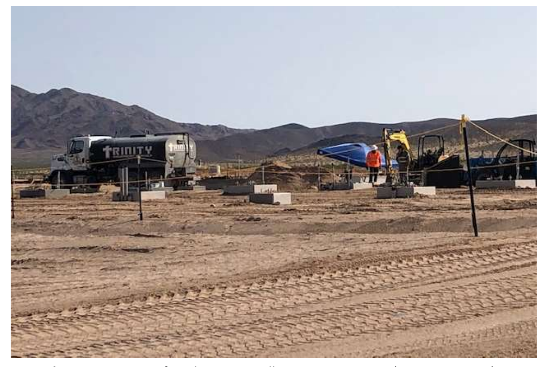
Photo 2: Excavating foundations at Ludlow Series Capacitor (August 12, 2021).