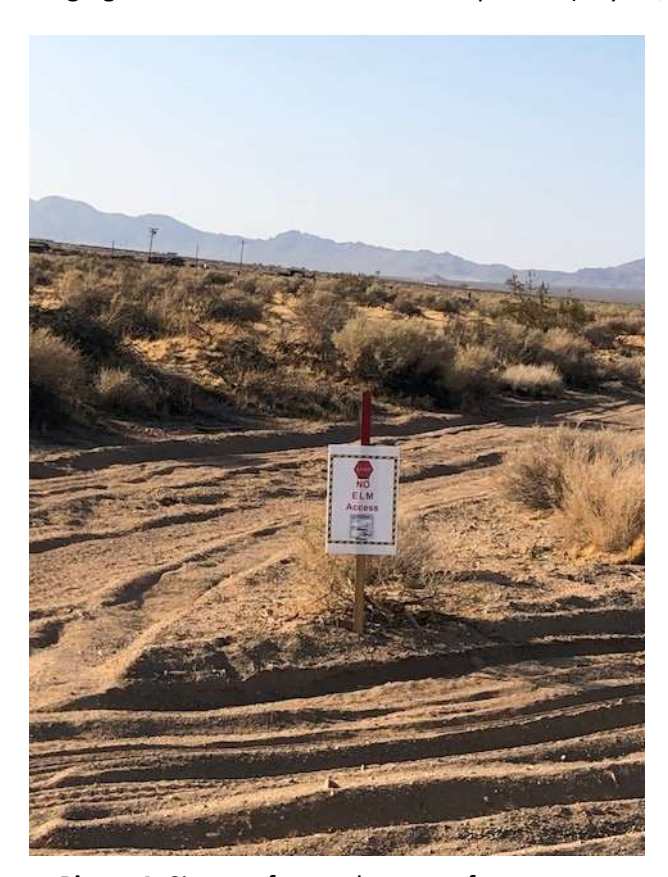
Photo 4: Signage for road access after pre-con survey at Barstow Repeater (August 26, 2021).