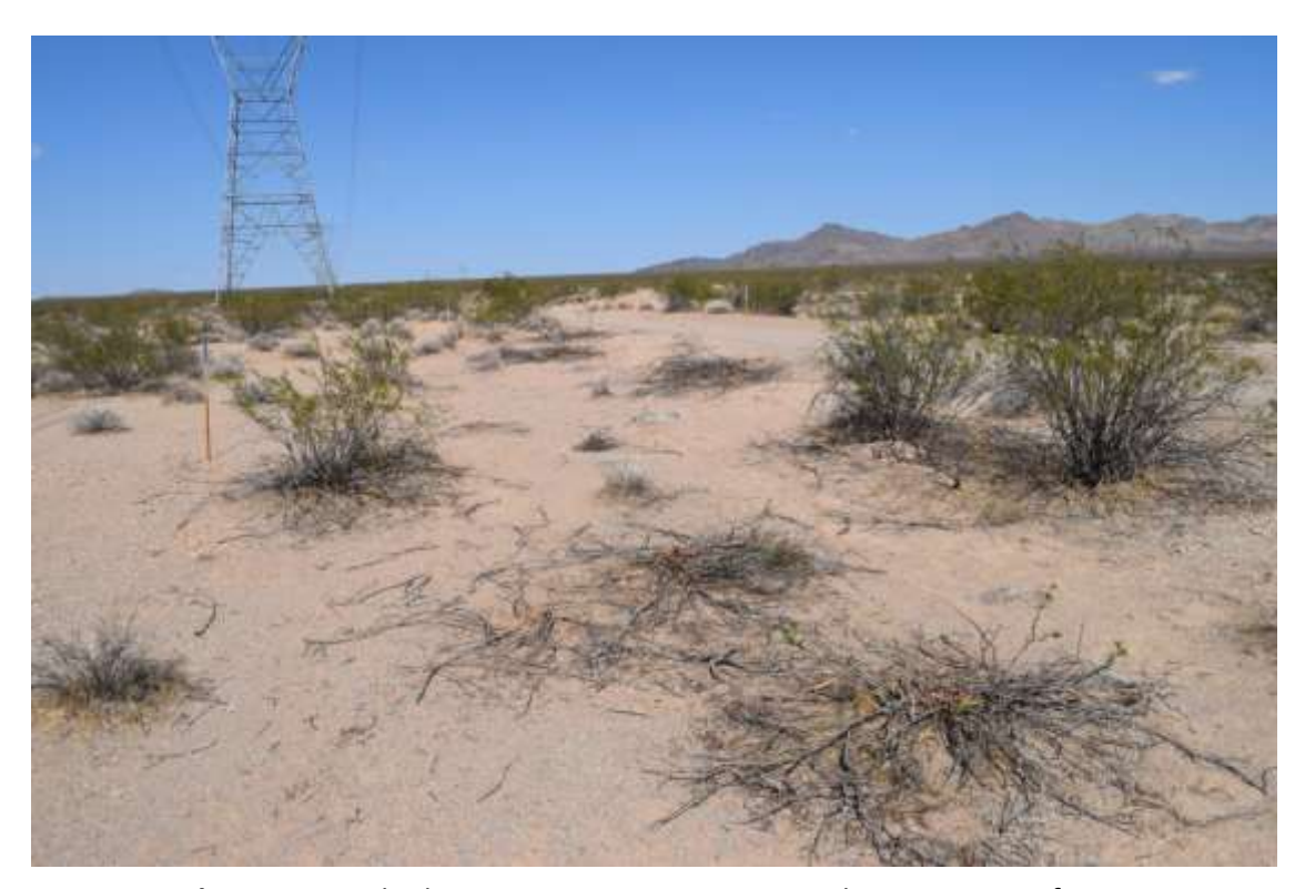
Photo 5: Disturbed vegetation. August 19, 2021.