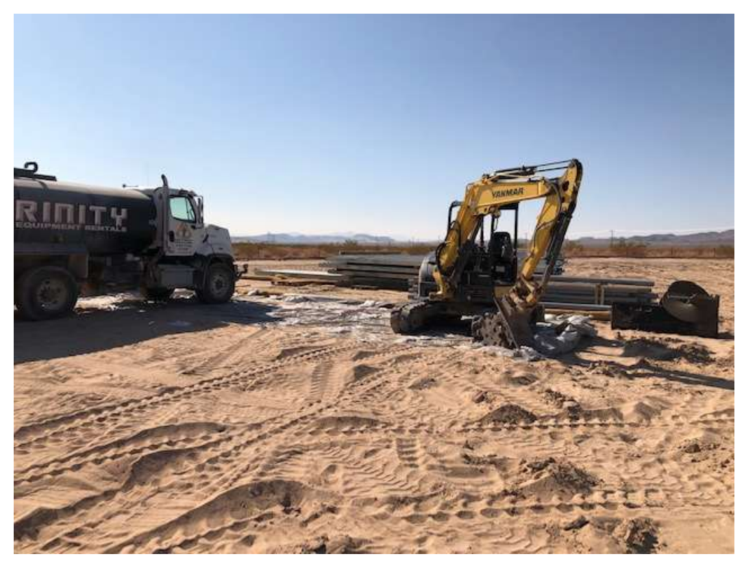
Photo 3: Staging excavator at Ludlow Series Capacitor (July 22, 2021).