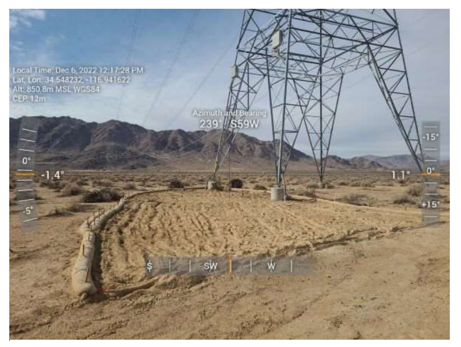
Photo 2 : Hydroseeding at Barstow Repeater (December 6, 2022; photo by Nick Barth, EPC).