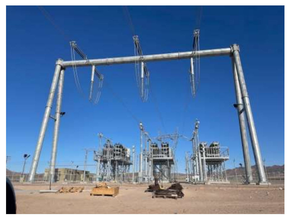
Photo 4: Staged equipment at SC5, Ludlow mid-line (December 14, 2022).