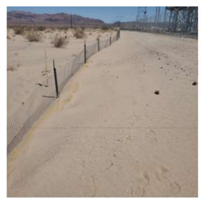
Photo 3 : Buried wattles at SC5 (April 5, 2023).