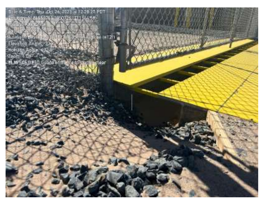
Photo 4 : CPUC EM visually inspecting condition of tortoise guards on site. All tortoise guard entrances were free of debris, observed in good condition, and entrances were not occluded/remain functional.