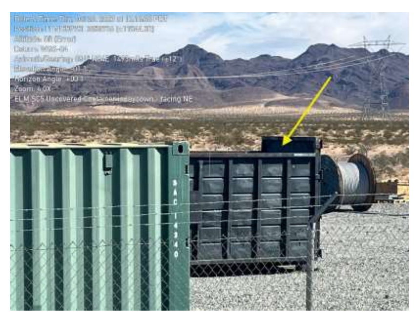
Photo 1: A container observed in SC5's laydown yard with an open-top (not covered) which may pose a waste containment/wildlife attractant concern, depending on the contents. CPUC EM notified SCE monitoring staff.