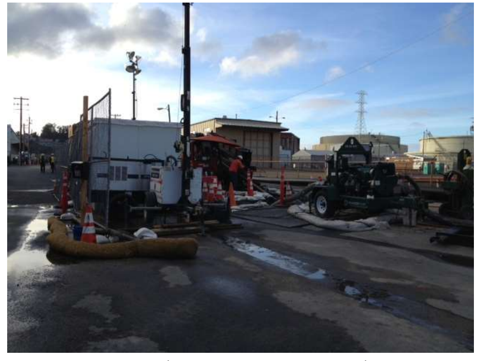
Figure 4 – HDD South operations. View west, December 4, 2014.