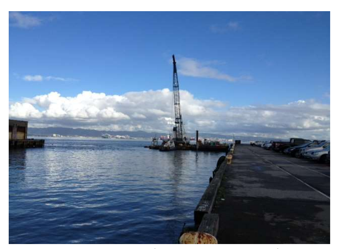
Figure 2 – Vortex set-up at HDD North receiving pit. View east, December 4, 2014.