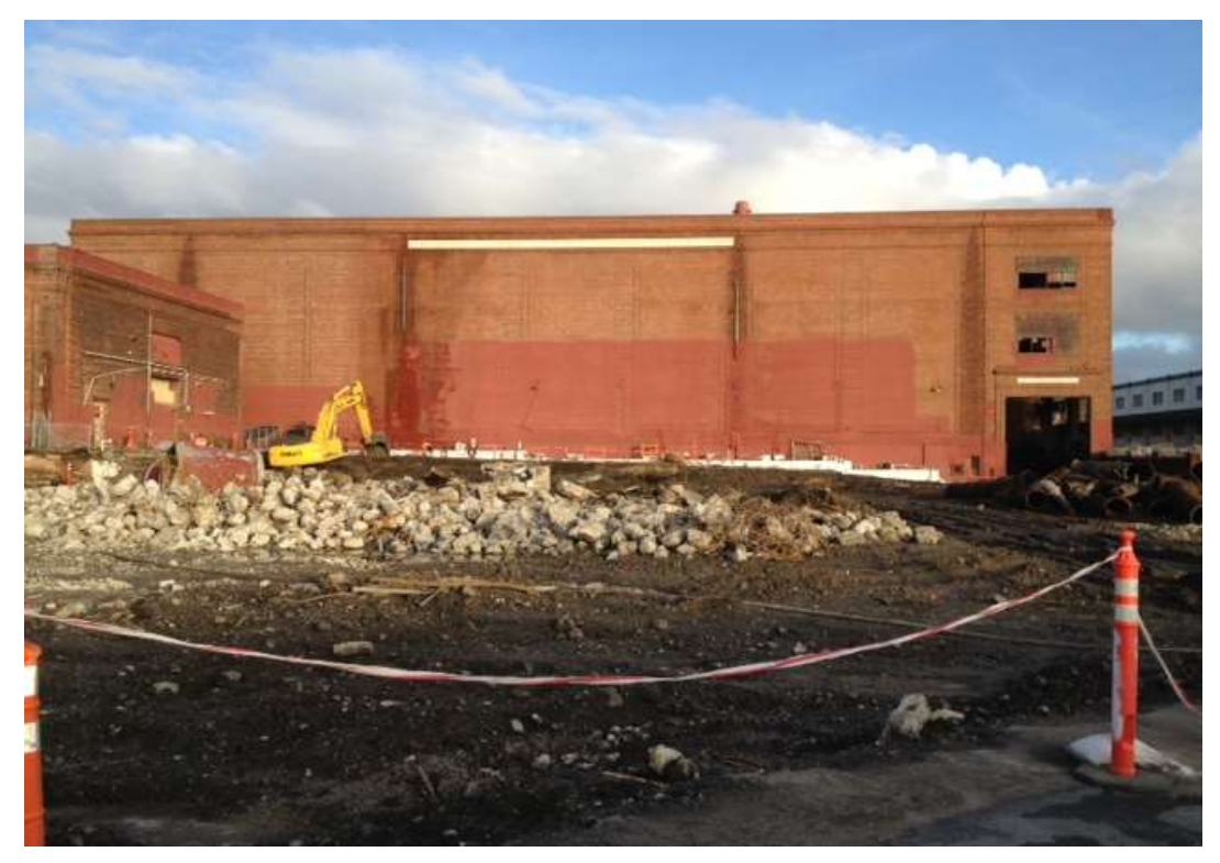
Figure 1 – Demolition and excavation at Potrero Switchyard, View east, December, 4, 2014.