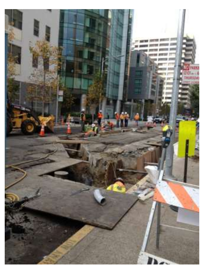
Figure 4 – Utility relocation work on Spear Street. View west-southwest, January 15, 2015.