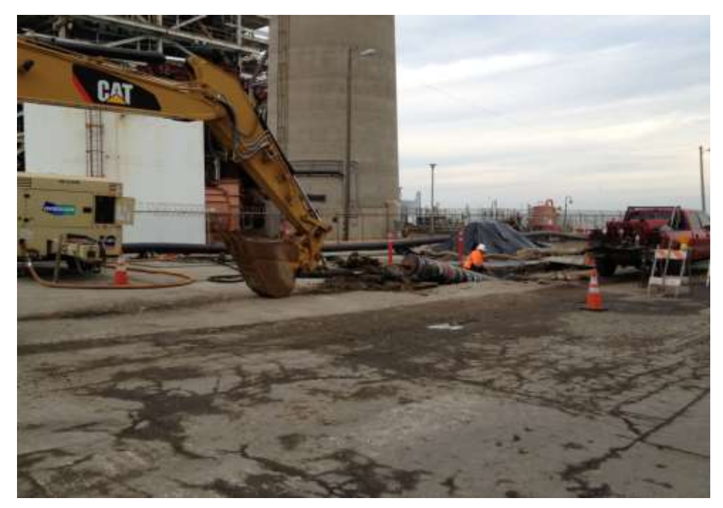
Figure 1 – Crews removing drill casing at HDD South. View east-northeast, January 15, 2015.