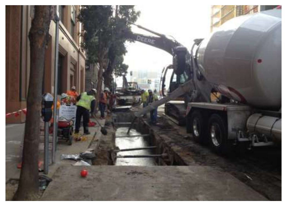
Figure 3 – Pouring cement slurry in duct bank trench on Folsom Street. View south-southwest, January 15, 2015.