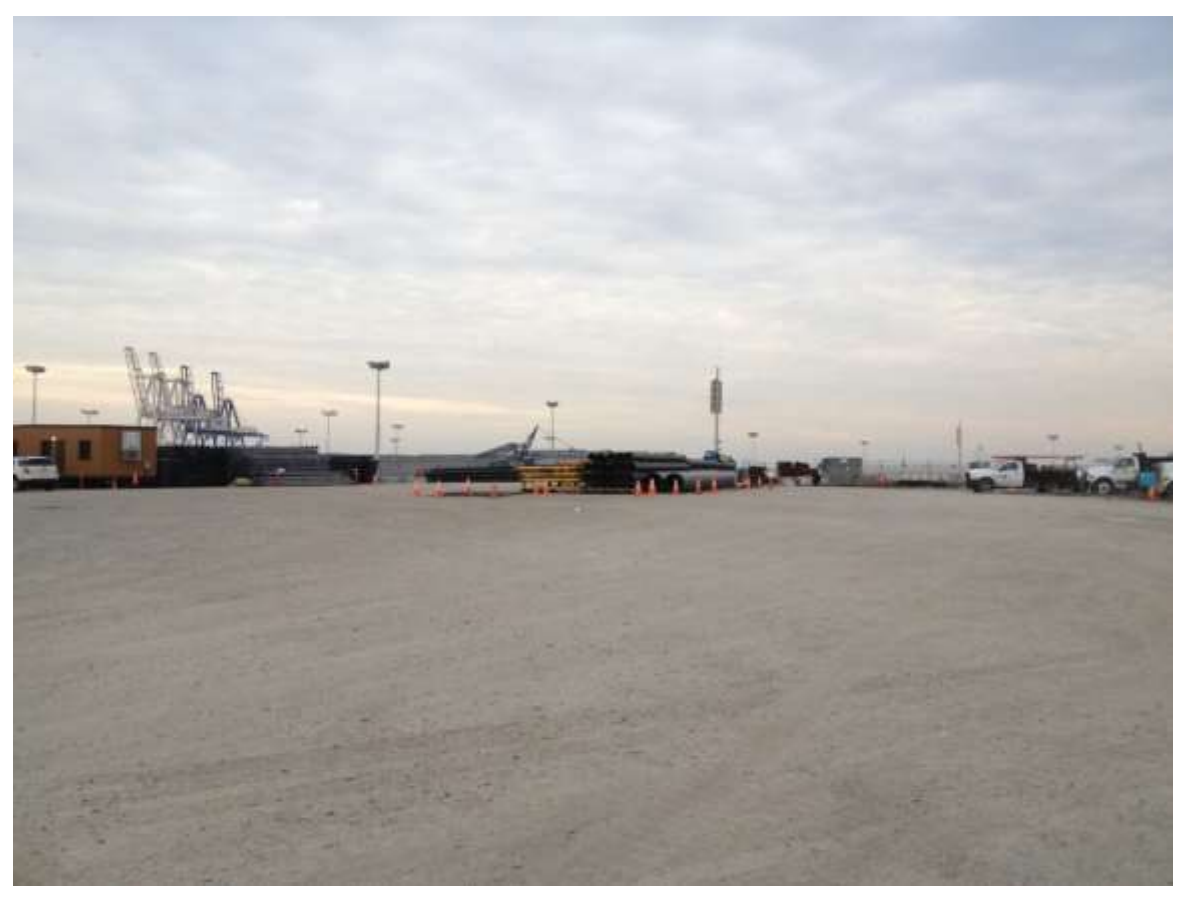
Figure 5 – Staging equipment and materials at Amador Yard. View south, January 15, 2015.