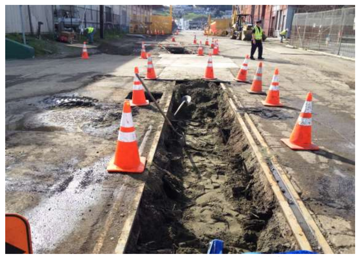
Figure 4 – Underground duct bank and water line relocation work on 23<sup>rd</sup> Street. View west, March 12, 2015.