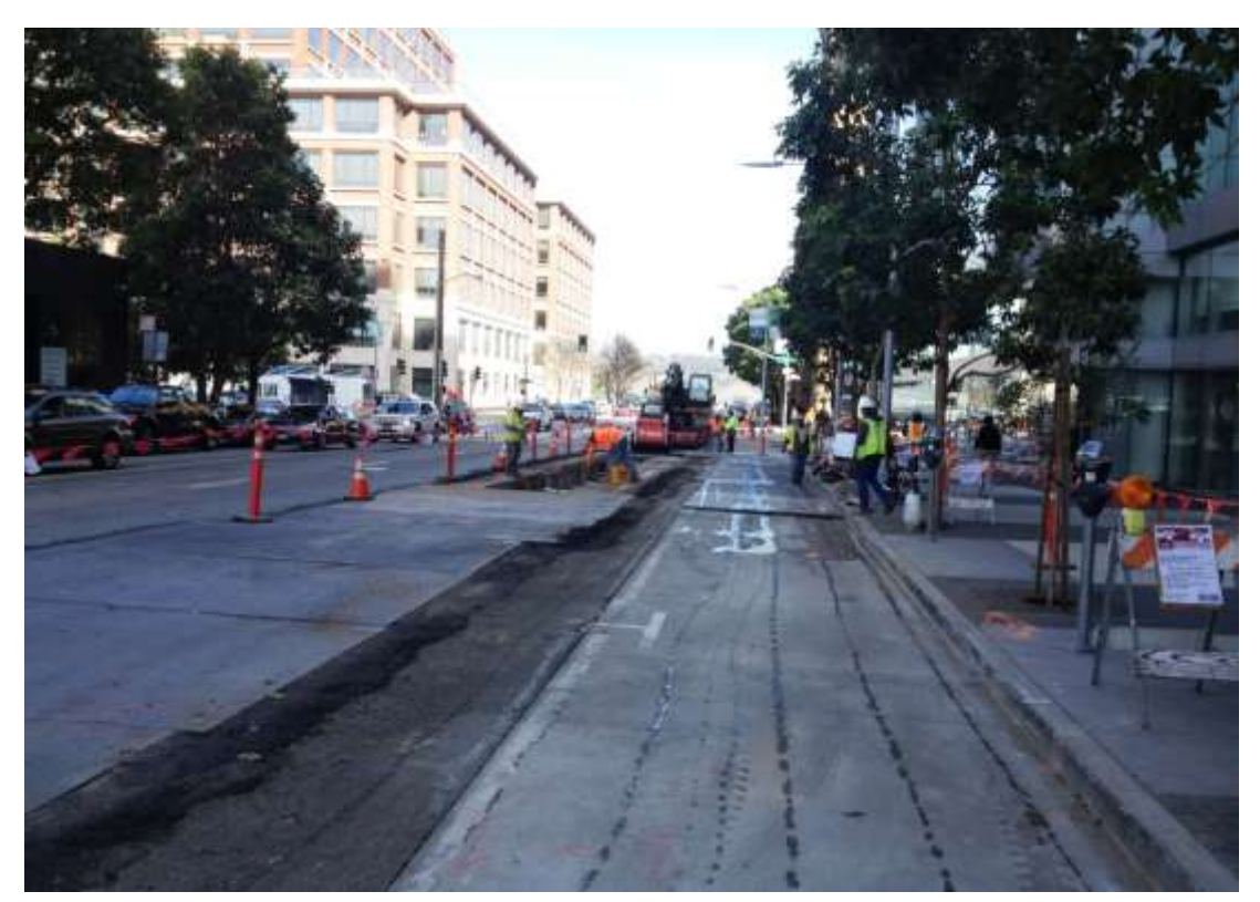
Figure 2 – Excavating duct bank on Folsom Street. View north, March 12, 2015.