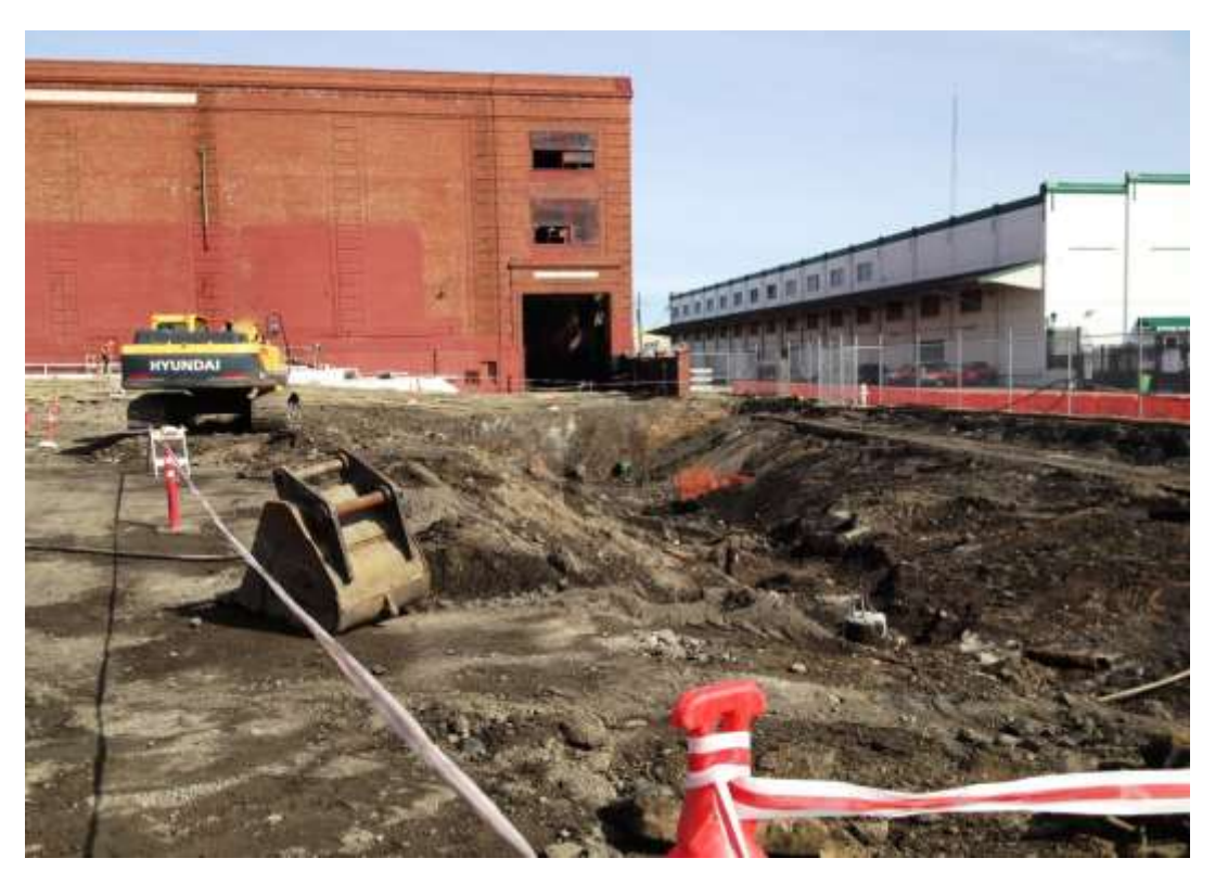
Figure 1 – Excavation at Potrero Switchyard, view east, March 12, 2015.