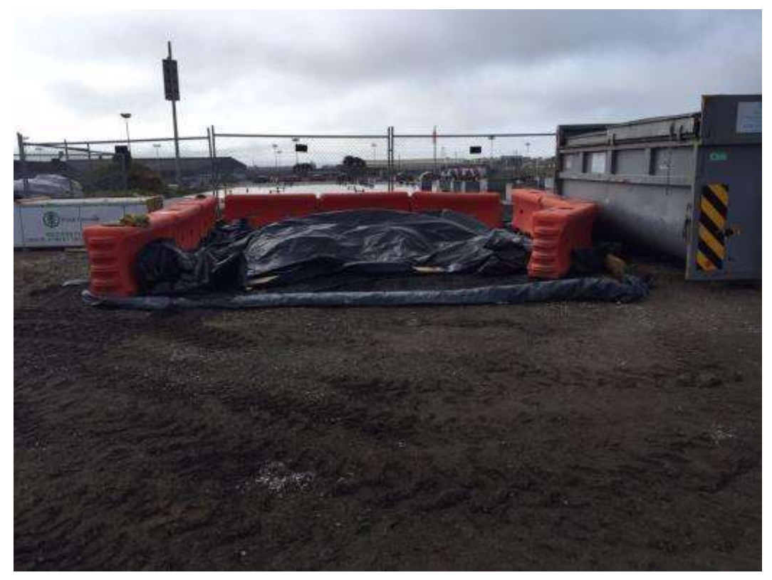
Figure 4 – Cutback stockpile properly covered and contained at Amador Yard. View south, April 25, 2015.