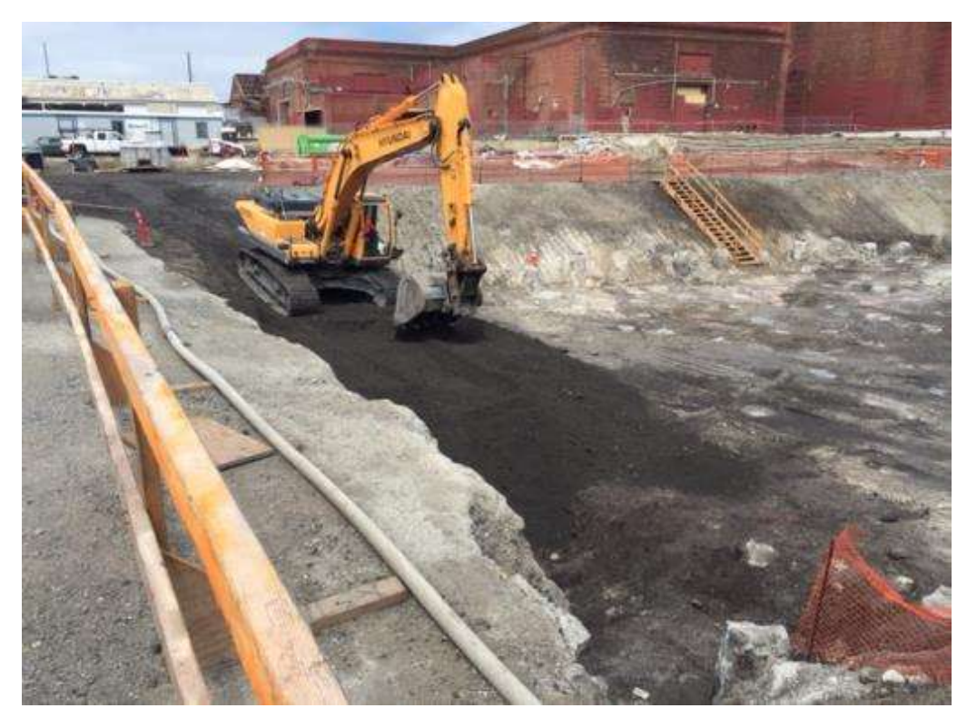
Figure 1 – Proven backfilling excavation at Potrero Switchyard. View northeast, April 20, 2015.