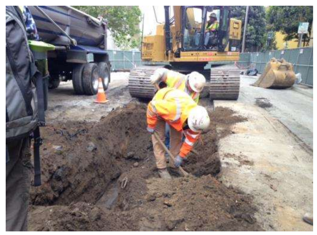
Figure 2 – Hand excavating at N1 for HDPE transition on Spear Street where possible pier structure has been encountered. View east, April 21, 2015.