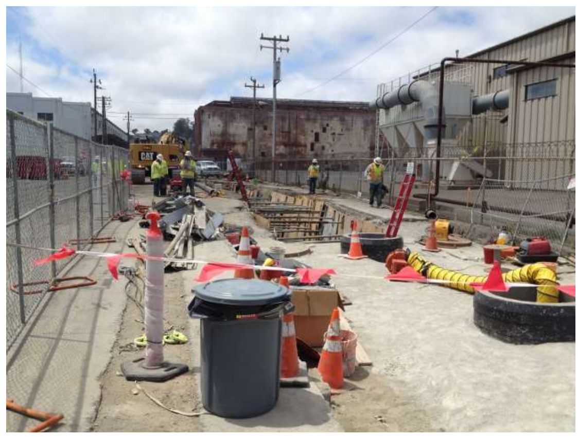
Figure 3 – Installed HDPE conduit on west side of vault on 23<sup>rd</sup> Street. View west, May 15, 2015.