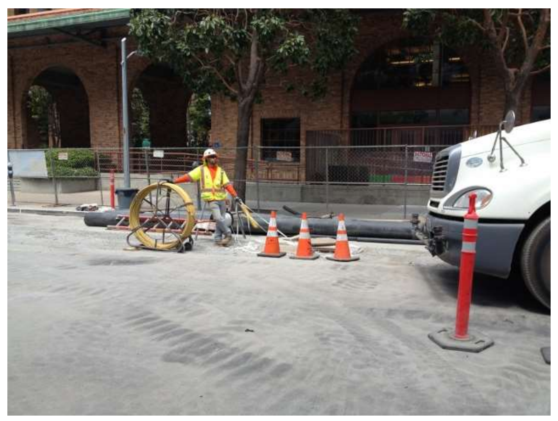
Figure 2 – Installing mule tape in fiber optic conduit on Spear Street. View north, May 15, 2015.