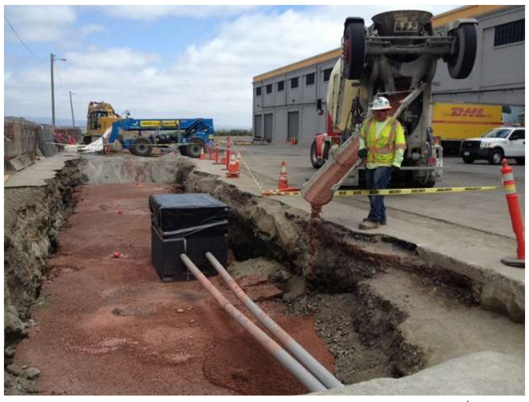
Figure 4 – Backfilling with FTB in duct bank trench on east side of vault on 23<sup>rd</sup> St. View east, May 15, 2015.