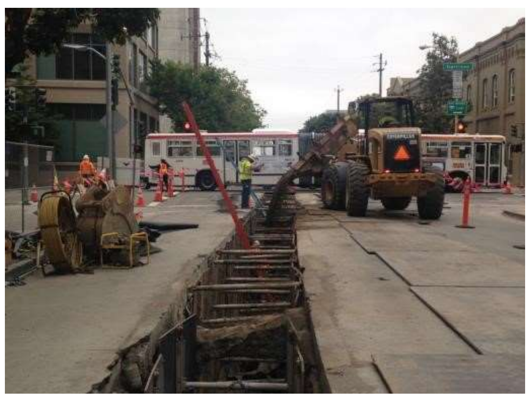
Figure 1 – Backfilling of duct bank on Spear Street on west side of Harrison Street. View east, May 18, 2015.