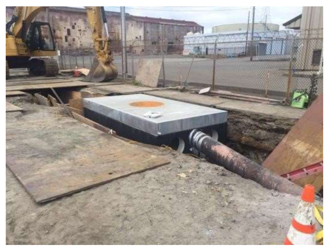
Figure 4 – Installed pull box cover at duct bank south on 23<sup>rd</sup> St. View northwest, May 21, 2015.