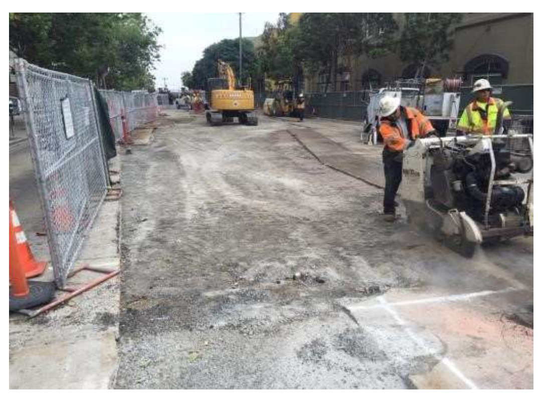
Figure 2 – Saw cutting pavement on Spear Street in cul-de-sac. View east, May 19, 2015.