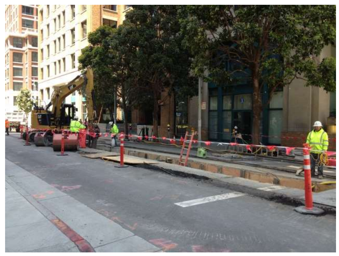
Figure 3 – Excavating duct bank trench on Spear Street. View northwest, May 28, 2015.