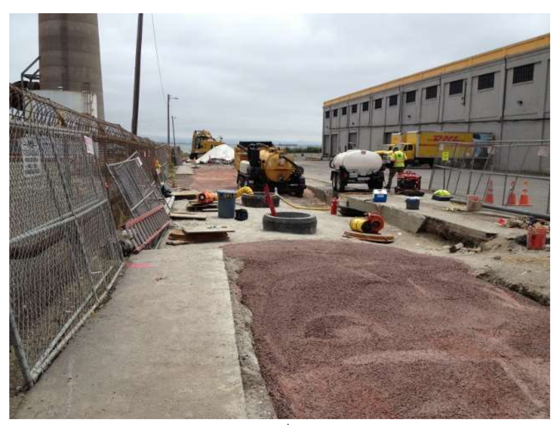
Figure 4 – Cleaning vault on 23<sup>rd</sup> St. View east, May 28, 2015.