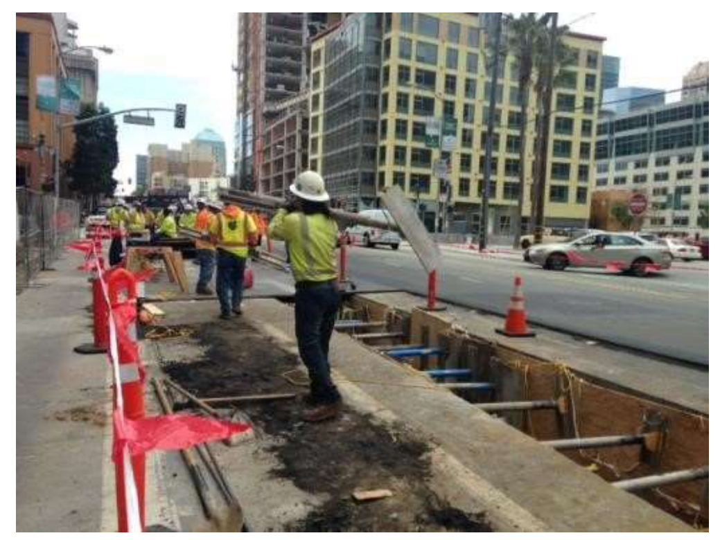
Figure 1 – Removing shoring from trench on Folsom Street. View south, July 2, 2015.