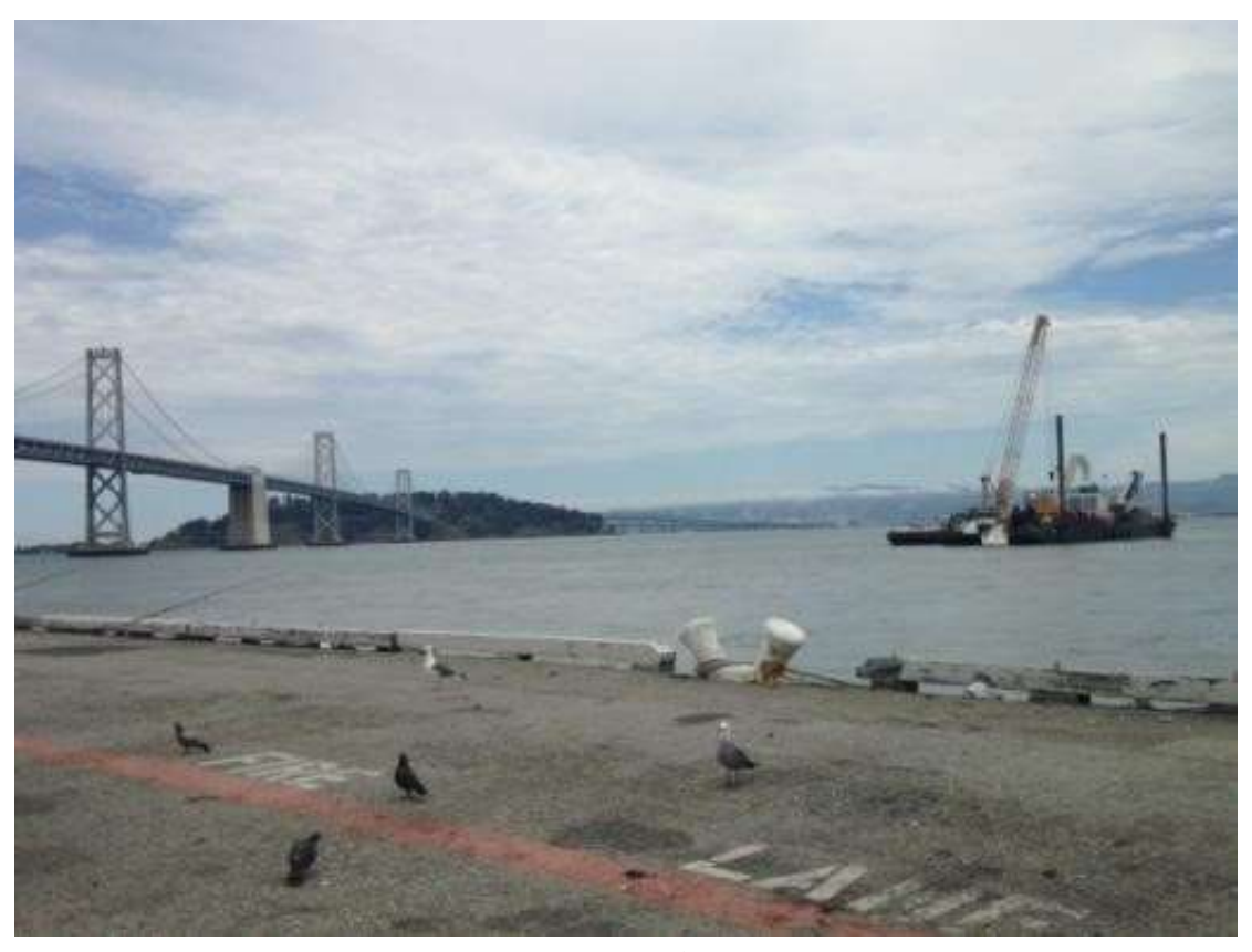
Figure 5 – Durocher positioning vessel off Pier 30/32 for submarine cable installation. View northeast, July 2, 2015.