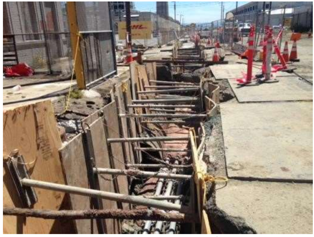
Figure 3 – Concrete slurry poured in duct bank trench on 23<sup>rd</sup> Street. View east, June 29, 2015.