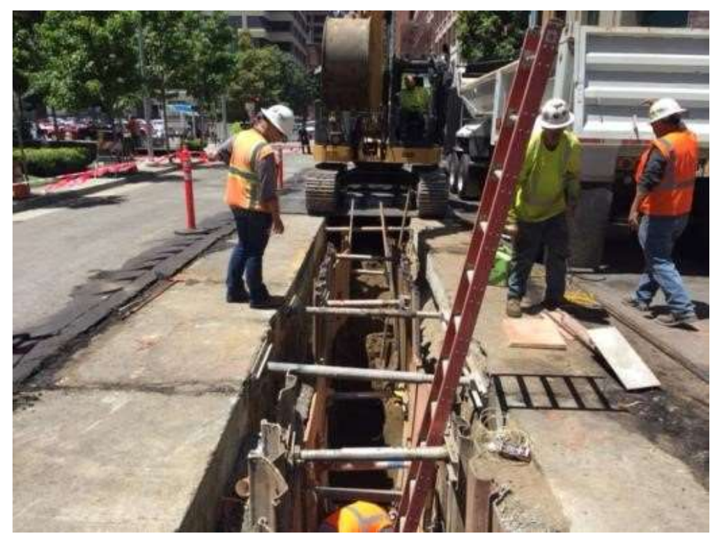
Figure 2 – Excavating duct bank trench on Spear Street. View west, June 30, 2015.