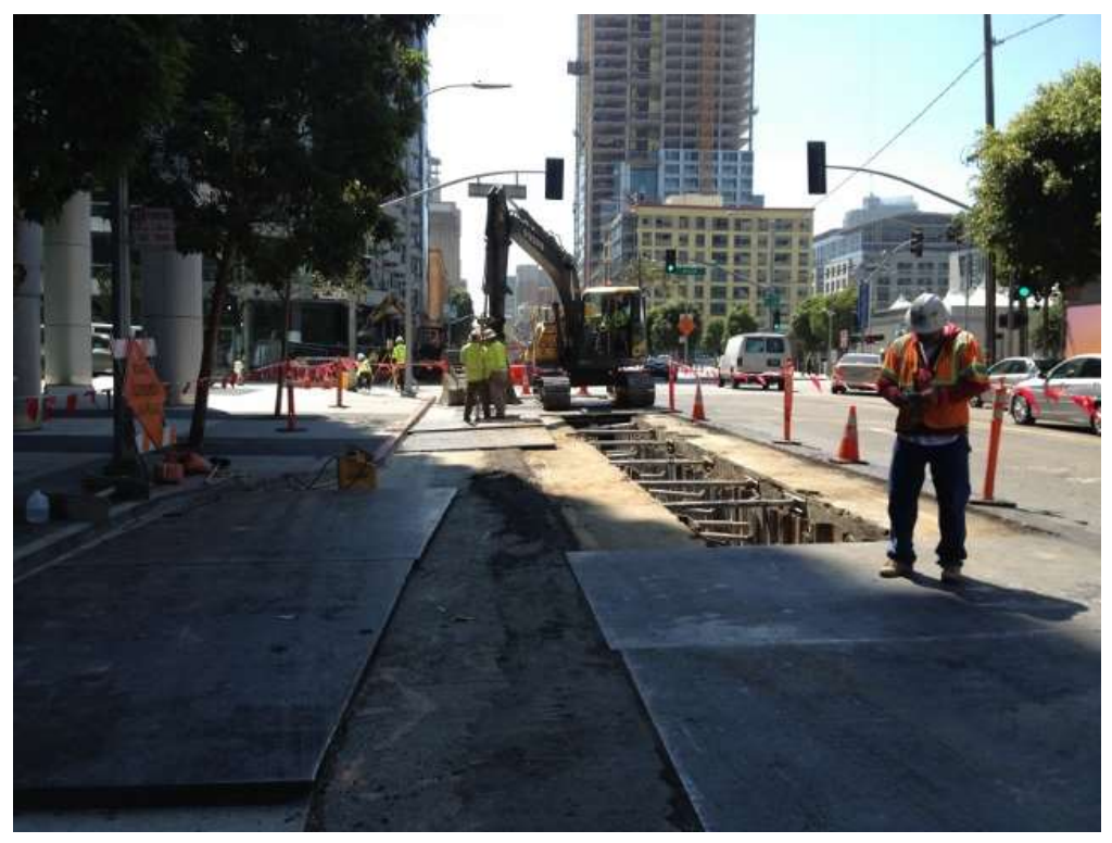
Figure 2 – Excavating duct bank trench on Folsom Street between Main and Spear Streets. View south, August 25, 2015.