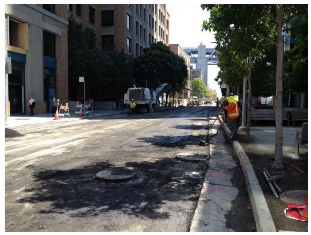
Figure 3 – Grinding asphalt and removing pavement on Spear Street. View east, August 25, 2015.