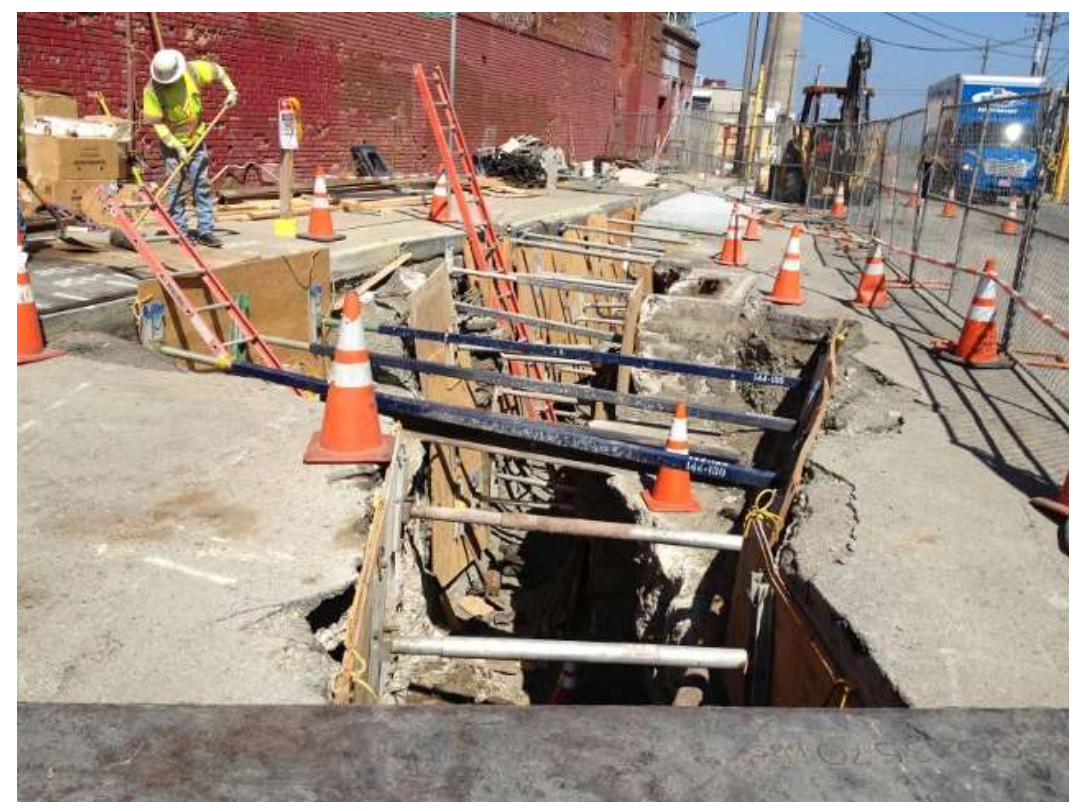
Figure 4 – Building wall in duct bank trench for Station A water circulation vault feature on 23<sup>rd</sup> Street. View south, August 25, 2015.