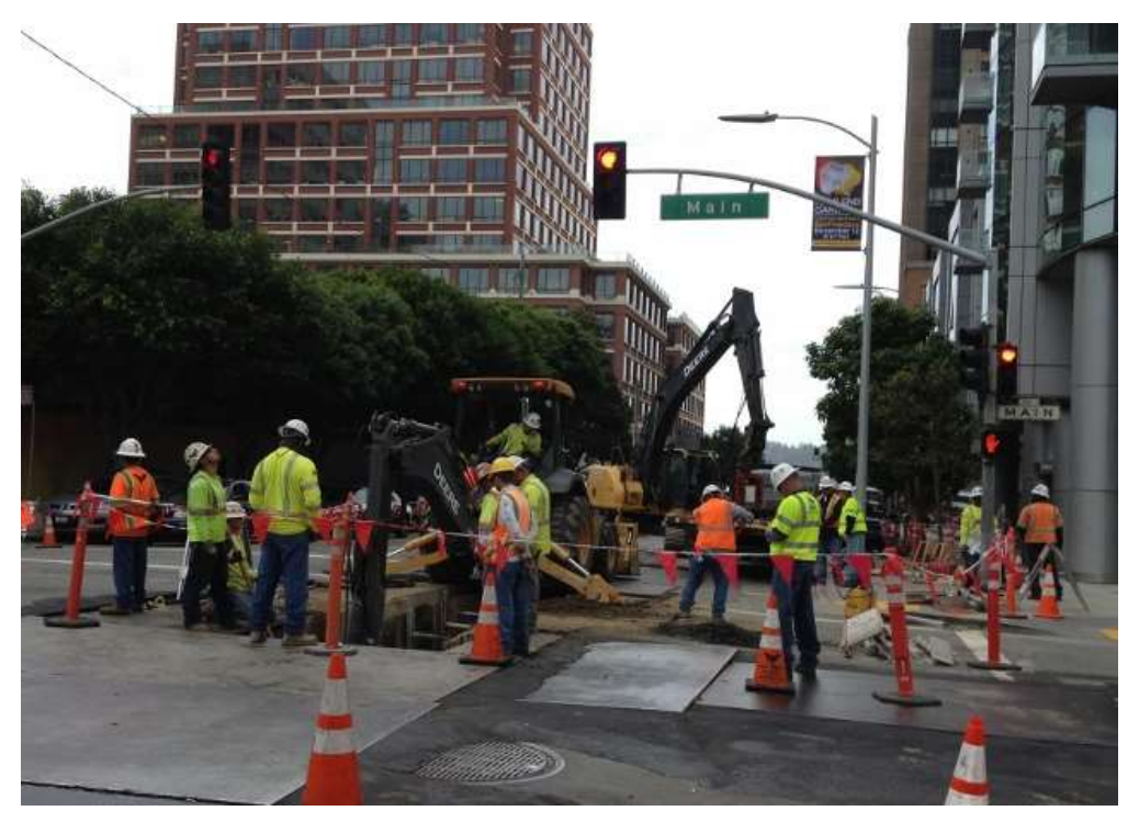
Figure 2 – Excavating trench and installing shoring on Folsom Street at Main Street. View north, October 15, 2015.