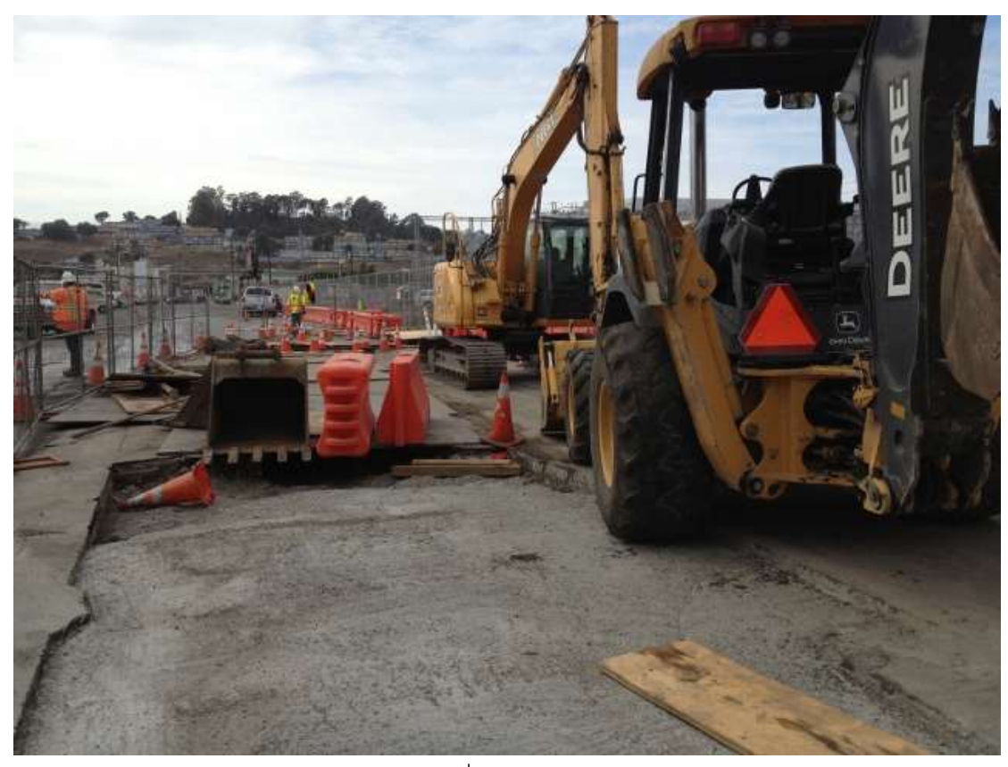
Figure 3 – Trench work on 23<sup>rd</sup> Street. View west, October 15, 2015.