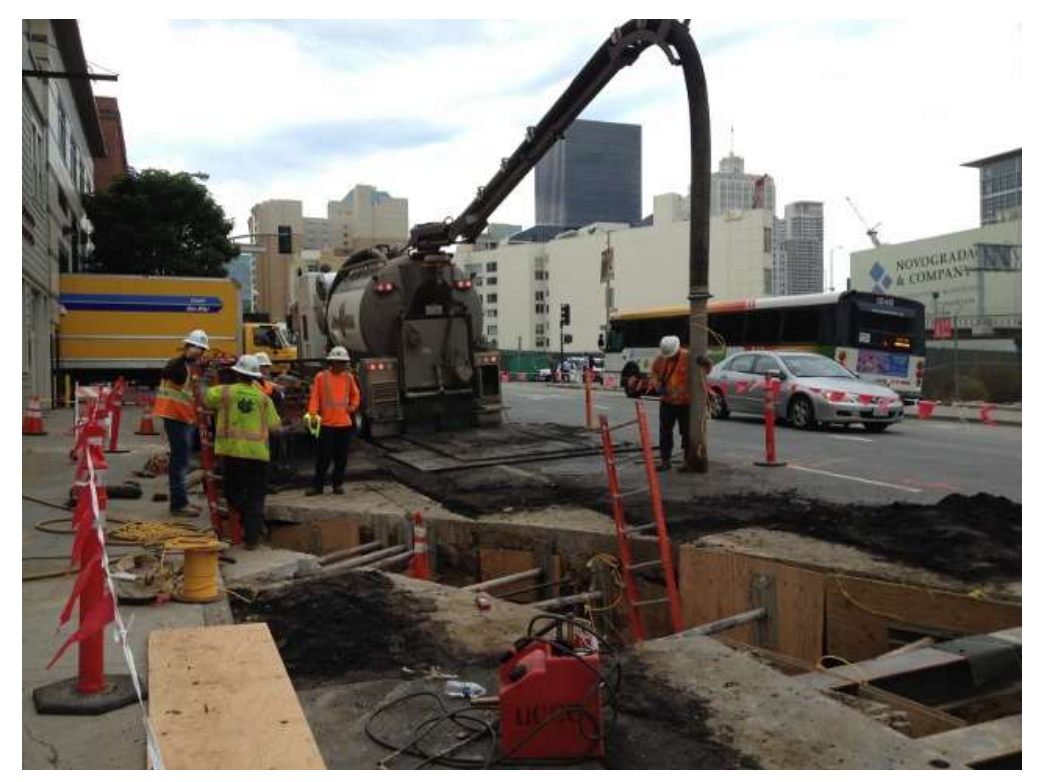
Figure 1 – Excavating the duct bank trench with a Vac-truck on Folsom Street just outside the new Embarcadero Substation addition. View southwest, October 15, 2015.