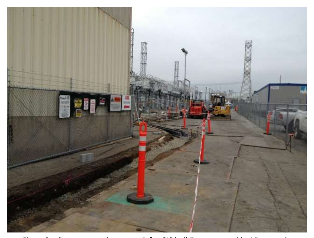
Figure 2 – Crews excavating a trench for GIS building power cable. View north,