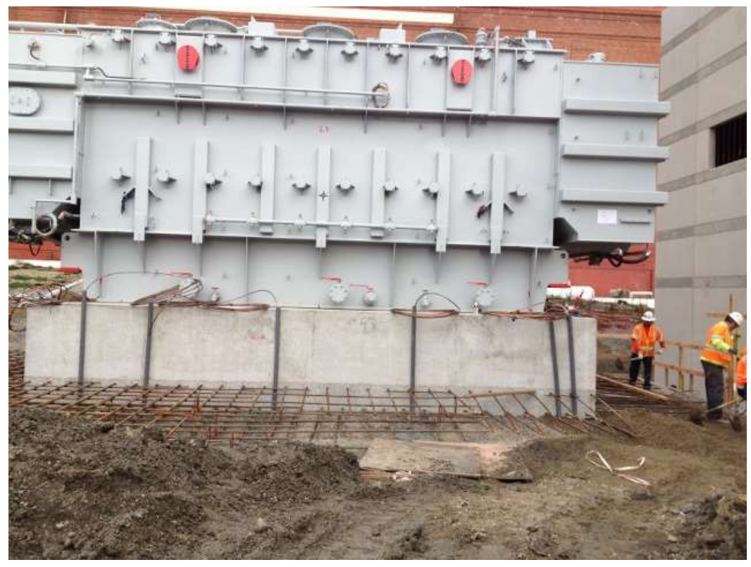
Figure 4 – APEC installing rebar at the transformer pad. View south, January 28, 2016.