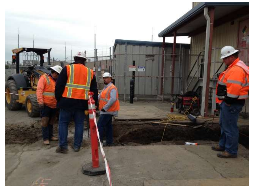
Figure 3 – Crews excavating a trench for GIS building power cable. View south, January 28, 2016.