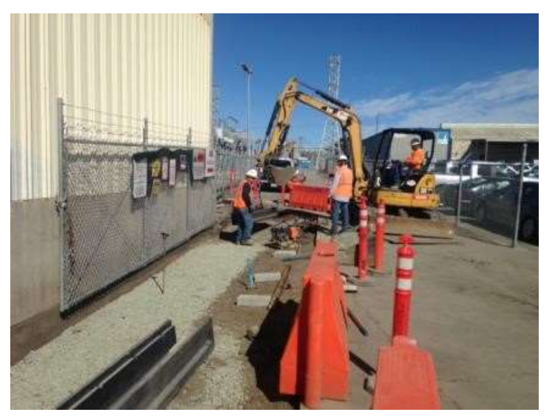
Figure 2 – Crews installing cable trays for the cable trench. View north, March 1, 2016.