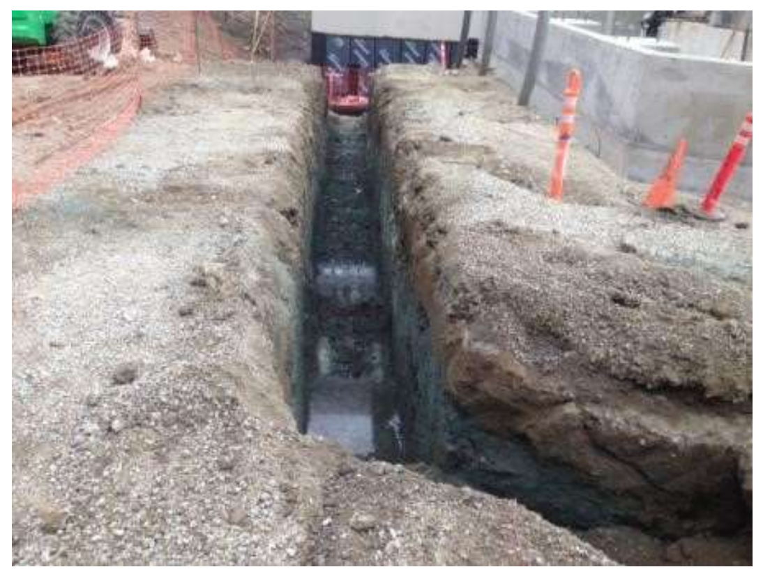
Figure 3 – Crews excavated near the transformer pad. View east, March 3, 2016.