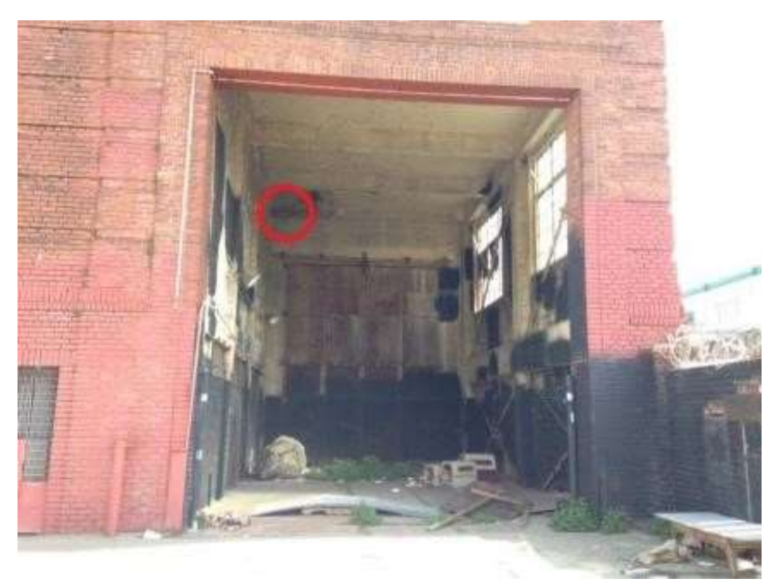
Figure 4 – Common raven nest start in Station A building adjacent to southeast corner of Potrero Switchyard. View east, March 2, 2016.