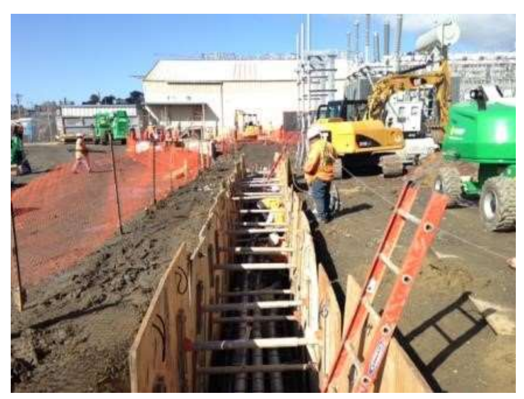
Figure 1 – APEC installing conduit in duct bank trench in the Potrero Switchyard. View west, March 22, 2016.