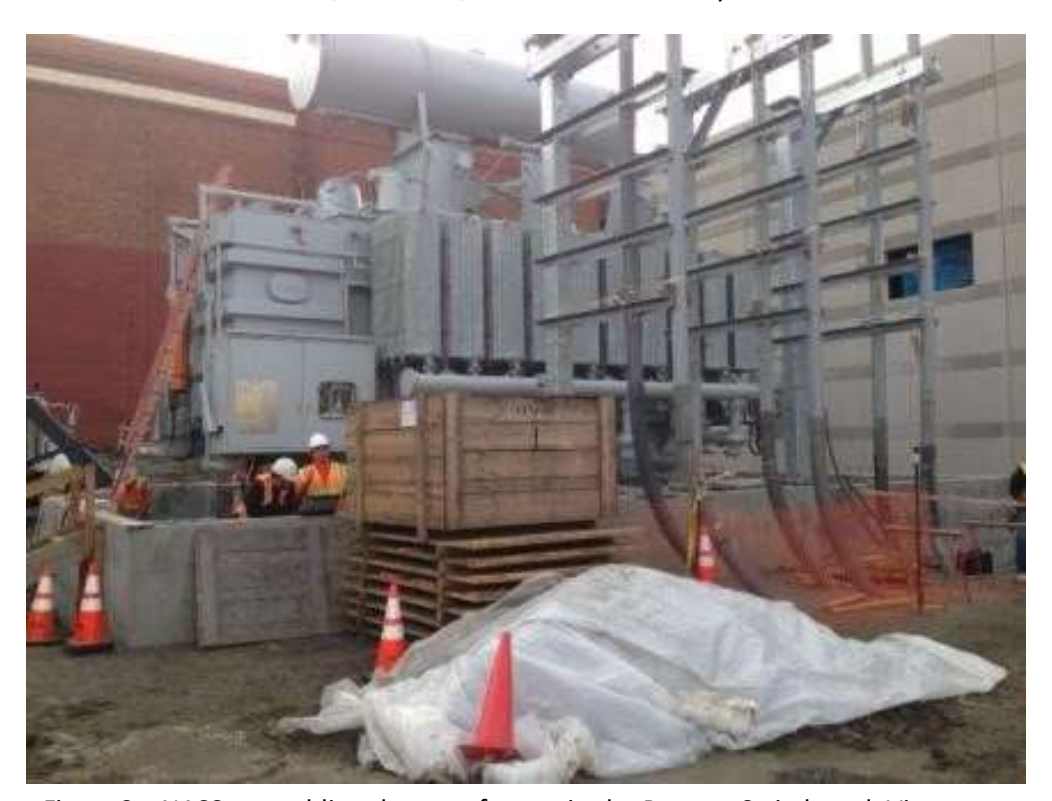
Figure 2 – NASS assembling the transformer in the Potrero Switchyard. View east, March 23, 2016.