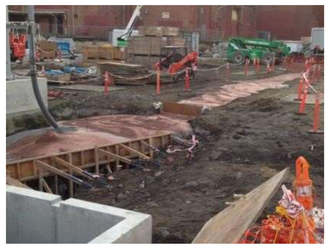
Figure 3 – Proven backfilling duct bank trench with cement slurry in the Potrero Switchyard. View east, March 23, 2016.