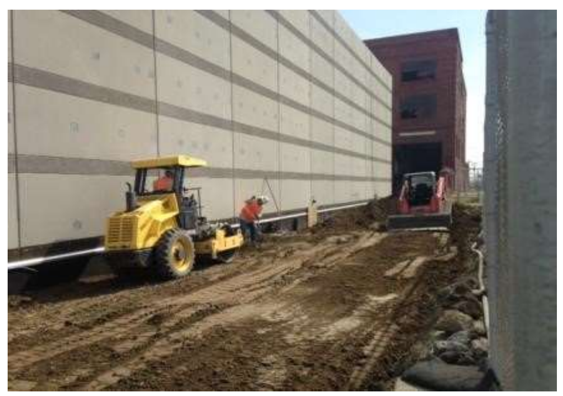
Figure 1 – APEC compacting backfill around the GIS building. View east, May 2, 2016.