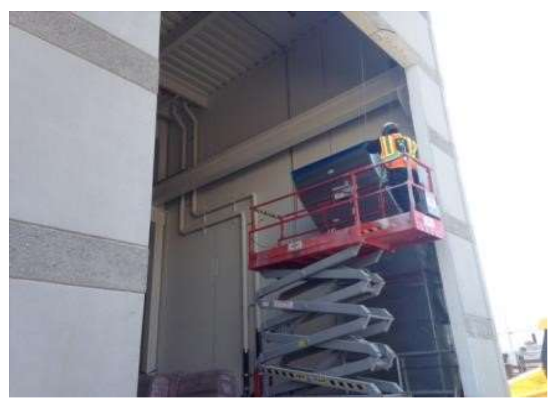
Figure 2 – CER installed infrastructure inside the GIS building. View southeast, May 2, 2016.