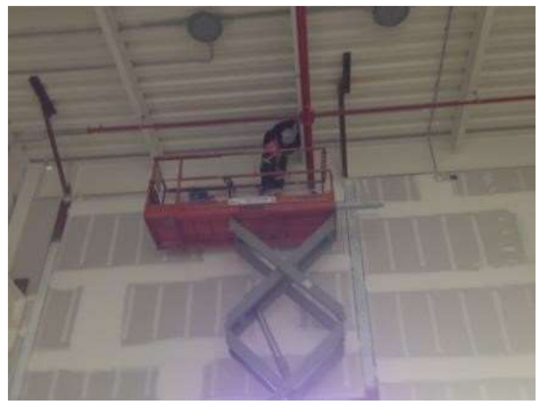
Figure 3 – Cosco installing sprinklers in the GIS building. View south, May 4, 2016.