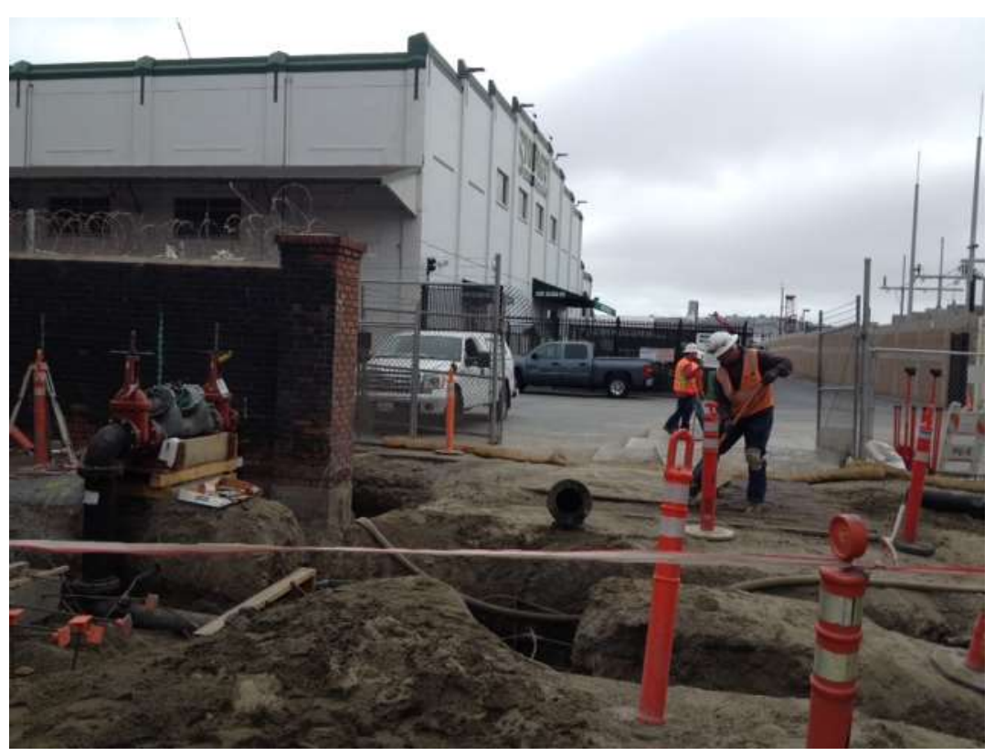
Figure 4 - APEC excavated and installed water/sewer pipe near SE corner of the GIS building, September 1, 2016.