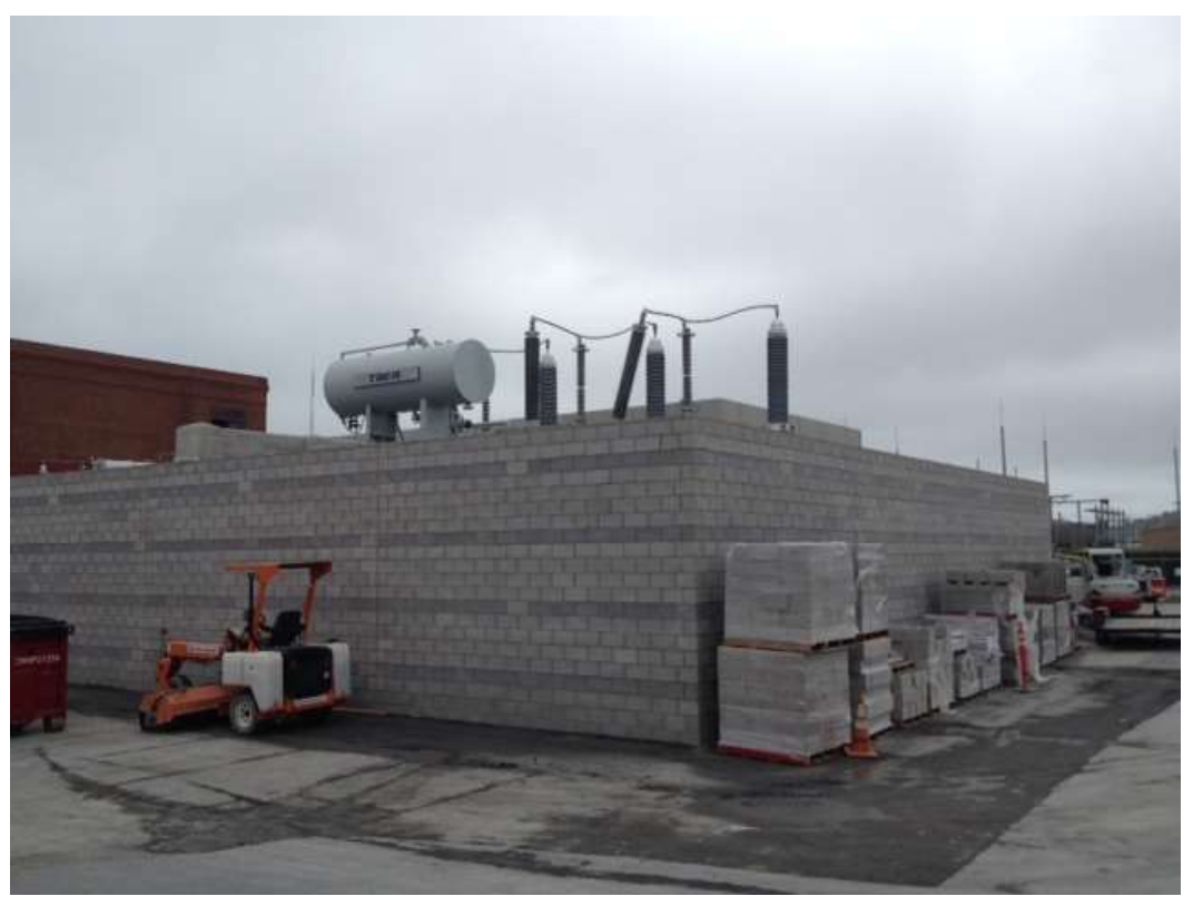
Figure 3 - Spencer Masonry building perimeter wall in Potrero Switchyard, September 1, 2016.