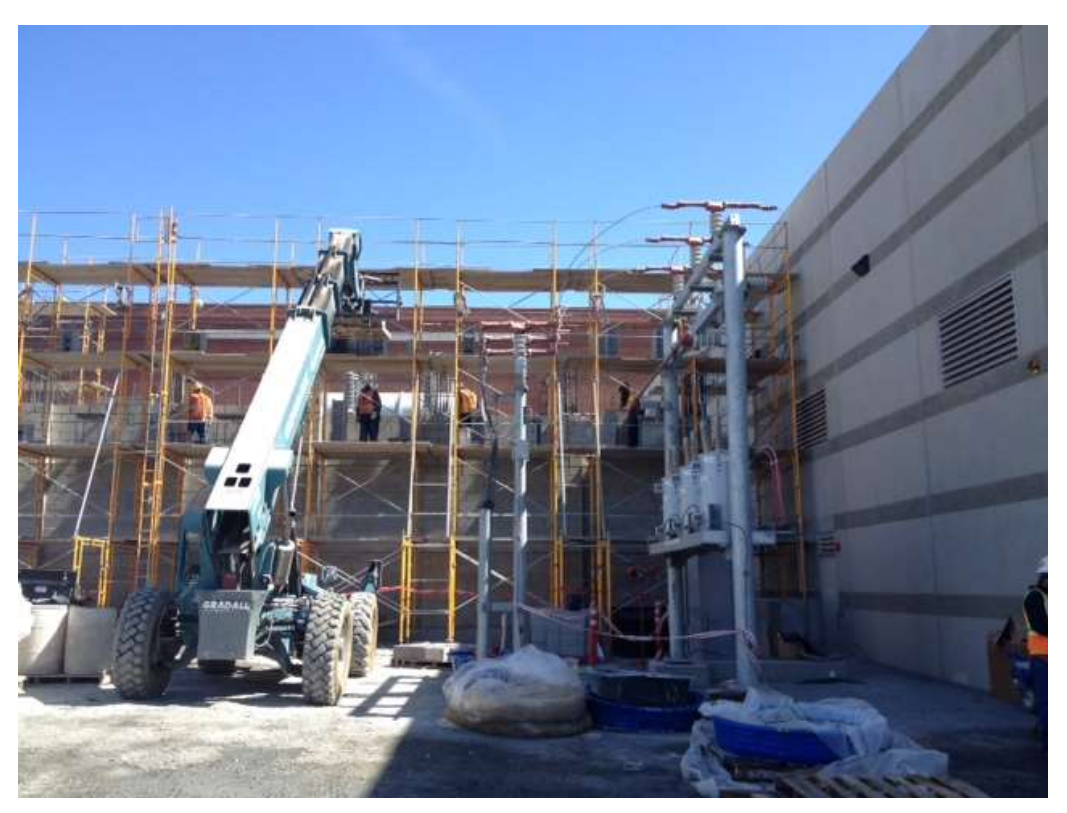
Figure 2 – Spencer Masonry building fire wall on west side of transformer, September 21, 2016.