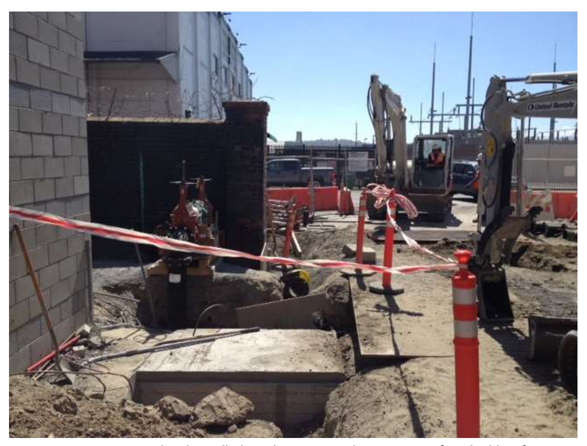
Figure 3 - APEC excavated and installed conduit near southeast corner of GIS building for water and sewer tie-in, September 21, 2016.