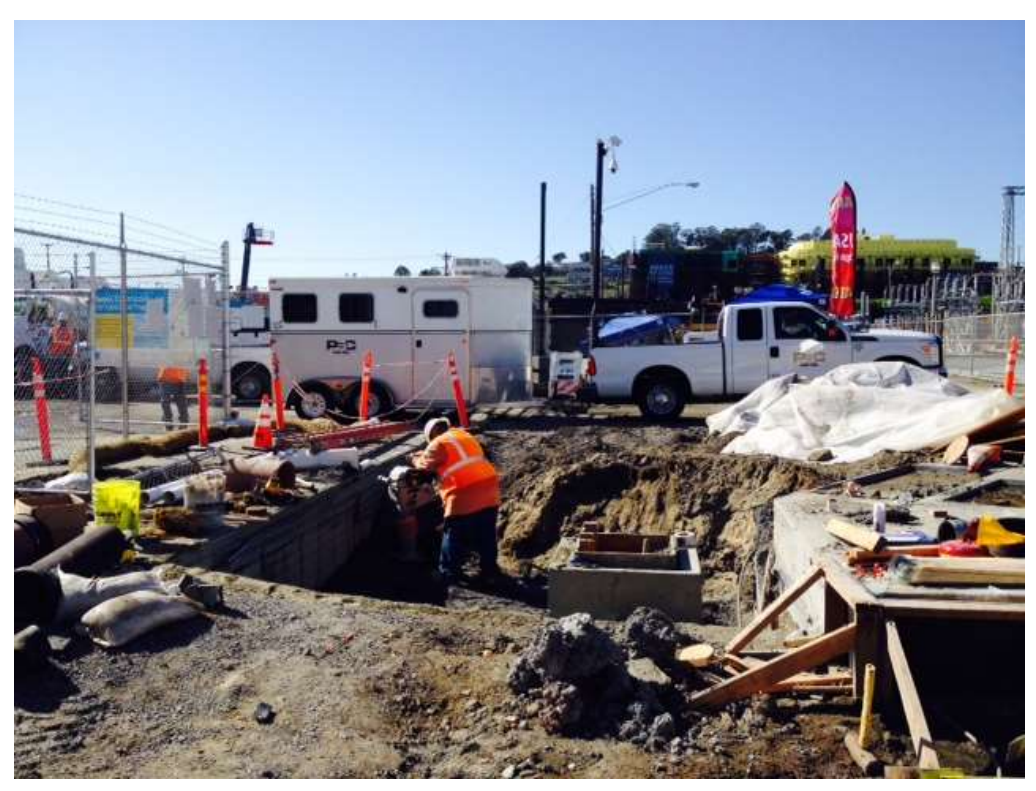
Figure 2 - APEC backfilling around the water and sewer tie-in near the southwest corner of the GIS building, October 26, 2016.