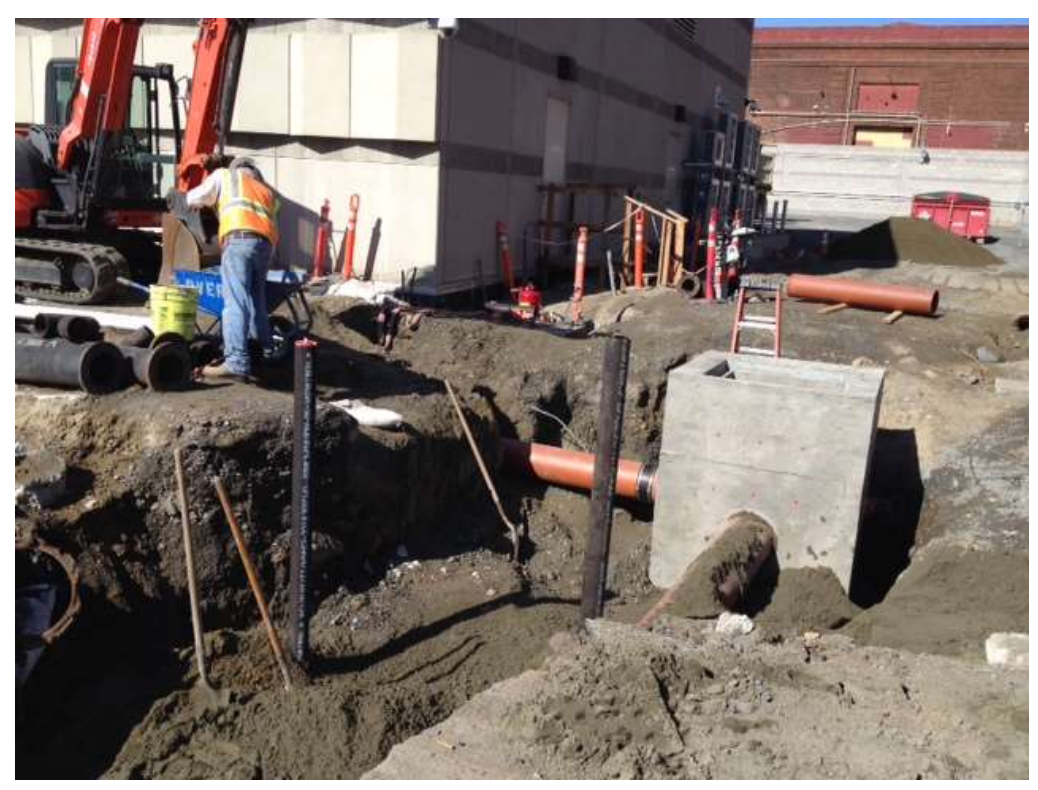
Figure 1 – APEC backfilling around the water and sewer tie-in near the southeast corner of the GIS building, October 26, 2016.