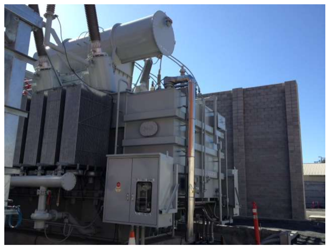
Figure 3 – Wall around the transformer completed and all electrical work done, October 26, 2016.