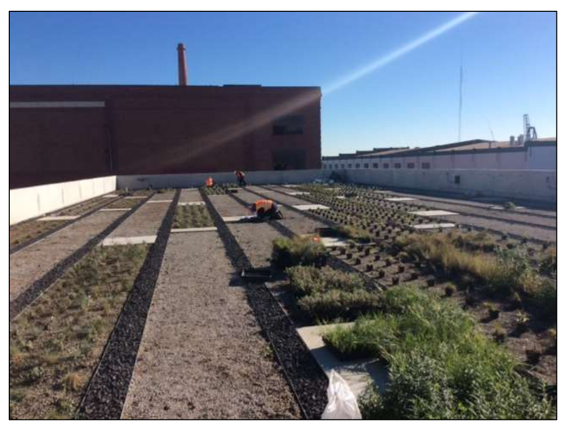
Figure 3 – Planting vegetation on the roof of the GIS building, November 18, 2016.