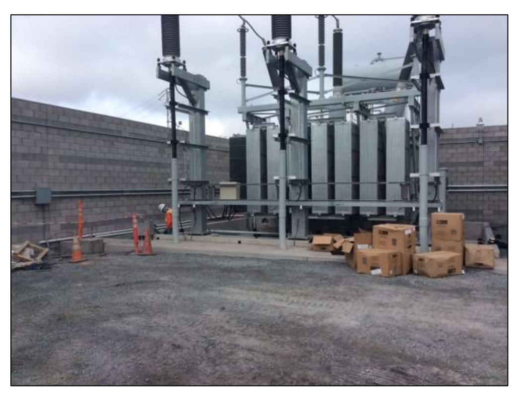
Figure 2 – APEC installing grating in reactor containment, November 15, 2016.