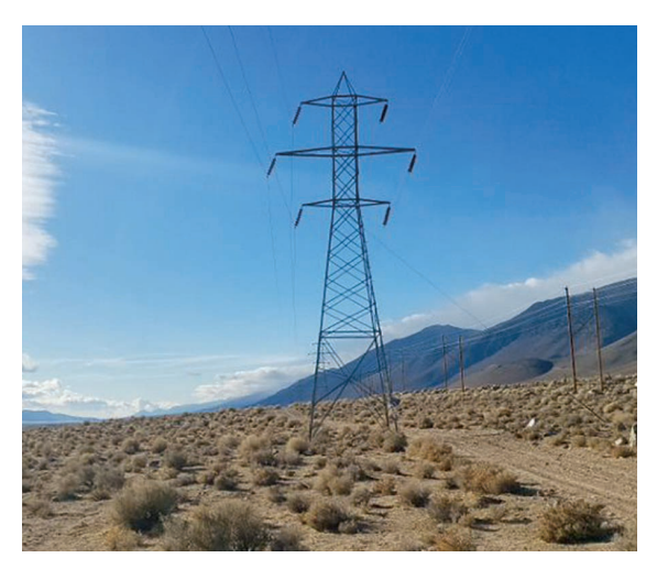
SCE will work with the Bureau of Land Management to protect environmental and recreational resources during construction.