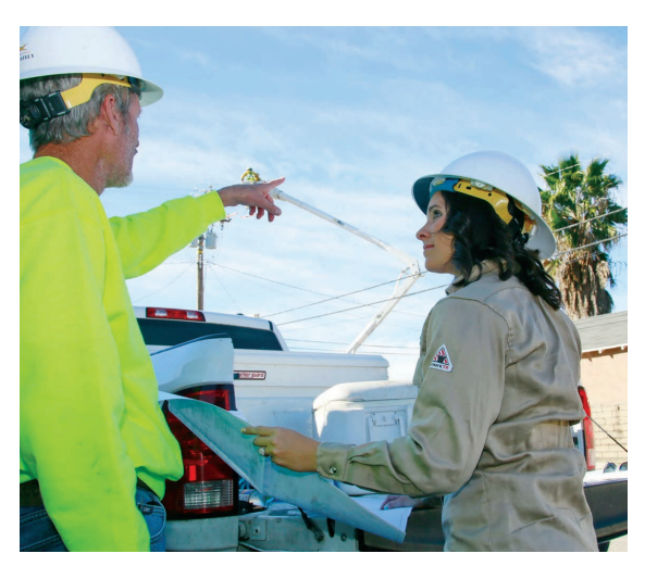
The project, which is in initial planning, will follow standards of the California Public Utilities Commission.