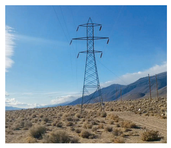
SCE will work with the Bureau of Land Management to protect environmental and recreational resources during construction.