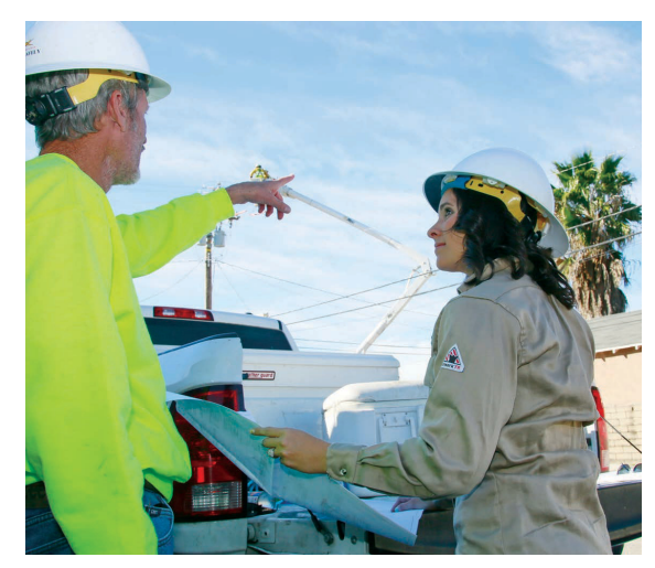
The project, which is in initial planning, will follow standards of the California Public Utilities Commission.