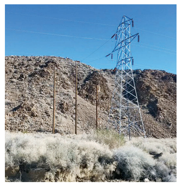
The Ivanpah-Control Project will enhance safety in portions of Mono, Inyo, Kern, and northern San Bernardino counties.