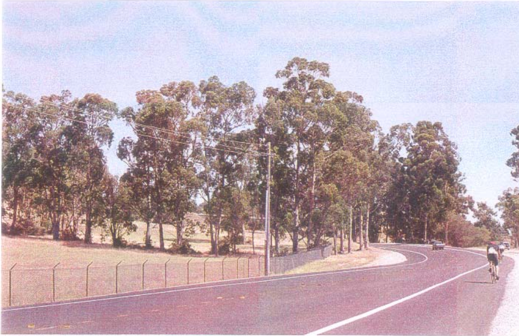
Existing view from southbound Cañada Road south of Edgewood Road