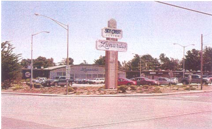
Visual A-4 Existing Visual Conditions at San Bruno near Transition Station site Jefferson - Martin 230kV Transmission Project