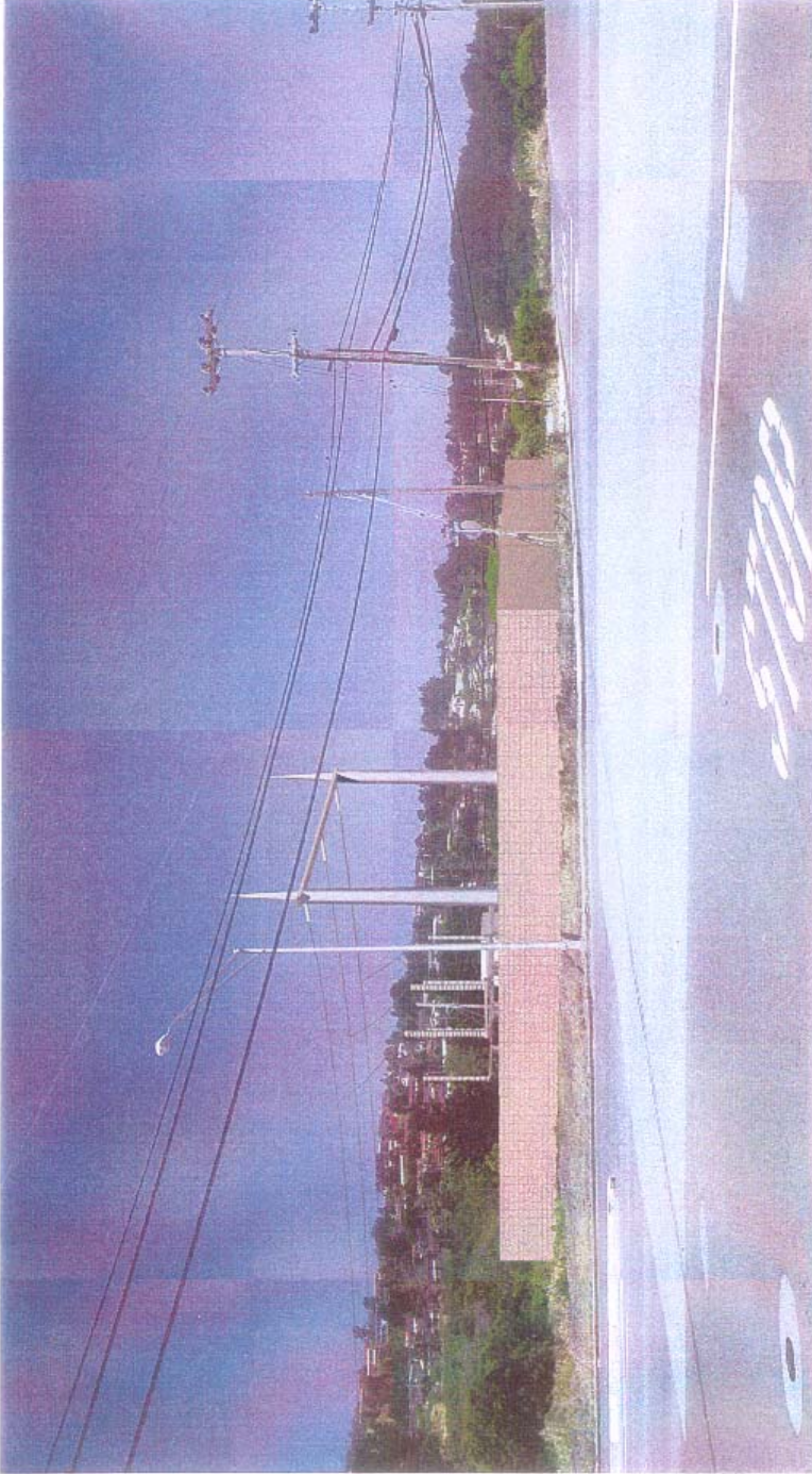
Visual A-2a Corrected Visual Simulation of the Proposed Transition Station Jefferson - Martin 230kV Transmission Project