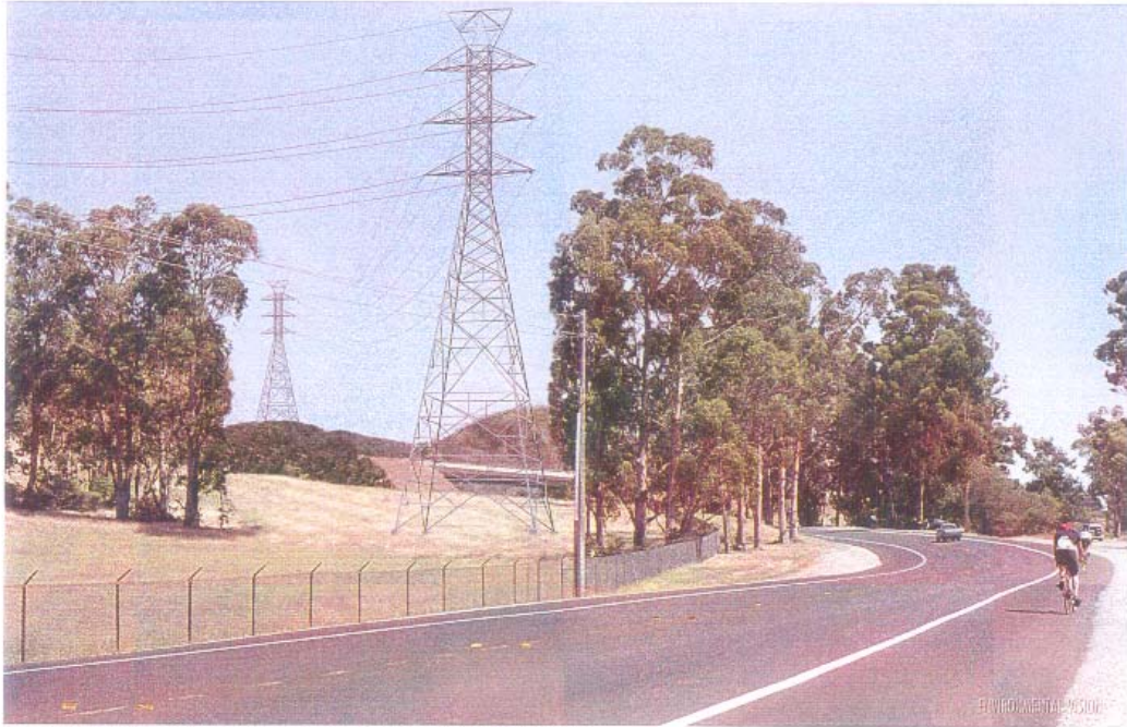
Conceptual simulation of the Partial Underground Alternative