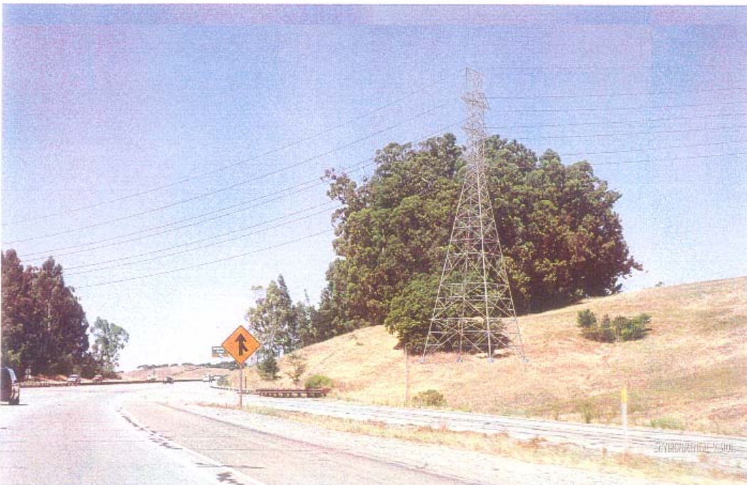
Conceptual simulation of the Partial Underground Alternative