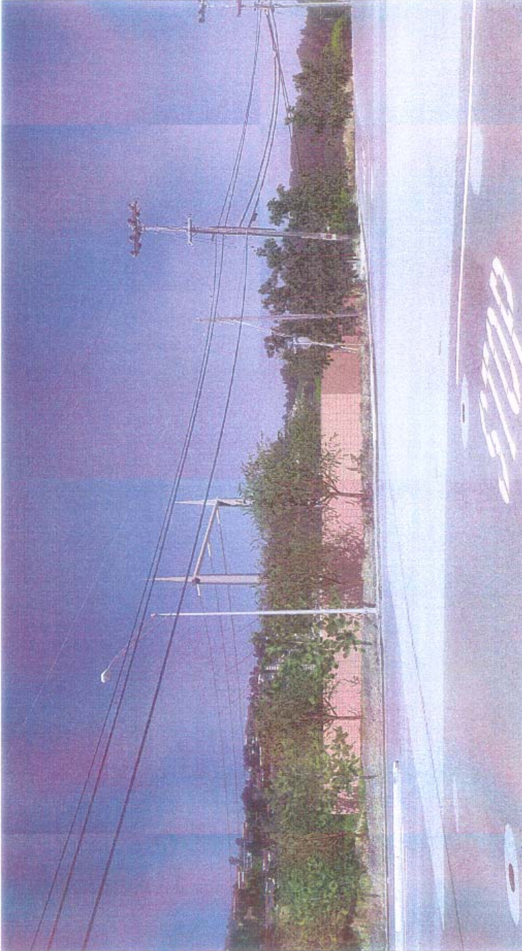
Visual A-2b Corrected Visual Simulation of the Proposed Transition Station with Landscaping Jefferson - Martin 230kV Transmission Project