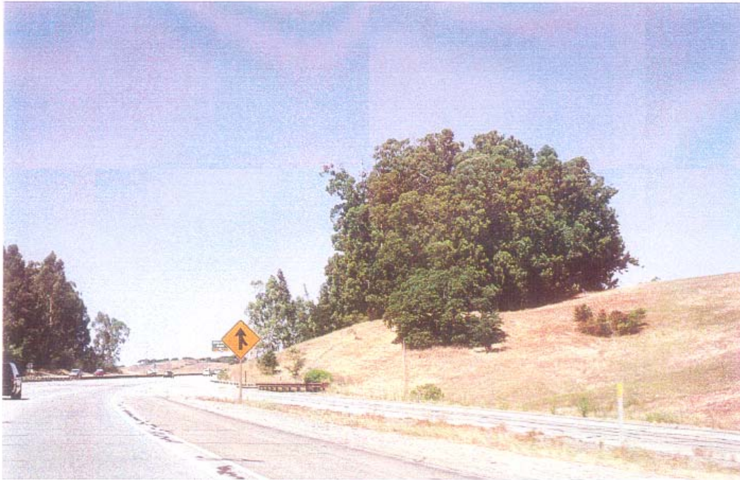
Existing view from northbound I-280 near Edgewood Road