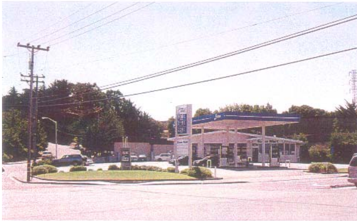
Econo Gas Station