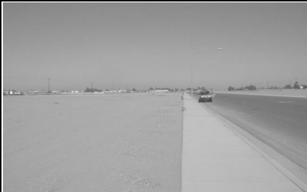
Photo C. View of Industry Way Looking North from Front (East) of Project Site.