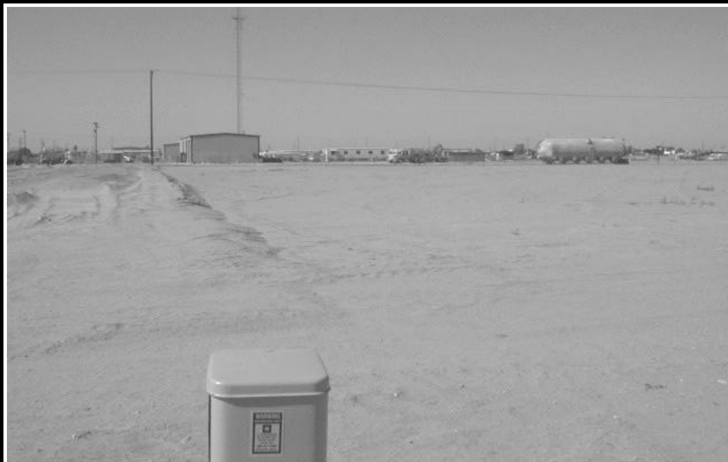
Photo B. View of Project Site Looking West.