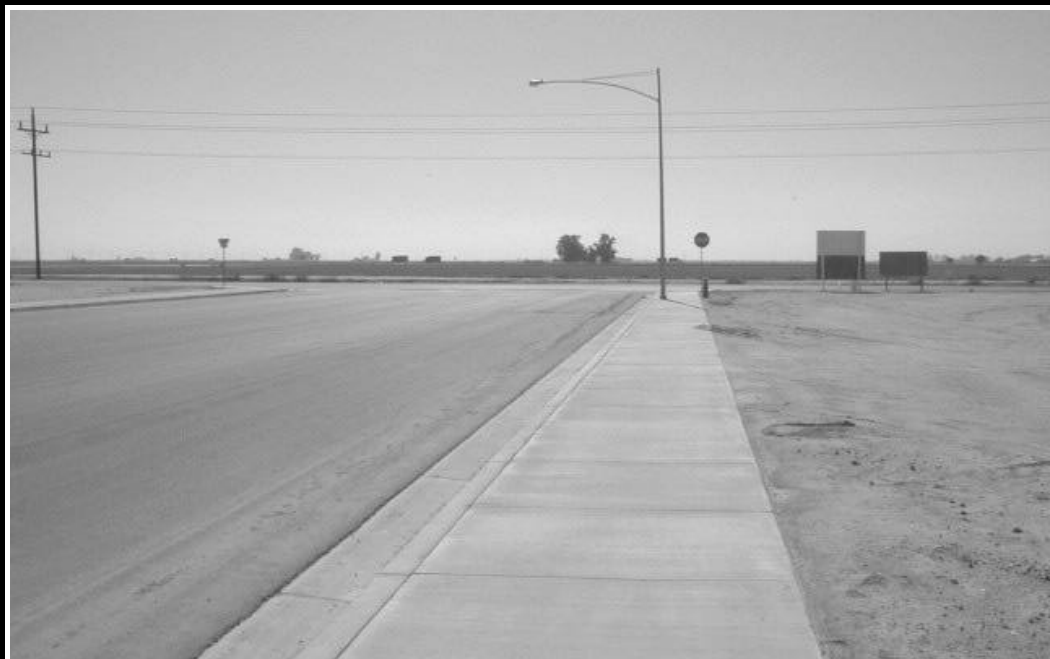
Photo D. View of Intersection of Industry Way and Ross Road, Looking South from Front of Site.