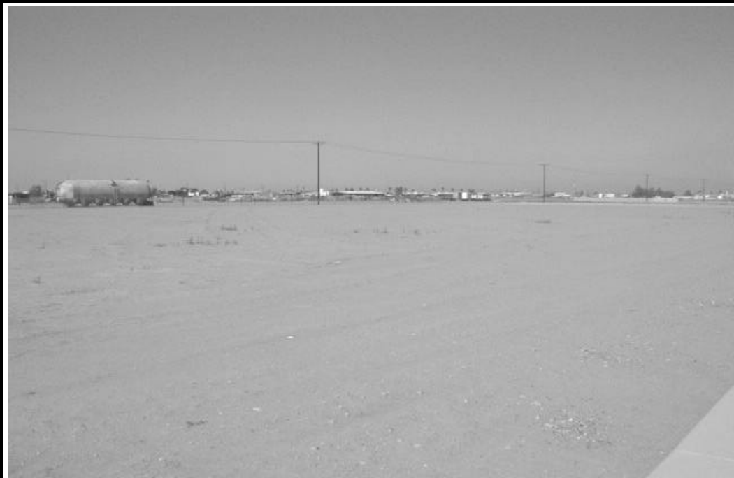
Photo A. View of Project Site Looking Northwest.